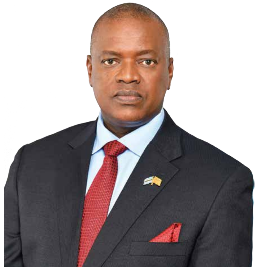
His Excellency, Dr Mokgweetsi Eric Keabetswe Masisi, MP PRESIDENT OF THE REPUBLIC OF BOTSWANA

GUC management and staff wish to congratulate the President of the Republic of Botswana Dr MEK Masisi for his 5th anniversary in office.