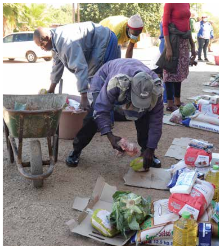
Residents of Tsholofelo ward in Gaborone receiving food rations during COVID-19 in 2020.