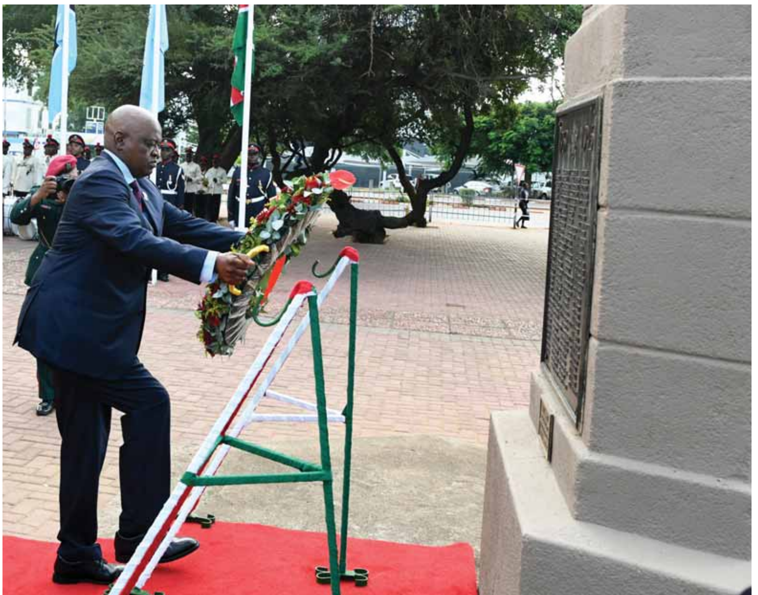
President Dr Mokgweetsi Masisi laying a wreath during Fallen Heroes Day commemoration in Gaborone yesterday. Initially known as Lesoma commemoration in remembrance of the 15 Botswana Defence Force soldiers who died in the February 27, 1978 ambush by the Rhodesian regime, it has since been changed to Fallen Heroes Day to recognise all who died in the line of duty.

Sport First division south league heats up Page 23