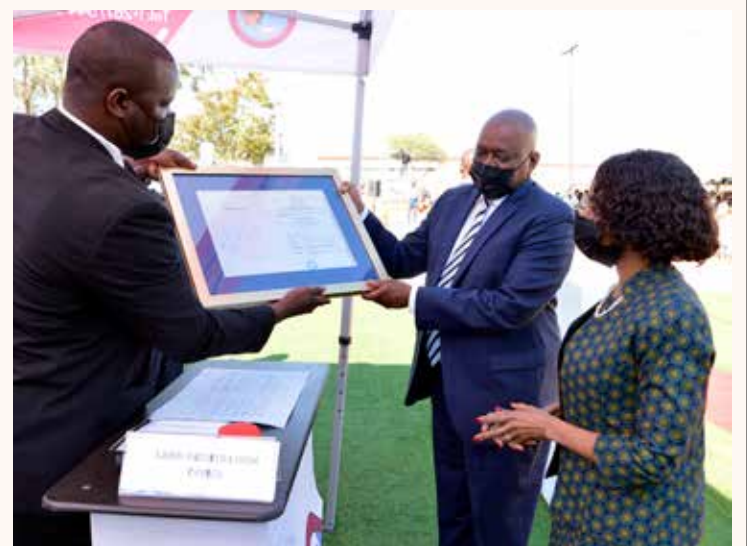
President Masisi launching secure land title certificate

Another first under his leadership, was the country introducing policy on the change of land use to enable Botswana to utilise their land for economic benefits, a move that witnessed a number of them venturing into Agro-tourism ventures and hosting events. This became possible following the review of Botswana land Policy of 2019.