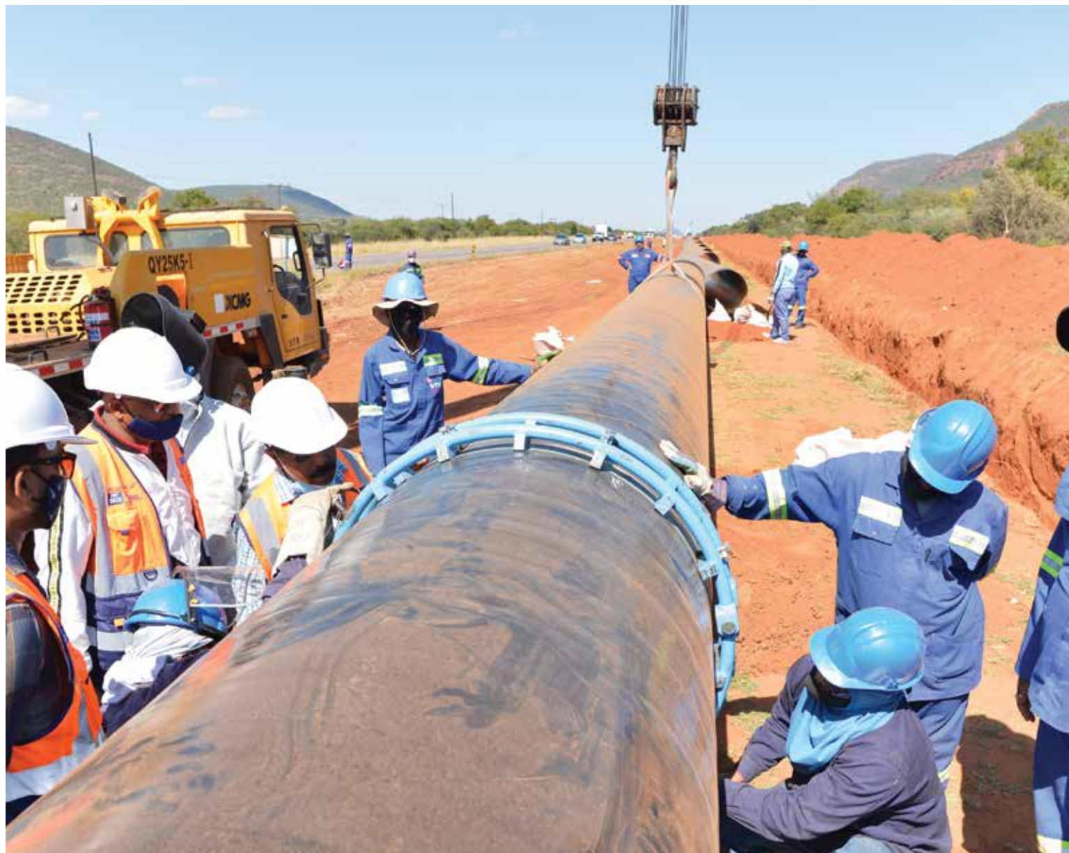
Masama - Mmamashia 100-kilometre pipeline complete.

to benefit and a further 170 000 would benefit from improved wastewater treatment and sludge management systems.