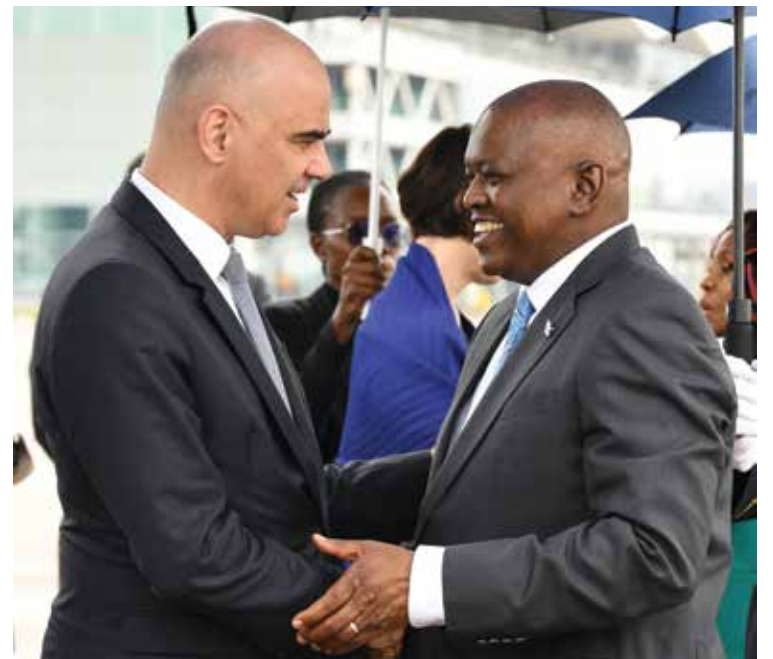
The visit by President of the Swiss Confederation, Mr Alain Berset underlined Botswana’s continued global recognition.

Effort to save Botswana from a pandemic, for citizens to have a mindset change, to be more efficient, more enterprising, to have an efficient government and a private sector engaged in the value chain addition of natural resources within a digitised world, could underline those first five years in office.