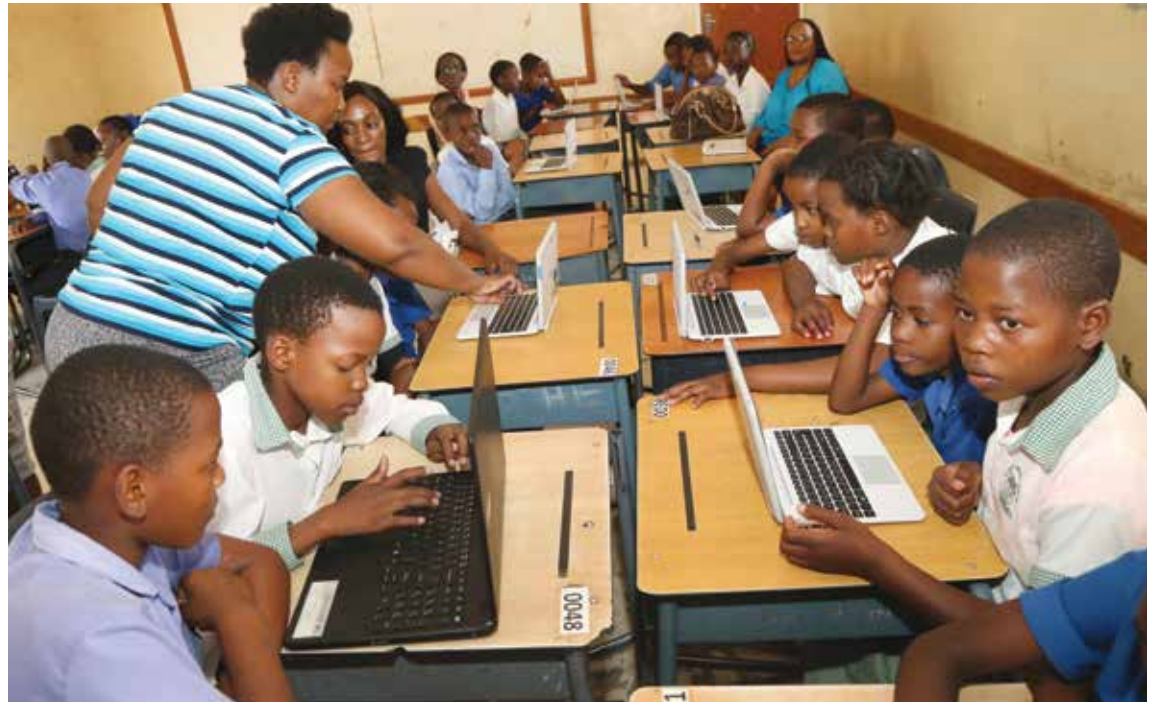
One of the massive successful projects to embrace digitalization at the grassroots level was through distribution of ICT gadgets that included laptops and tablets, and also to connect the Internet at all local public schools.