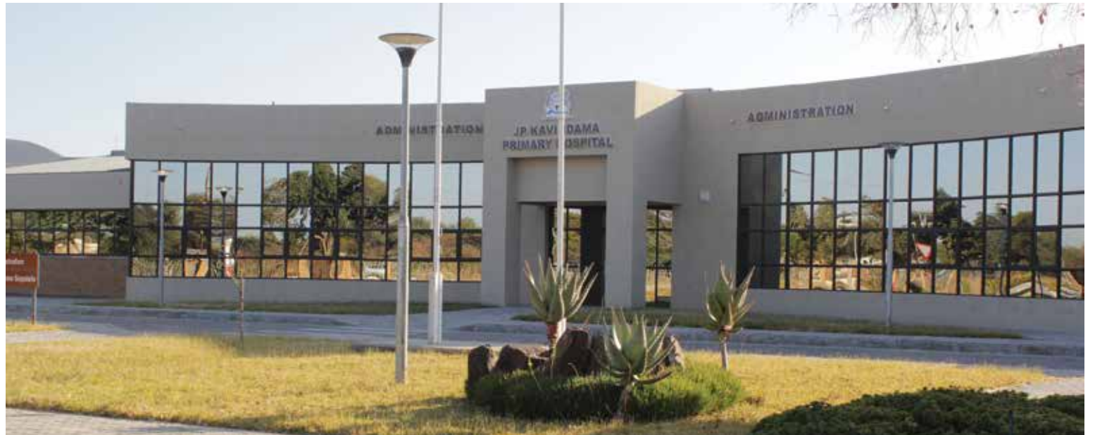
J.P Kavindama Hospital in Shakawe

Recently the facility transitioned into the second phase by the opening of some specified services that include