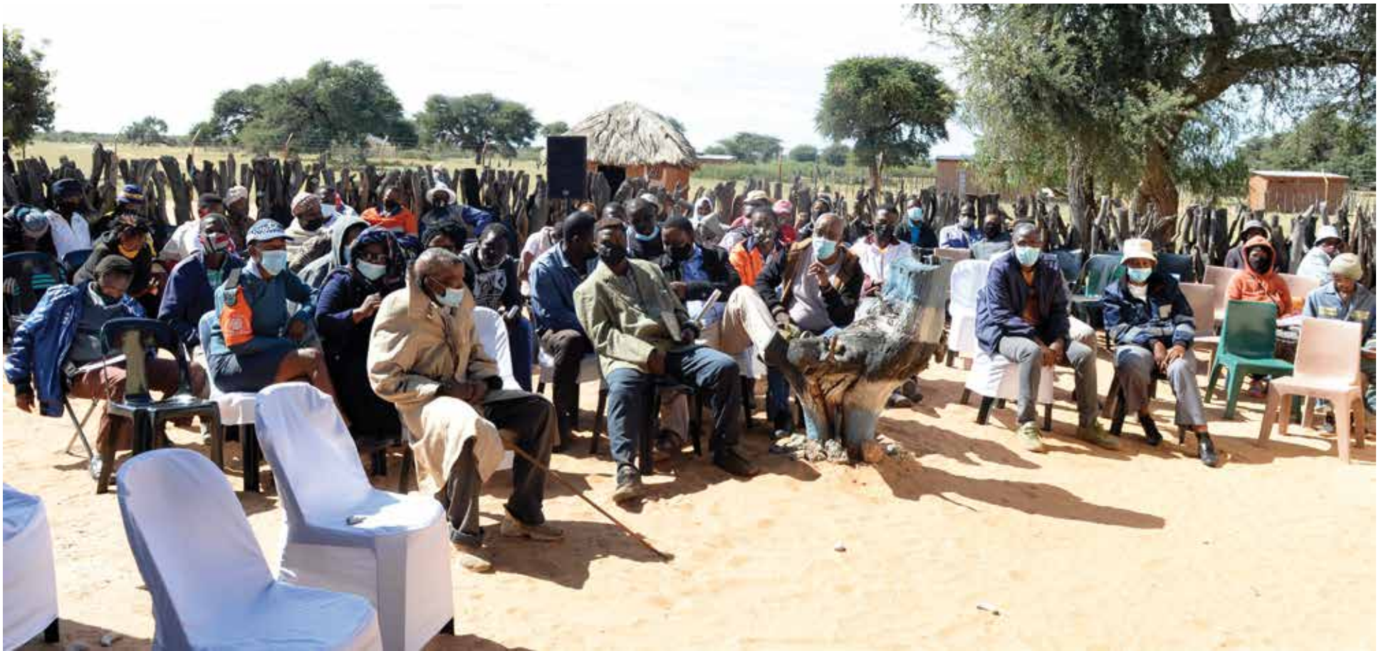
Residents of Ukhwi during a kgotla meeting on the Presidential Commission of Enquiry into the Review of the Constitution.