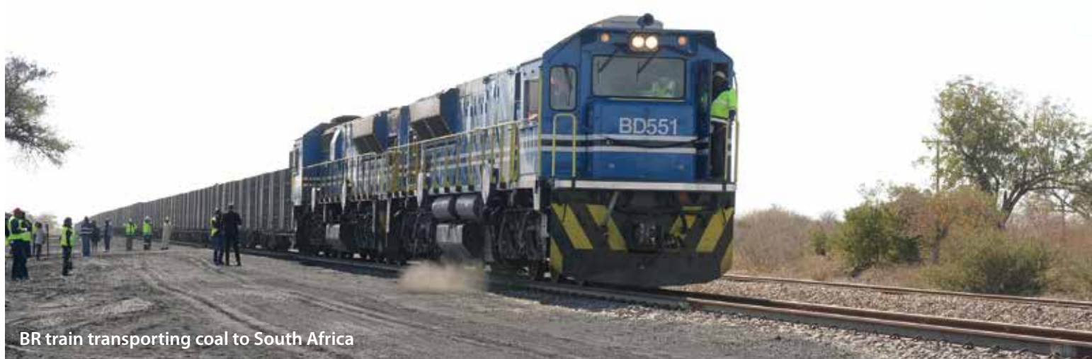
BR train transporting coal to South Africa

He pointed out that the newly constructed bridge cancelled the restriction of movement for residents of Okavango that was in the past imposed by the schedule of time the pontoon operated with.