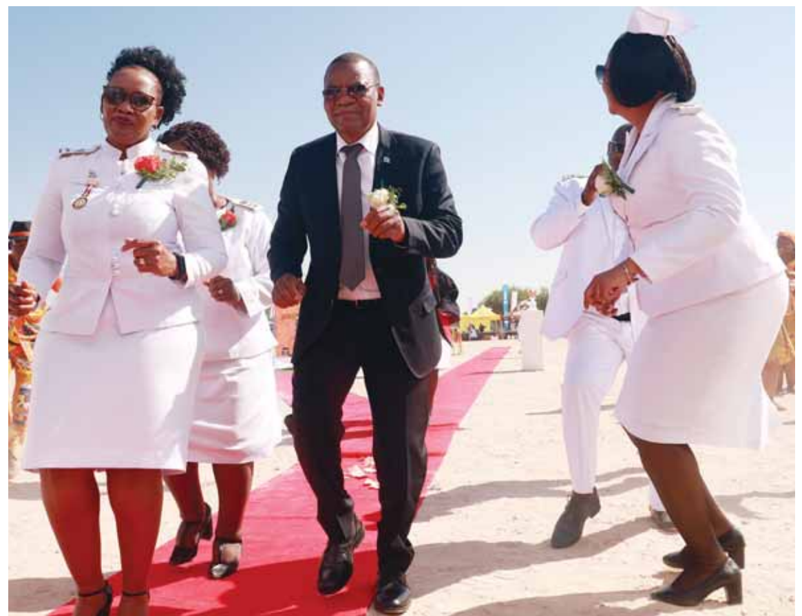
Vice President Slumber Tsogwane (centre) performing the Namastaap dance with some members of nursing fraternity during Botswana Nurses Day commemoration in Tsabong yesterday. He said the nurses' contribution in the communities and the economy as a whole was immense through the ripple effect that their work had on other sectors.

"The consolidated average realised price increased by 23 per cent, reflecting a change in the sales mix towards higher value rough diamonds and the benefit of the price adjustment in Sight 1 of 2024, which helped improve demand in higher price categories," says the media release. BOPA