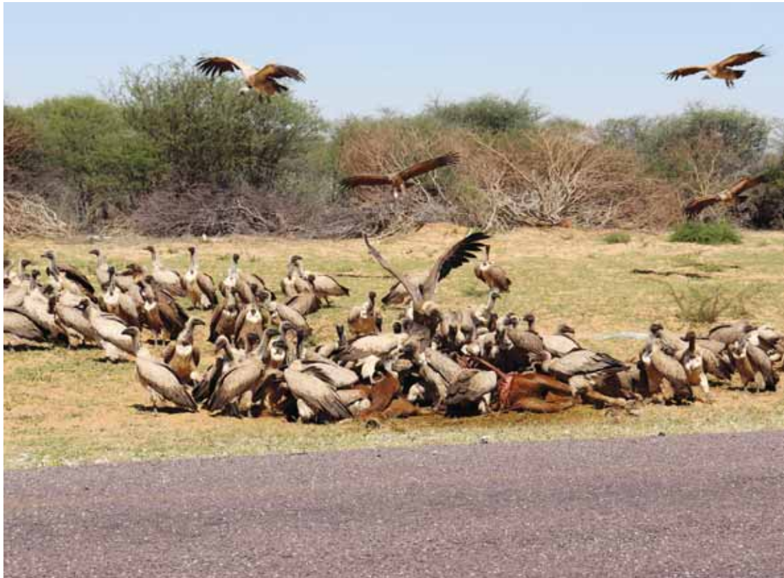
Vultures feeding on horse carcasses along the Trans-Kalahari Corridor recently. Wildlife warden, Mr Othaile Kwenamang from Department of Wildlife and National Parks in Ghanzi implored communities not to poison carcasses in a bid to protect the vulture species as they were facing extinction.