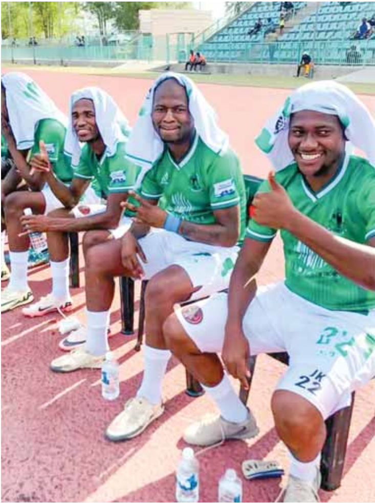
Sankoyo Bush Bucks during a previous game. The team lost crucial points after an administrative error over a double-booked stadium.

"We are hopeful that we will rise up in the log standings despite suffering deduction of points"