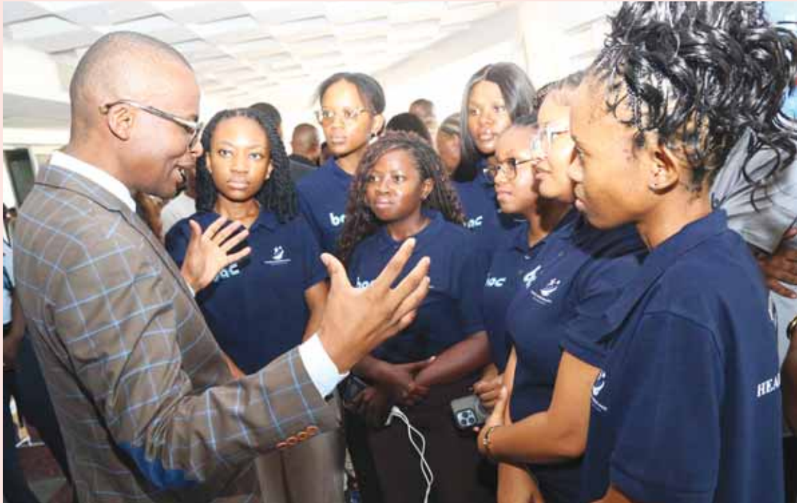
Vice President and Minister of Finance, Mr Ndaba Gaolathe (left) interacting with Botswana Accountancy College students during the Budget Pitso for the Youth in Gaborone on Tuesday. He emphasised the need for sector-specific innovations and the development of inclusive ecosystems to fund diverse businesses, adding that small-scale enterprises should be encouraged to work in groups and form partnerships.

As the country confronts an uncertain global environment and the limits of its traditional growth engines, the choices made now in policy, investment and human capital will determine whether Botswana’s “new normal” becomes a story of resilience and reinvention, or one of missed opportunity. BOPA