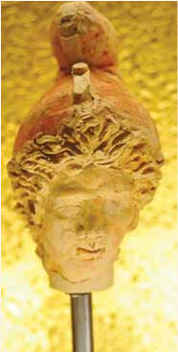
TUNIS - An exhibit at the Bardo National Museum in Tunisia. The exhibition features archaeological pieces, including sculptures, fragments and terracotta from the site of Zama.

Archaeologists in Xi'an, capital of northwest China's Shaanxi Province, have unveiled a well-organized Western Han Dynasty (202 BC-25 AD) settlement during the excavation of the Sanjiu relic site, according to an announcement by the Shaanxi provincial institute of archaeology. Located 0.6 kilometers to the eastern wall of the ancient Chang'an City, the Sanjiu relic site sits in Xi'an's Weiyang District. The excavation in 2025 also uncovered a Northern Wei cemetery, Song Dynasty graves, and Qing Dynasty pottery kilns. The Western Han settlement, spanning from the mid-Western Han to the Xin Dynasty, was bisected by a north-south ditch. East of the ditch, eight large courtyard-style houses stood along a cross-shaped road network, collectively forming a central hub for food processing. West of the ditch included bone-processing and smelting workshops alongside dwellings, yielding 78 kilograms of bone and shell materials, iron tools, and ornaments such as bone earrings and shell beads, evidence of a possible jewelry workshop. "The settlement reveals previously unknown aspects of suburban organisation near Chang'an City," - said Zhang Yanglizheng, head of the project, emphasizing its value for studying Western Han social structures. Xinhua