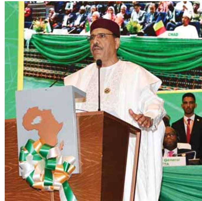
President Bazoum has been appointed AU's champion on Inclusive and Sustainable Industrialisation and Productive Transformation.