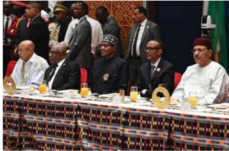
Some Heads of state at a banquet hosted by President Bazoum.