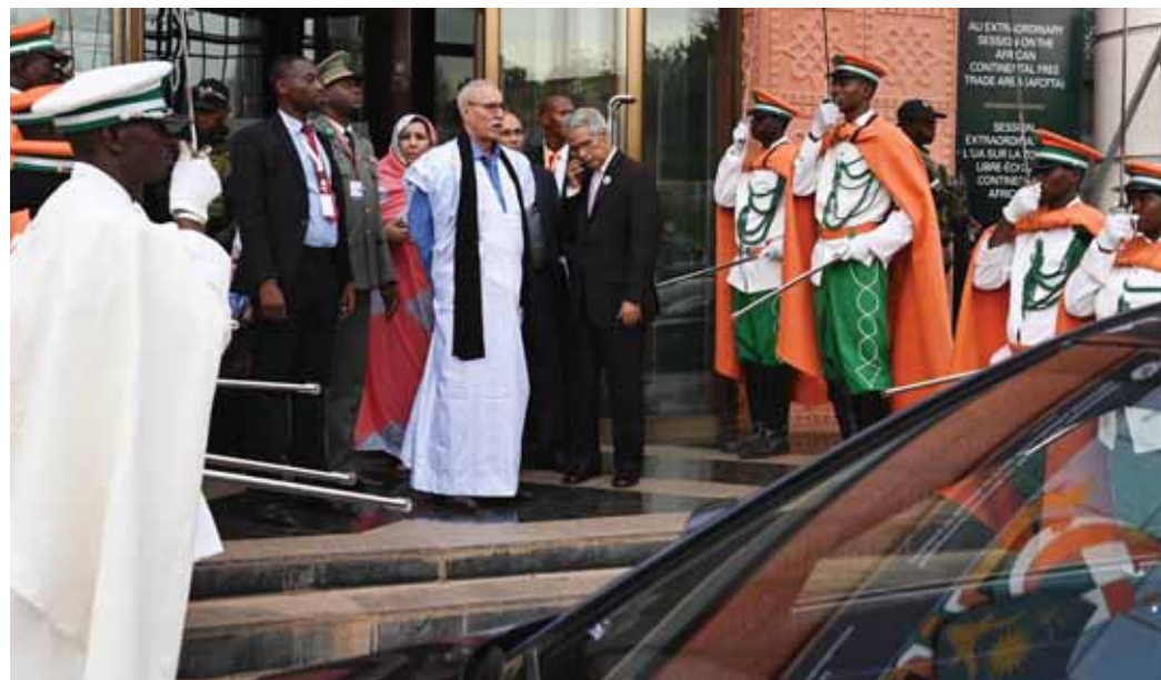
Saharawi president, Mr Brahim Ghali (centre) was also in attendance