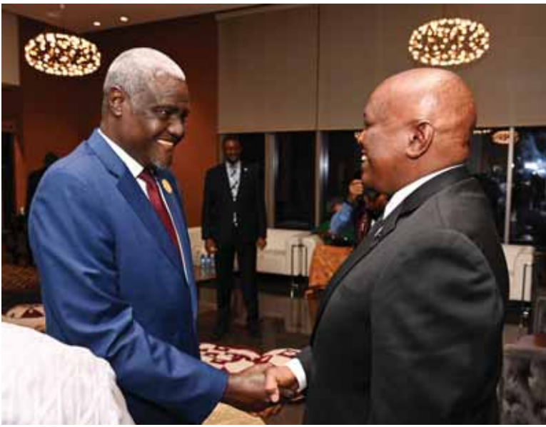
President Masisi (right) sharing a moment with African Union Commission chairperson, Mr Moussa Mahamat at the state banquet.