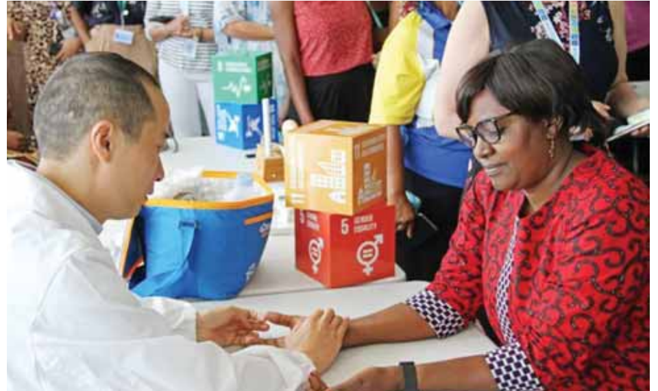
WINDHOEK - The Chinese medical team in Namibia over the years has managed to avail an alternative treatment of ailments to Namibians through the administration of Traditional Chinese Medicine.

The world congress of Chinese medicine will build a broad platform for the development of traditional Chinese medicine as experts of Chinese Medicine from all over the world assemble and share their knowledge and information about their theoretical research, clinical experience, scientific achievements, new inventions, and creations. Xinhua