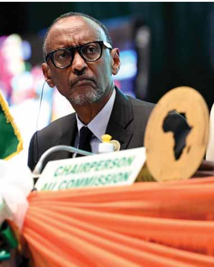
Chairperson of the AU Commission has called for Africa's economic unity saying it was more important