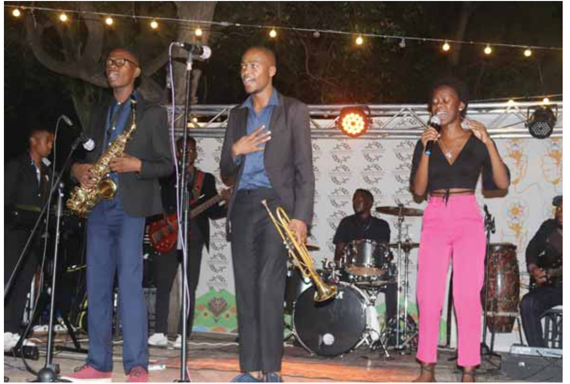
The Intonations BW opened the Maun International Arts Festival poetry night with a jazzy flavour.

This year the festival celebrates a 10 year milestone having been conceived in 2011 subsequent to which they could not celebrate in 2021 due to COVID-19. BOPA