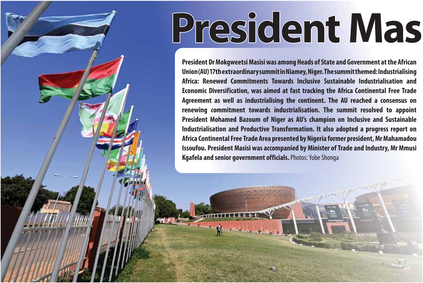
The AU 17th extraordinary summit on industrialisation and economic diversification was hosted at Mahatma Gandhi International Conference Centre.