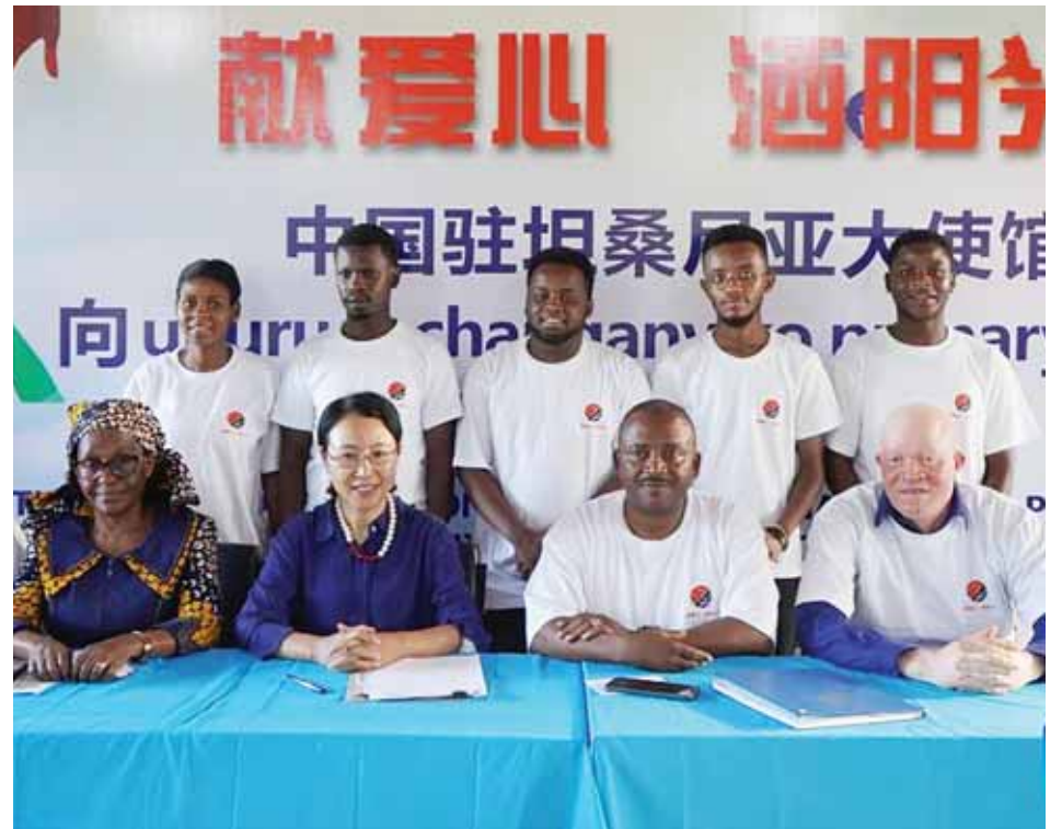
DAR ES SALAAM - Chinese ambassador to Tanzania, Chen Mingjiano (third right) with Uhuru Mchanganyiko Primary School staff members. The Chinese embassy has donated basic needs to 136 pupils with disabilities at a primary school in Dar es Salaam. The donation included food, medicines, clothes, cooking ware and bedding.

Banks emphasised that the goal of the summit is to recognise the global role of the African continent and to highlight shared priorities both globally and regionally. Sputnik