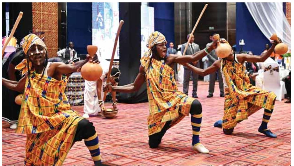
Niger traditional dancers entertaining guests.