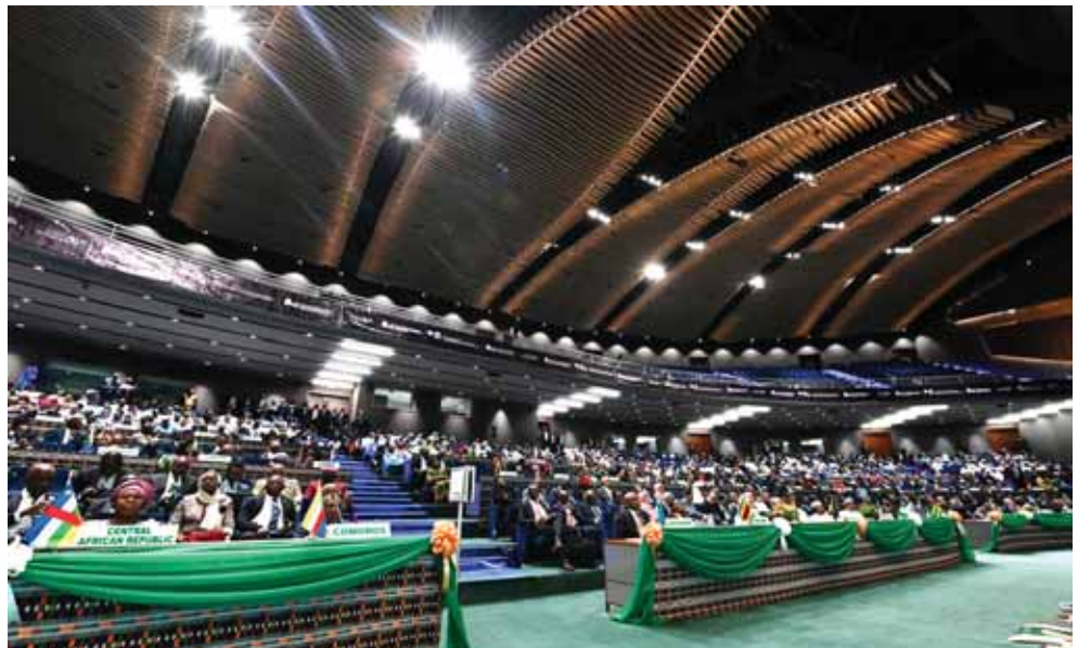
Delegates at the summit.