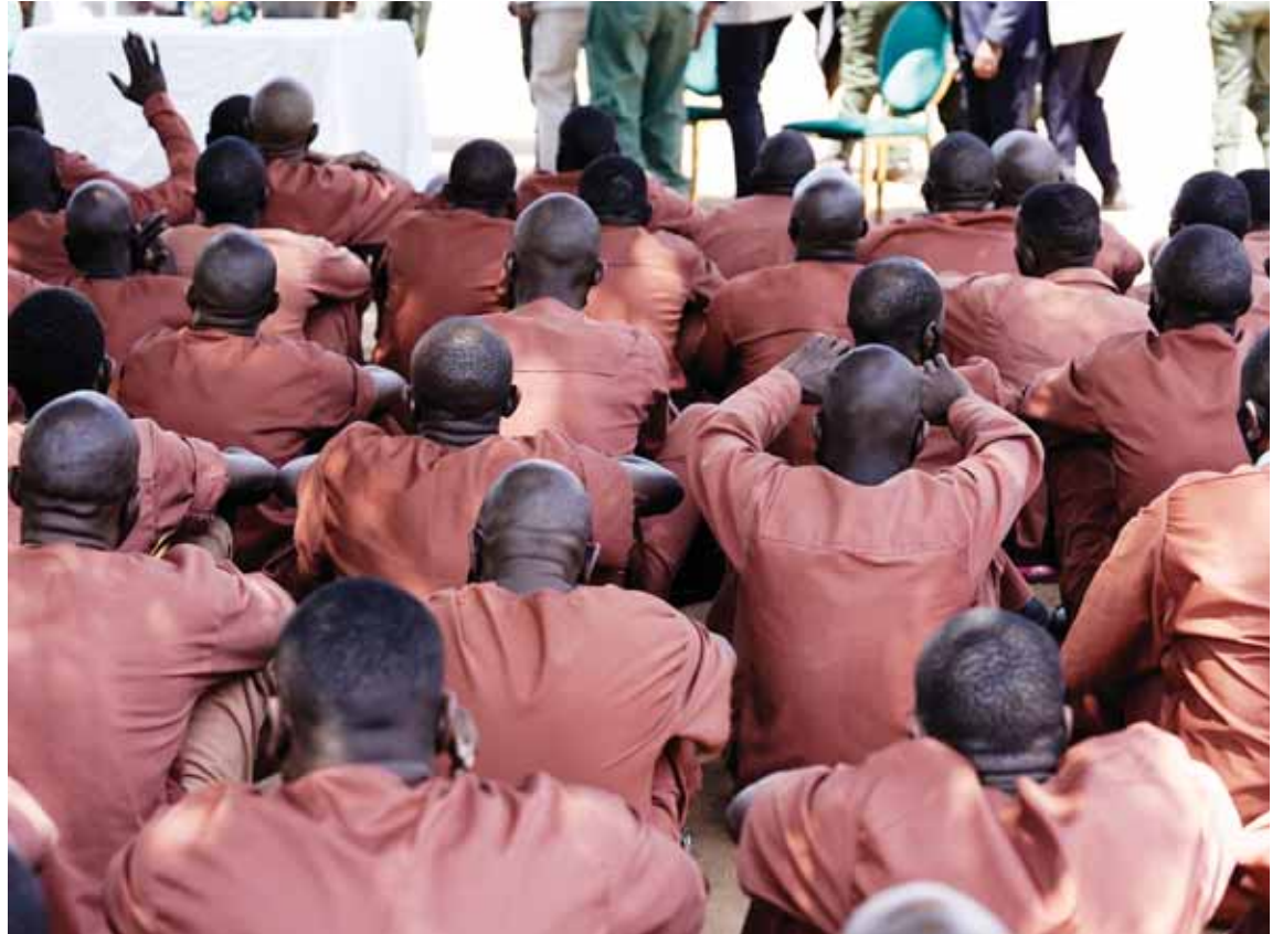
Go tthabolola dikitso tsa magolegwa jaaka ba ipakanyetsa go boela mo setshabeng go botlhokwa ka go thusa go fetola ka fa ba akanyang ka teng.

ba bona gole botlhokwa go tliša lenaneo la go ba busetsa kwa setshabeng gore ba amogelesege sentle.