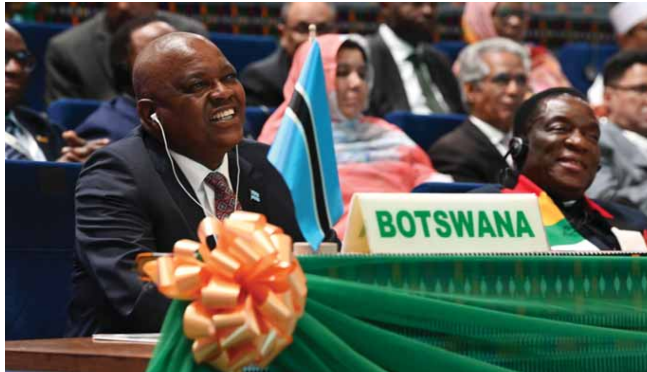
President Masisi (left) and Zimbabwe President Emmerson Mnangagwa