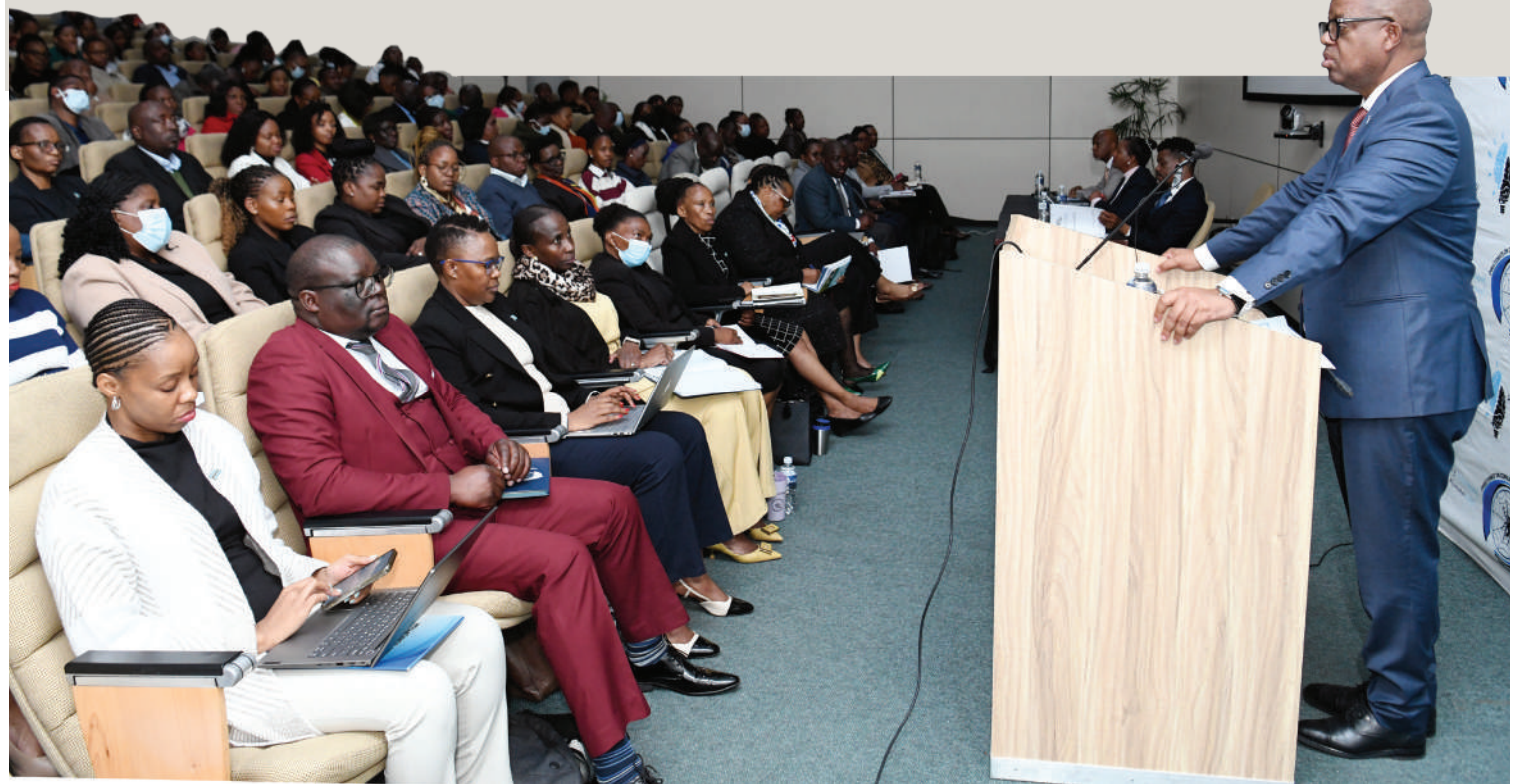
Minister for State President, Defence and Security, Mr Moeti Mohwasa addressing Directorate on Corruption and Economic Crime officers during a staff engagement meeting in Gaborone on Tuesday. He encouraged them to continue to uphold integrity, confidentiality and ethical conduct as the institution intensified its fight against corruption and economic crime.