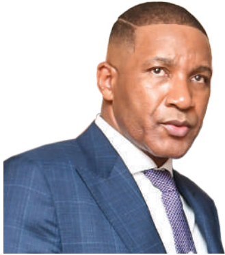
President Advocate Duma Boko

the need to shift from a mineral-reliant economy to a dynamic, digitally inclusive one that provides opportunities for all citizens.