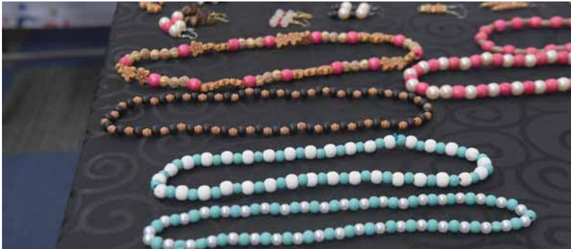
Some of the beadwork showcased by autistic individuals through the Autism Botswana organisation at the ongoing Botswana Consumer Fair.

She expressed hope that, in time, the creatives would benefit from youth funding and eventually make a living from their art. BOPA