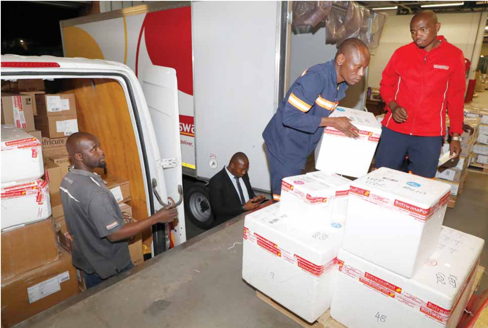
Following President Advocate Duma Boko’s declaration of the State of Public Health Emergency, the first consignment of emergency medical supplies from the Central Medical Stores (CMS) left Gaborone on Monday to far flung areas, with the aim of replenishing critical stock shortages. In his address President Boko said the medical supply chain ran by CMS had failed, which had led to severe disruption of medical supplies countrywide. He also announced the establishment of a Health First Botswana Partnership, a P5 billion fund, which the Botswana Development Corporation committed the initial investment of P100 million and a four-step plan to take command of the disruption of health supplies countrywide.