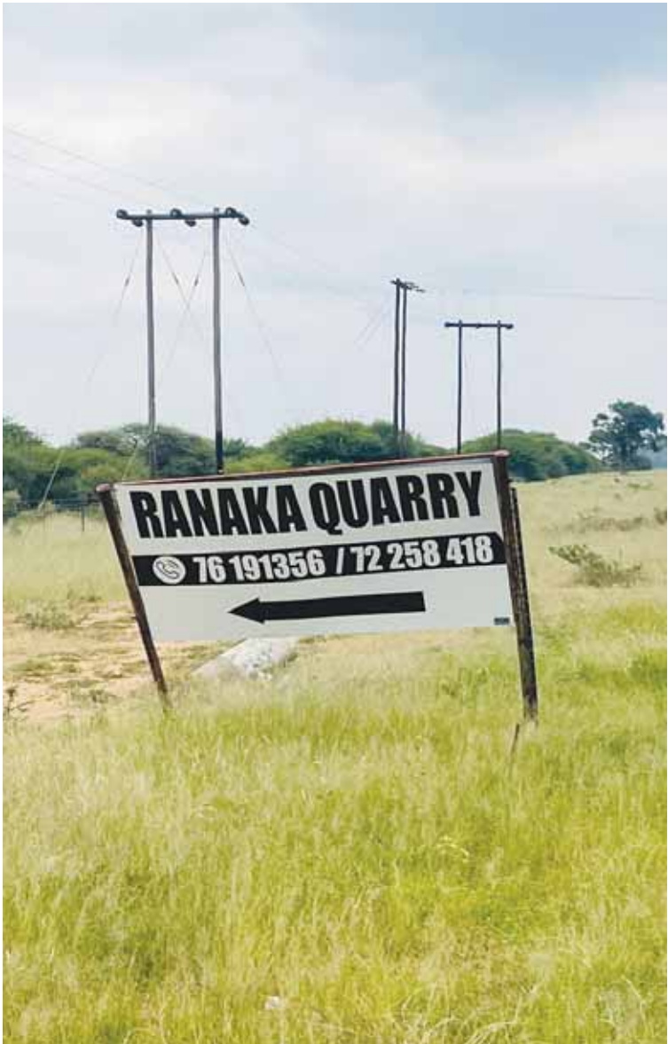
Residents of Ranaka says a local quarry project has traded their safety and heritage for industrial gain.

Office of the Government Buyer Ministry for State President, Defence and Security