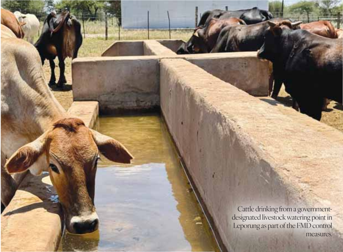
Cattle drinking from a government-designated livestock watering point in Leporung as part of the FMD control measures.