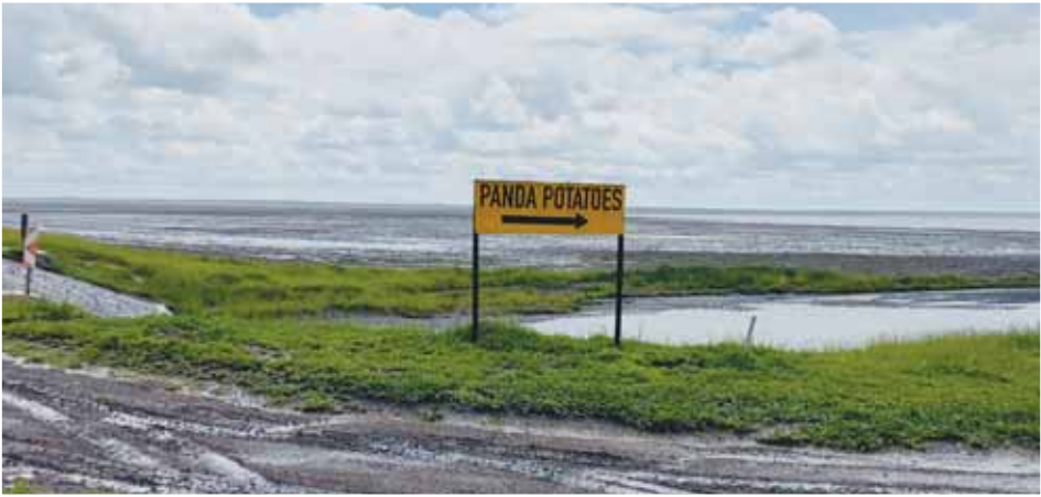
Submerged access roads at the Panda commercial farms.