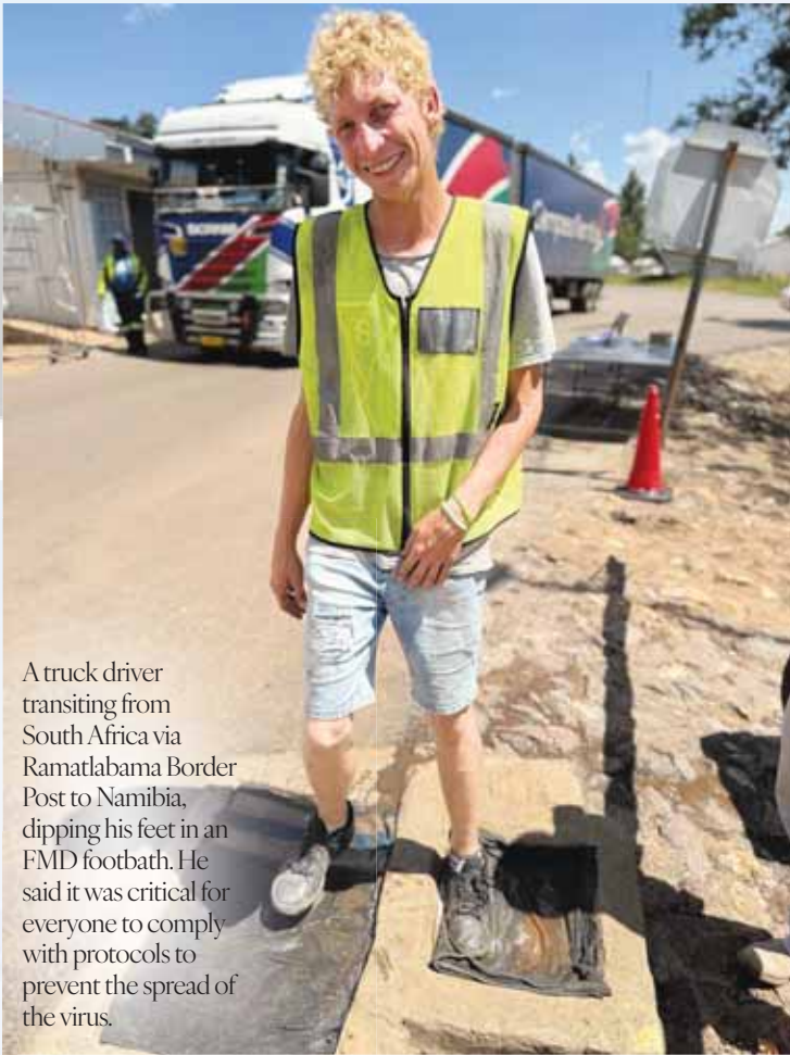
A truck driver transiting from South Africa via Ramatlabama Border Post to Namibia, dipping his feet in an FMD footbath. He said it was critical for everyone to comply with protocols to prevent the spread of the virus.