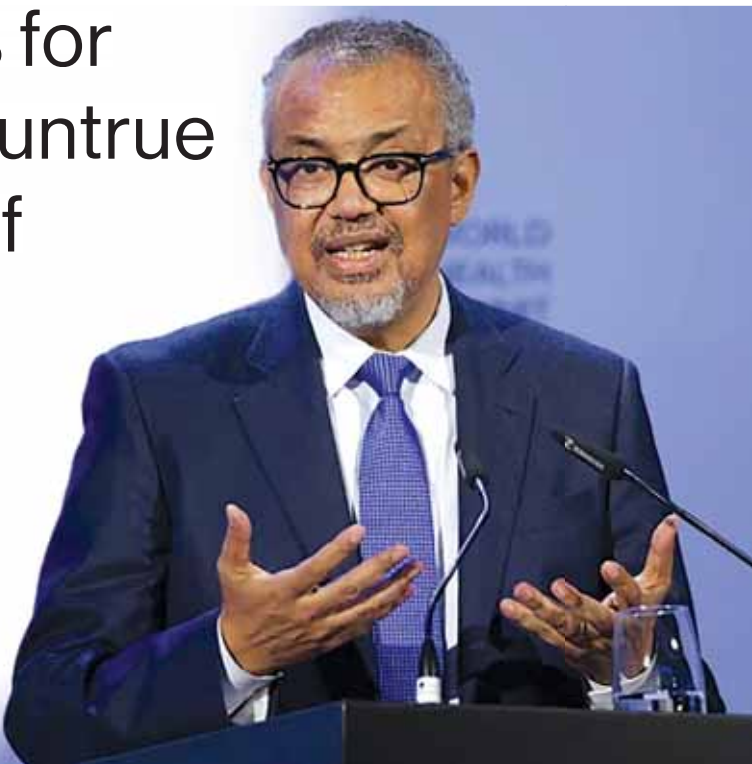
World Health Organization director- general Tedros Ghebreyesus

World Health Organization (WHO) Director-General Tedros Adhanom Ghebreyesus on Saturday depicted as “untrue” the reasons given by the United States for its withdrawal from the global health watchdog. On the social platform X, the WHO chief noted that the move will make the United States itself and the world “less safe.” US President Donald Trump signed an executive order on January 20, 2025, the first day of his second term to formally initiate the US exit from the UN specialised agency. The United Nations received the formal notice two days later. Under the UN charter, the withdrawal takes effect one year after notice was given. Commending the contribution made by the United States as a founding member to many of WHO’s greatest achievements, Tedros wrote in the X post, “Unfortunately, the reasons cited for the US decision to withdraw from WHO are untrue.” The US move “makes both the US and the world less safe,” he said, expressing hope that the “United States will return to