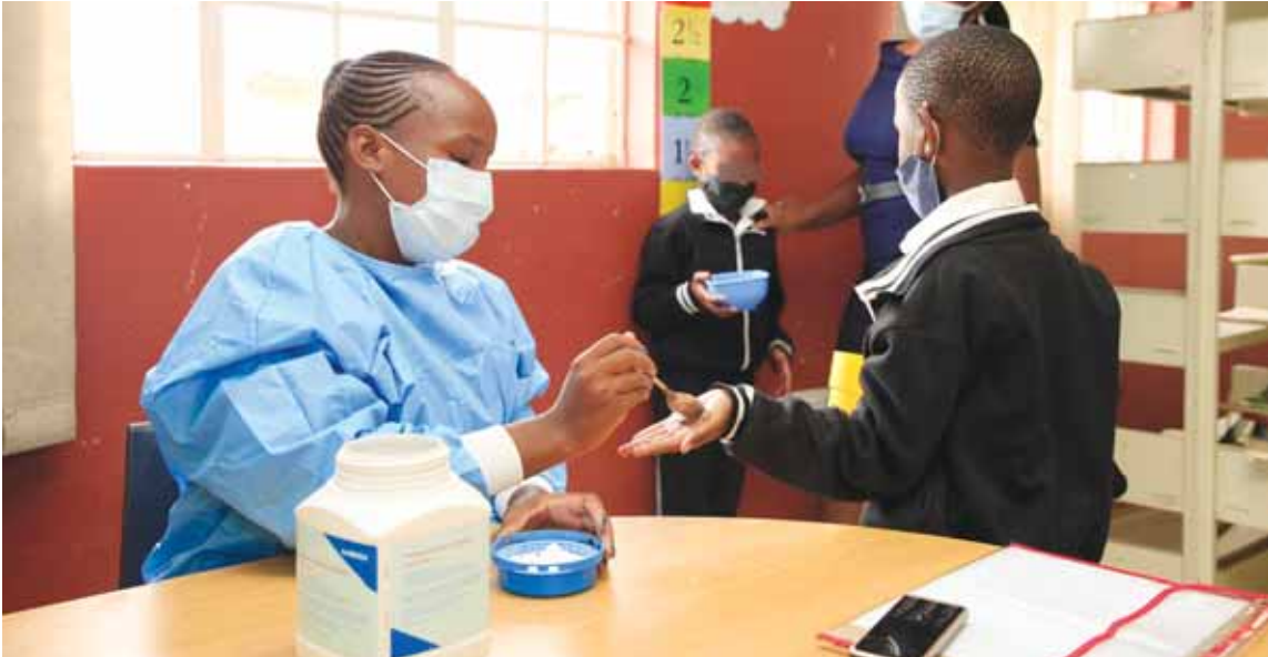
Amid growing public frustration over drug shortages and long-standing cracks in the health system, President Advocate Duma Boko has vowed to restore confidence in public healthcare. Speaking during a visit to Nyangabgwe Referral Hospital last Friday, President Boko said fixing healthcare was a defining test for the nation, warning that failure would deepen despair among Batswana.

What might appear to patients as sporadic stock-outs is, according to health experts and former officials, the visible symptom of a long-standing and deeply rooted failure within the country's public health system.