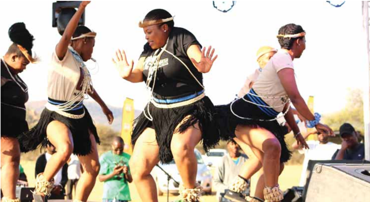
Dimawe Cultural Site, was a beehive of activities on Saturday during the 2 nd annual Dimawe Cultural Festival.