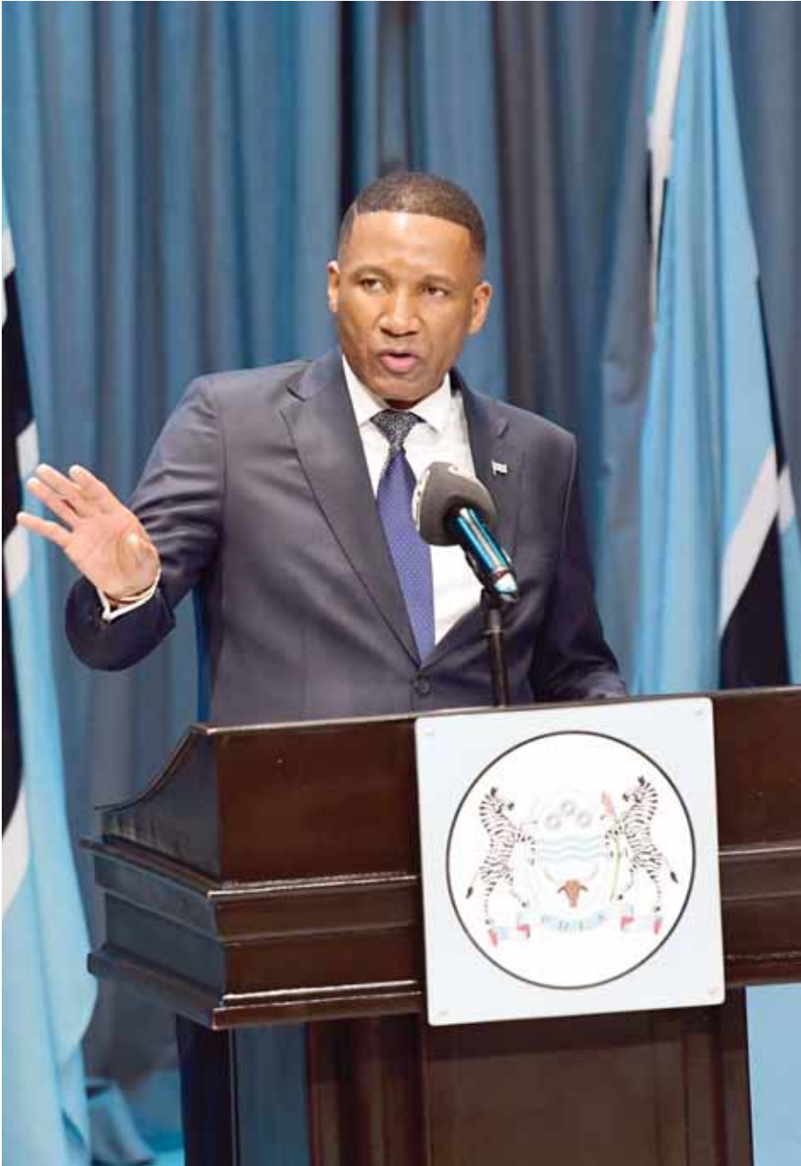
President Advocate Duma Boko briefing the nation on pertinent matters concerning the health sector in Gaborone yesterday. President Boko, who declared a State of Public Health Emergency, also announced the establishment of a Health First Botswana Partnership, a P5 billion fund, which Botswana Development Corporation would commit P100 million investment.