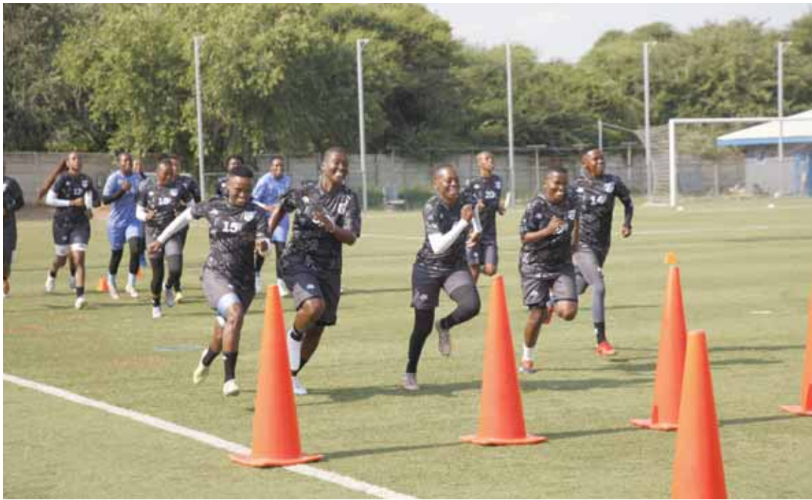
The Mares are expected to redeem their pride as they face the Leopards dames of the Democratic Republic of Congo in a WAFCON 2026 qualifier second leg clash to be played at Complexe Omnisports Stade des Martyrs, in Kinshasa today.

The Mares played much better and it is important for them to carry it from there if they want to win the game. BOPA