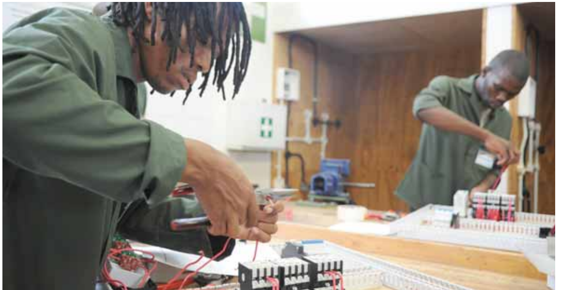
Minister of Youth and Gender Affairs Ms Lesego Chombo said technical, vocational education and training was critical in enabling young people to develop practical skills, often diverse and transferable across industries.

She said the government's pledge to invest in Bonno Housing Initiative would address the needs of middle and low income earners, which would improve their access to home ownership for all regardless of their circumstances. BOPA