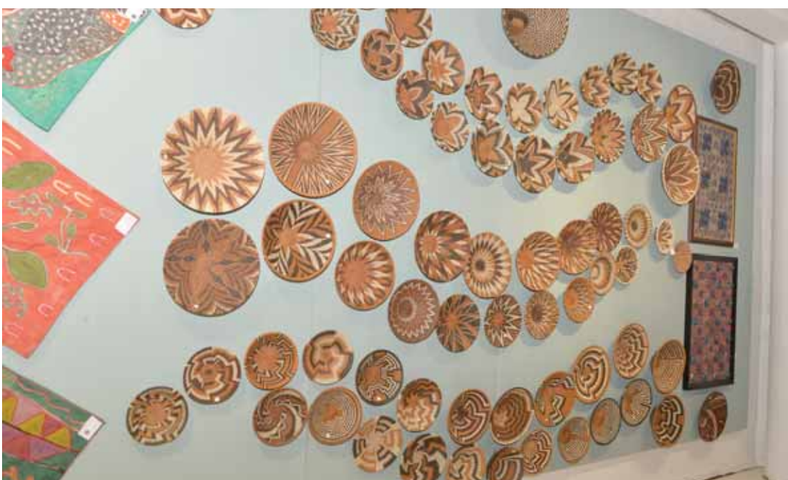
Maun Immersive Cultural Tour initiative aims to give tourists the opportunity to experience Botswana beyond wildlife.

Tickets for Under One Roof are sold online at Nutickets at P350 standard, P400 silver, P550 gold and P1 000 platinum. BOPA