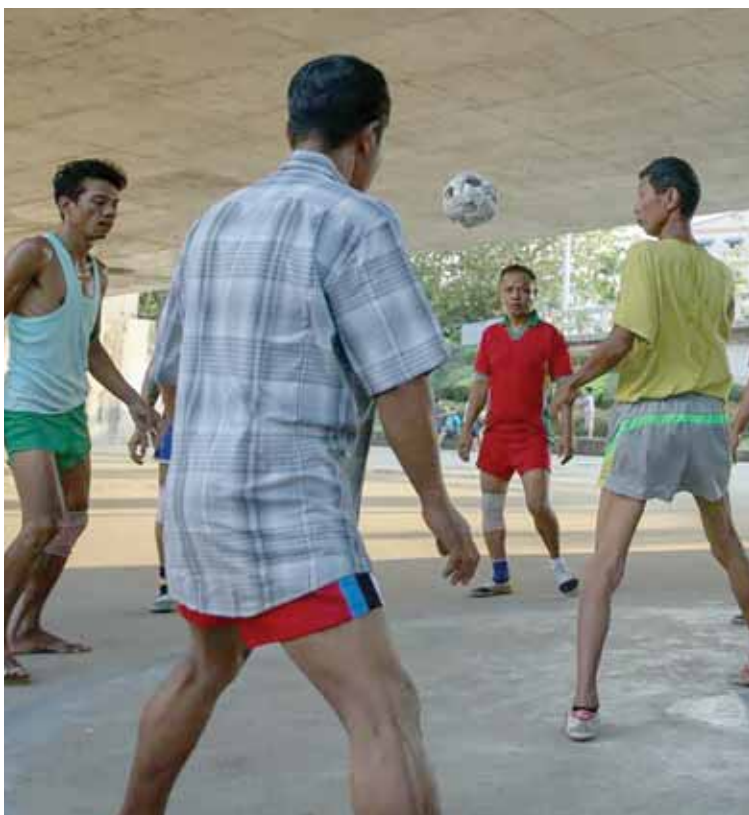
YANGON-People playing Chinlone (caneball) under a bridge in Myanmar on Saturday. Myanmar's traditional national sport, caneball, will be submitted for United Nations Educational, Scientific and Cultural Organization intangible culture heritage recognition in March 2026, according to the Myanmar Chinlone Federation.

In other fixtures on Monday, Tigre won 1-0 at home to Banfield and Argentinos Juniors was held to a goalless home draw by Independiente Rivadavia. Xinhua