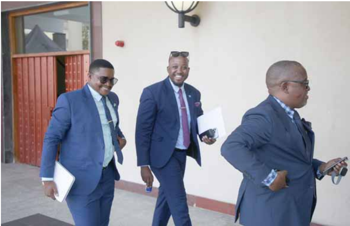
Minister of Health, Dr Stephen Modise (centre) said the ministry's plan was anchored on primary healthcare approach, which advocated disease prevention mode. As such, Dr Modise said members of the community must be encouraged to invest their energy on preventative measures.