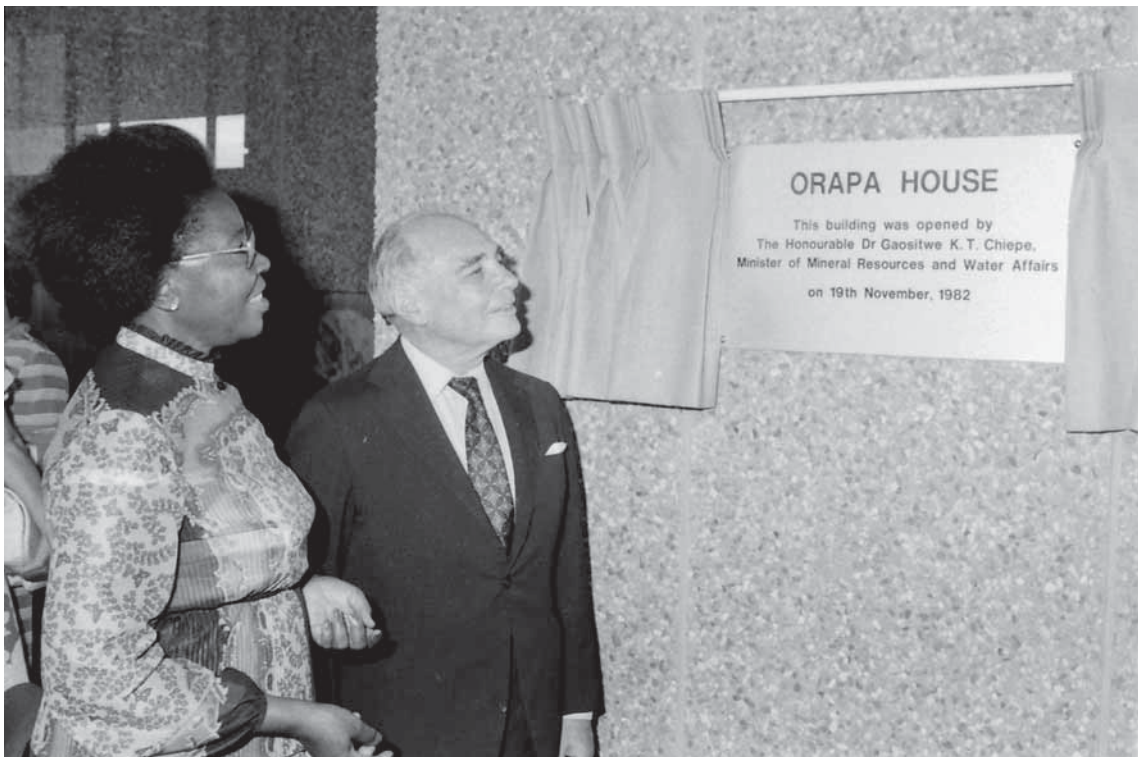
Dr Gaositwe Chiepe (left) officially opening the iconic Orapa House in 1982. The signing of diamond sales agreement between Government of Botswana and De Beers group was hosted at the building to symbolise Botswana's journey from diamond discovery to dominance in the global diamond industry.