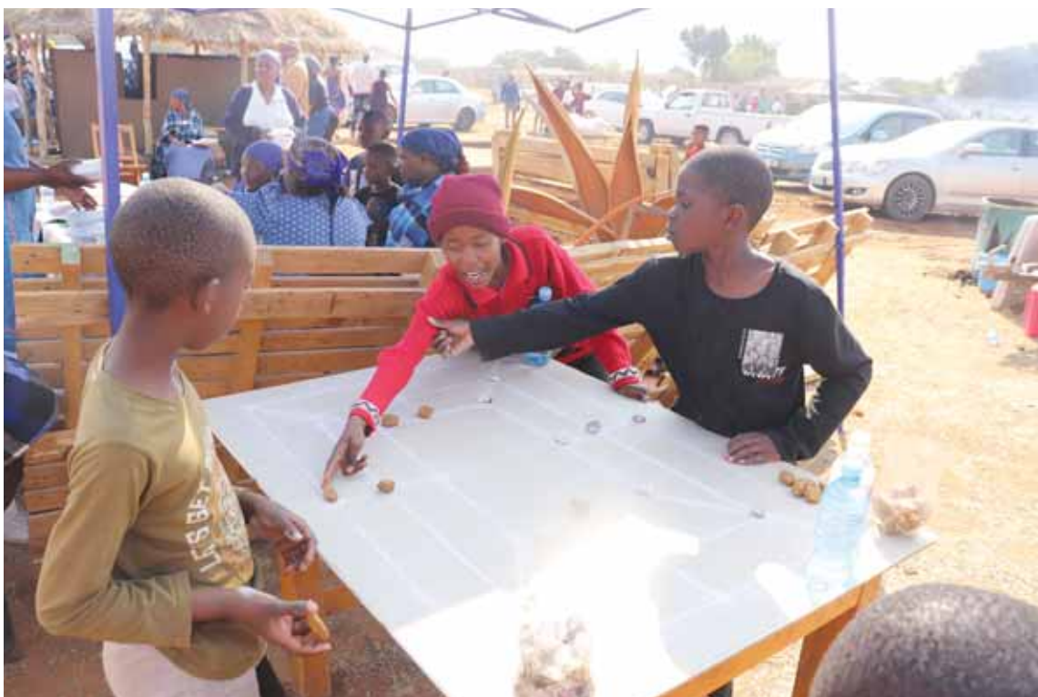
Children playing a traditional game of mhele at the cultural festival. There was also presentation of dikgafela to Kgosi Puso, poetry, traditional cuisine and games such as morabaraba and lots of entertainment.

Basiami also emphasised the importance of building one's portfolio and leaving behind digital footprints. BOPA