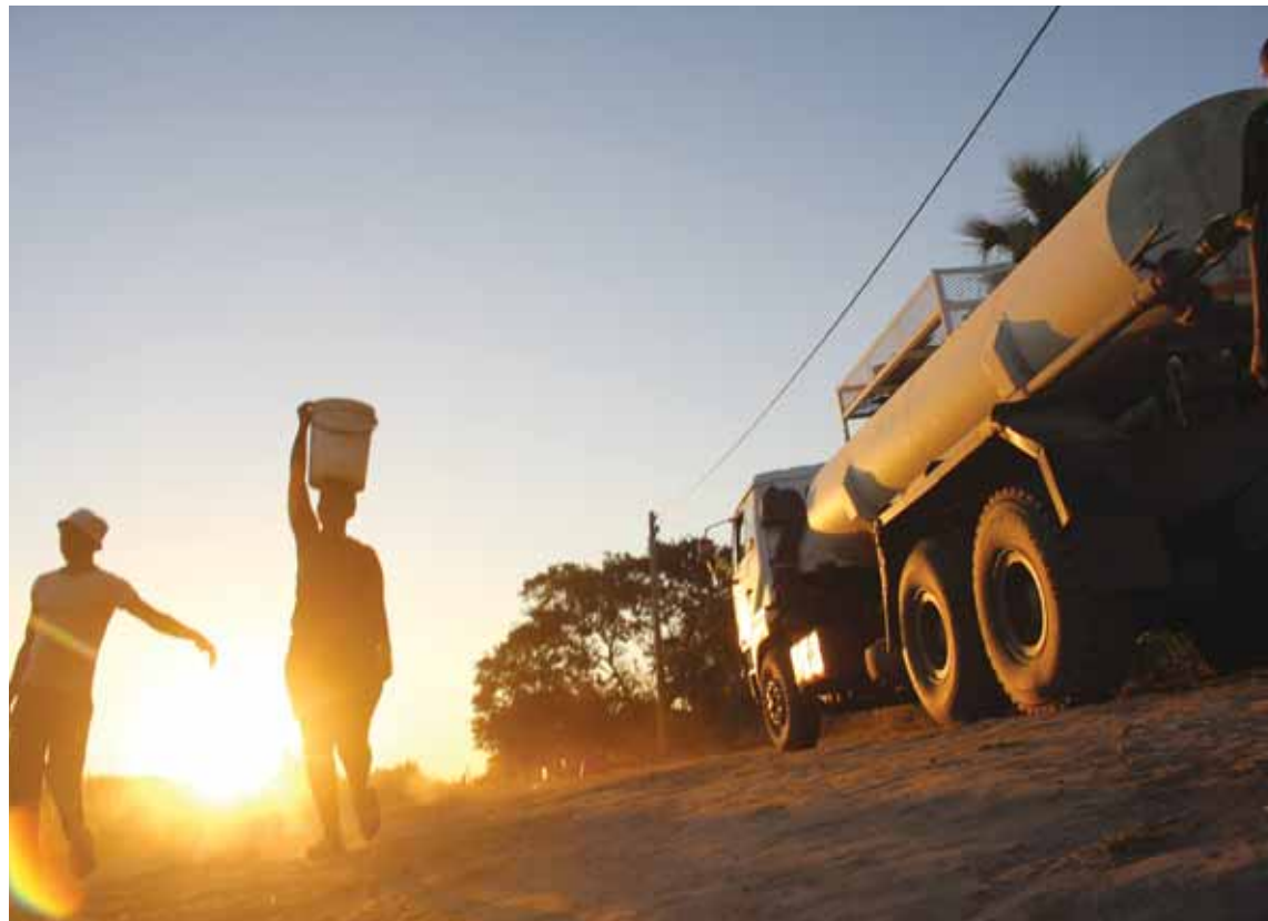
Maun is experiencing water shortage following the vandalism of the main transmission line from Kunyere wellfield to the pump station.

She added that the recipients must make use of it to improve their lives. BOPA