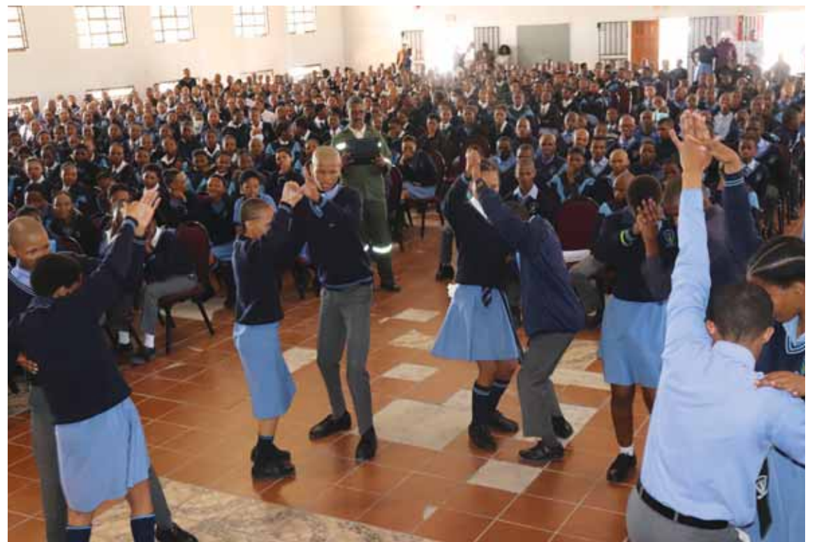
Tsabong Unified Senior Secondary School Polka group performing to kickstart a five-day boot camp on Monday. The boot camp seeks to instil mind-set change in the 21 st century learner and improve academic results performance.

He said preparations for this year's charity walk are ongoing but he could not disclose the date. BOPA