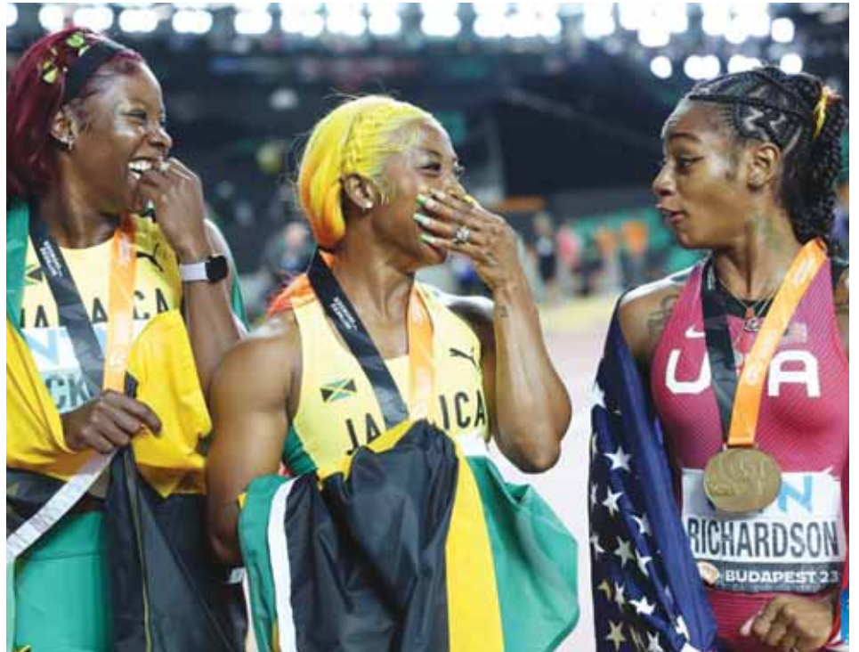
BUDAPEST - Gold medalist Sha'Carri Richardson (right) of the United States, silver medalist Shericka Jackson (left) of Jamaica and bronze medalist Shelly-Ann Fraser-Pryce of Jamaica after the Women's 100m final of the World Athletics Championships in Hungary on Monday.