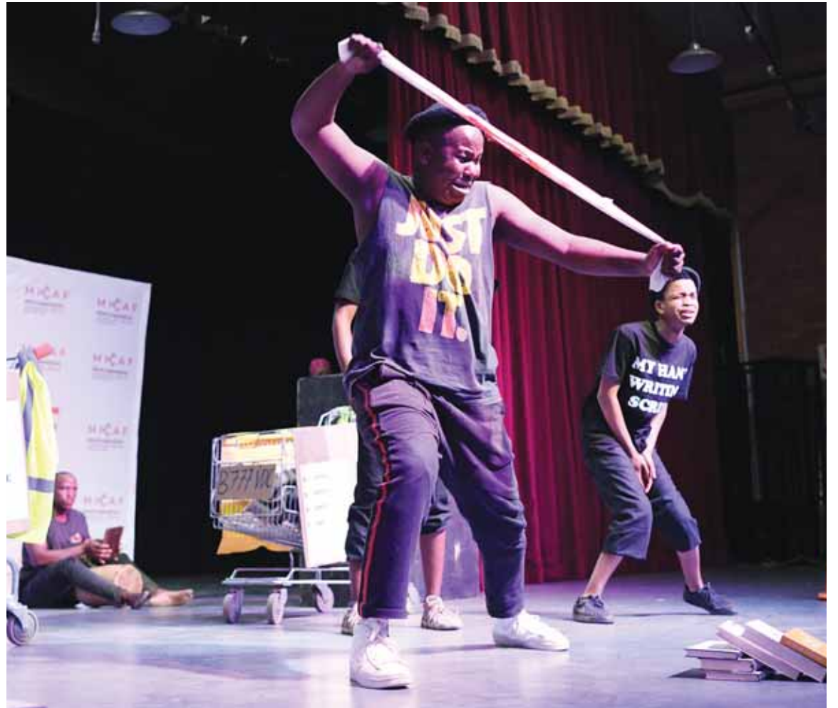
Chobe Arts group performing The Market Place play during the Makgabaneng International Creative Arts Festival theatre competition in Gaborone on Saturday. Modikwa said theatre continued to not only entertain, but also put food on the table for many across its value chain, creating employment and contributing to Botswana's economy.

The MICAF Official Opening & Expo is scheduled for October 27 while the picnic session will be on October 28 followed by closing gala dinner on October 29. BOPA