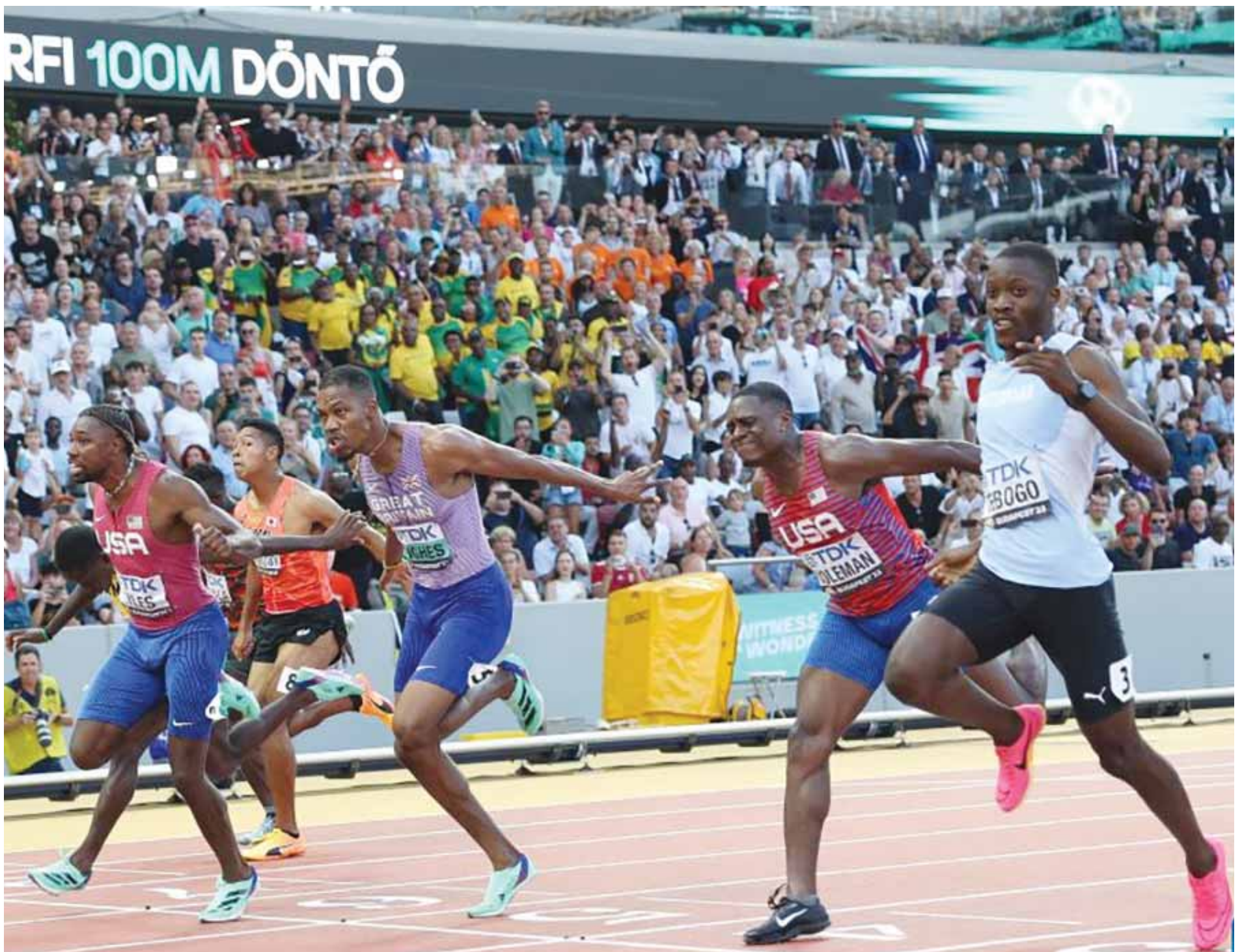
BUDAPEST - Tebogo (right) in action during the men's 100m final of the World Athletics Championships in Hungary on Sunday. He will at 150pm today run from lane seven in heat three of the 200m race.