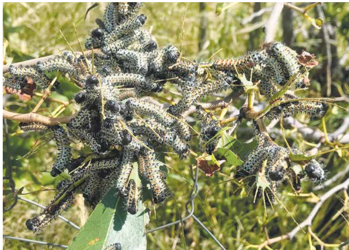
The growing recognition of phane’s nutritional value, along with its appeal in village, urban and cross-border markets, has made it a highly sought-after commodity. This has led to its depletion in traditionally abundant areas such as the North East and Central districts.

Efforts to address the issue have been implemented, including the use of harvesting permits during harvest seasons. Mr Sita noted that this measure is making a difference, particularly in monitoring the harvest and ensuring compliance with the specified harvest period. BOPA