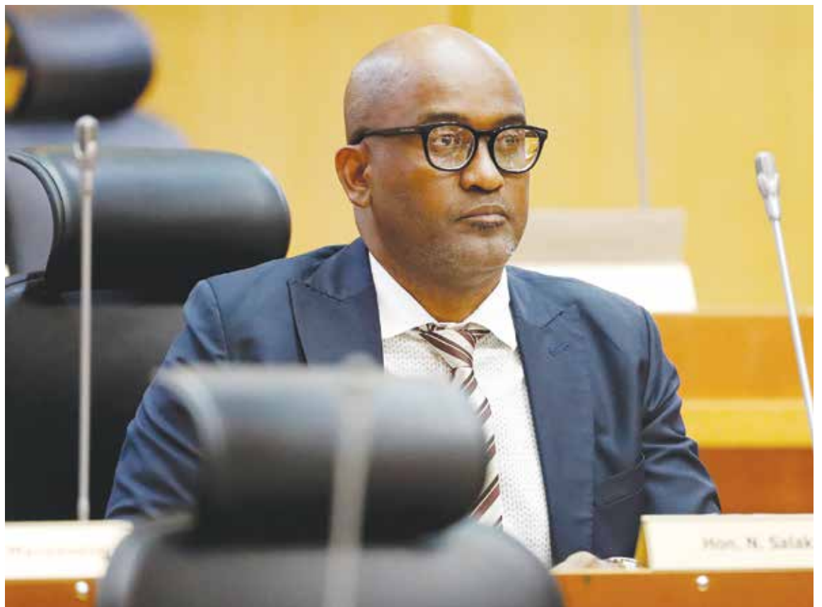
Minister of Transport and Infrastructure, Mr Noah Salakae revealed to Parliament that the reseal of Damuchujenaa and Mmadinare access road including surfacing of 40km Mmadinare-Robebelela Road project, which commenced on February 12, 2024 and was due for completion on February 11, 2026 was at 51 per cent.

He also asked the minister to state the total budget allocated to the project and how much had been expended so far and whether the project had experienced any delays and the causes. He also wanted to know the measures the ministry had put in place to ensure timely completion of the project. BOPA