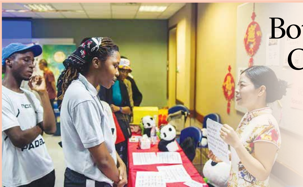
GABORONE - Attendants celebrating the United Nations (UN) Chinese Language Day in Gaborone on April 20. They enjoyed the Chinese language, culture and interesting games.