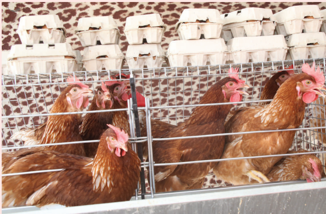
The revamped Poultry Suite is expected to finance about 269 poultry farmers and support the establishment of three new hatcheries.

Addressing the Nuclear Energy Innovation Summit for Africa (NEISA 2026) in Kigali, Rwanda, President Hassan described the summit as an important platform to help Africa move 'from ambition to implementation' in developing reliable and sustainable energy systems. Hassan said Africa's economic transformation depended on affordable and sustainable energy capable of supporting industrialisation, mining, transport modernisation and digital infrastructure development. She said Tanzania's growing electricity demand, driven by industrial expansion, urbanisation and digital transformation under the Tanzania Development Vision 2050, required diversified long-term energy solutions. Xinhua