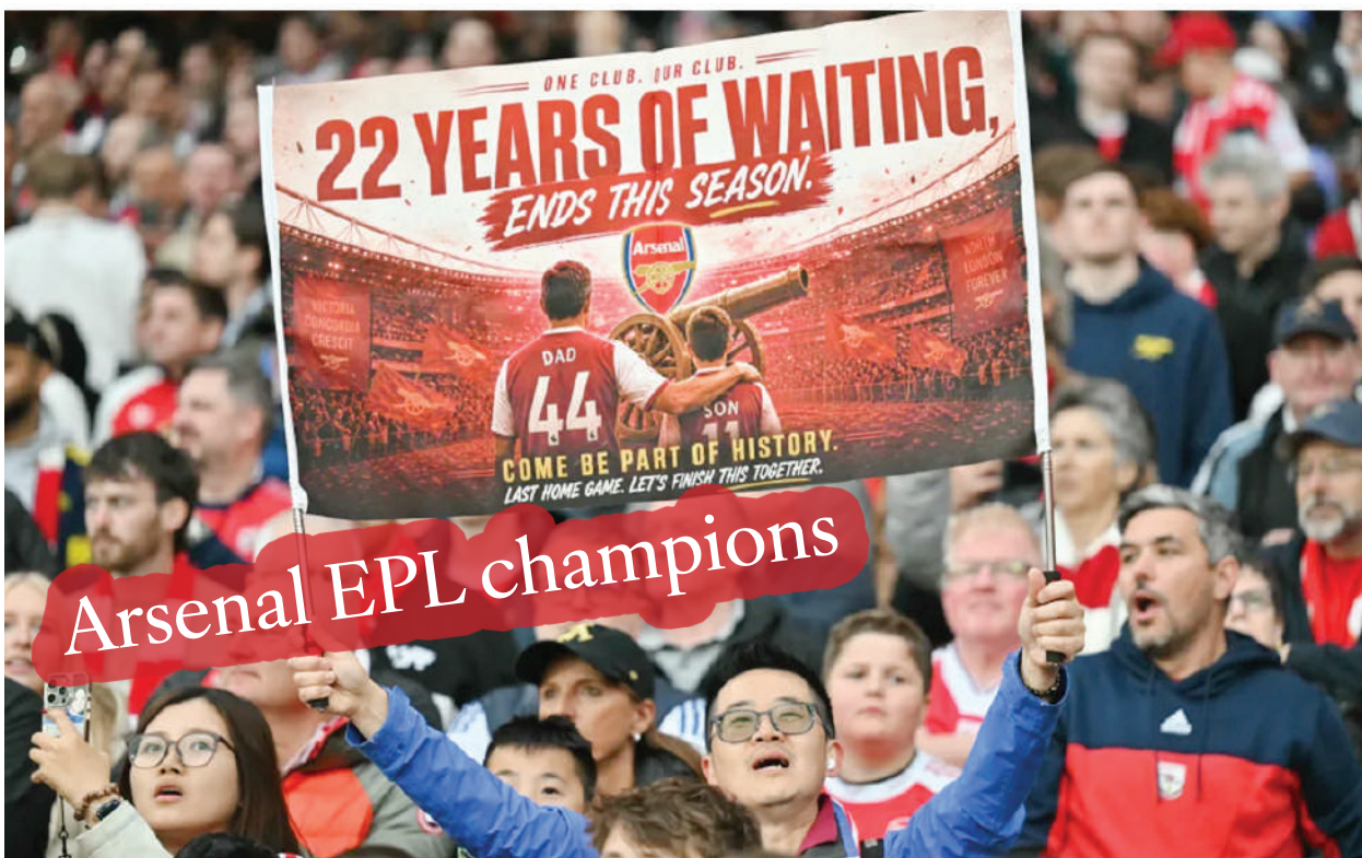
LONDON - A hopeful Arsenal fan holding a banner reading '22 years of waiting ends this season' during the English Premier League (EPL) football match between Arsenal and Burnley at the Emirates Stadium on Monday. Arsenal were crowned EPL champions after the match between Bournemouth and Manchester City ended in a draw Tuesday.