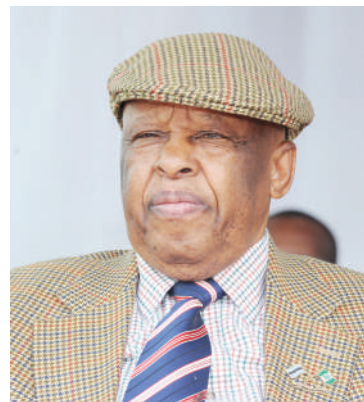
Dr Festus Mogae