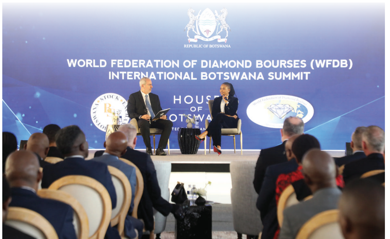
Minister of Minerals and Energy, Ms Bogolo Kenewendo (right) and World Federation of Diamond Bourses (WFDB) president, Mr Yoram Dvash at the WFDB Summit in Gaborone on Monday. Minister Kenewendo announced that Botswana had been admitted into the WFDB through the Botswana Mercantile Exchange and the Botswana Diamond Hub. She said the development reaffirmed the country's position as not only a producer, but also a home of natural diamonds.