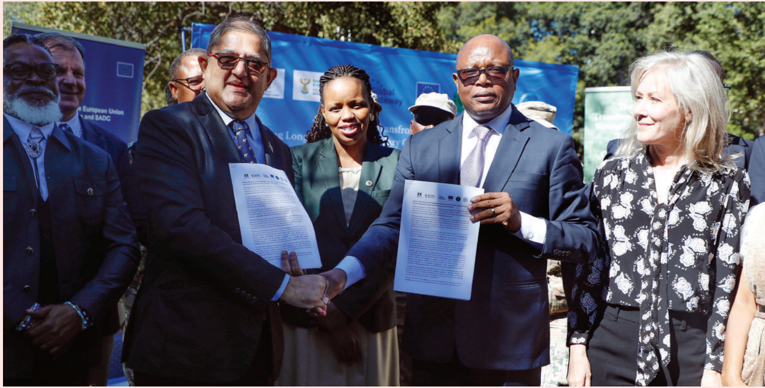
Minister of Environment and Tourism, Mr Winter Mmolotsi (centre), South Africa deputy minister of Forestry, Fisheries and Environment, Mr Narend Singh (left) and European Union Ambassador to Botswana and SADC, Ms Petra Pereyra during the launch of Botswana-South Africa cross-border conservation initiative in Gaborone recently. The initiative is aimed at strengthening the management of Kgalagadi Transfrontier Park, while unlocking tourism-led economic growth and community development.