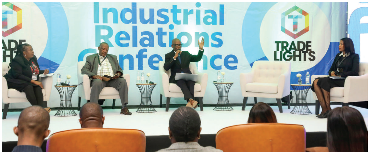
Panelists from government, the private sector and labour unions during the 3rd Industrial Relations Conference 2026 in Gaborone recently. Judge of the National and Supreme Court of Papua New Guinea, Justice Key Dingake warned that Africa risked creating a deeply unequal and "soulless" future of work if employees continued to be treated as disposable commodities rather than human beings deserving dignity, fairness and protection.

This year's gathering also focused on unpacking the implications of Botswana's new Employment and Labour Relations Act of 2025, while promoting more productive, harmonious and digitally advanced workplaces. BOPA