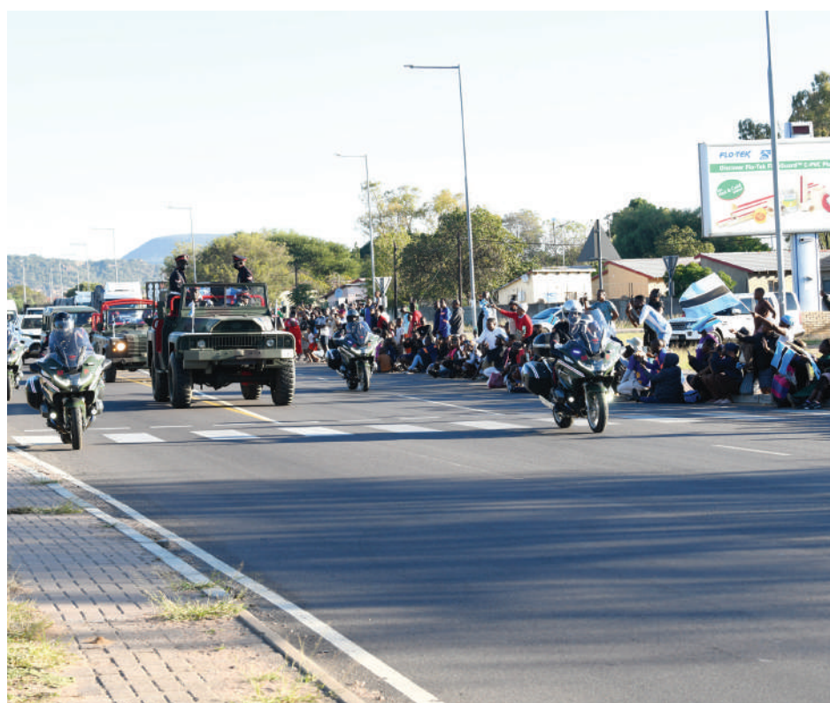
Batswana, young and old, lining the Western Bypass to bid farewell to Festus Mogae.