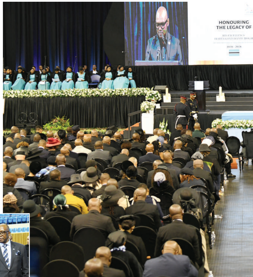
Some of the People who attended the funeral at U