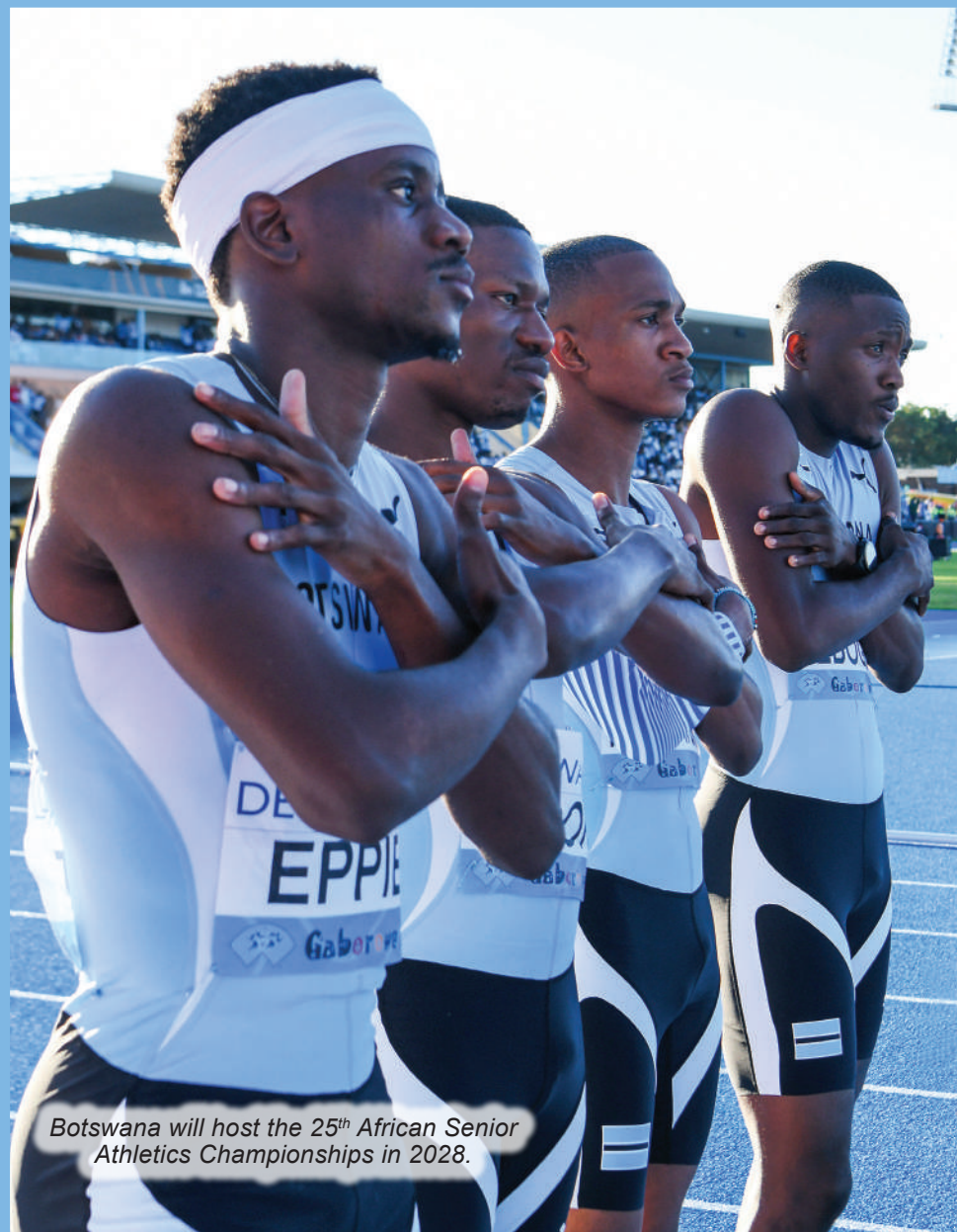
Botswana will host the 25 th African Senior Athletics Championships in 2028.