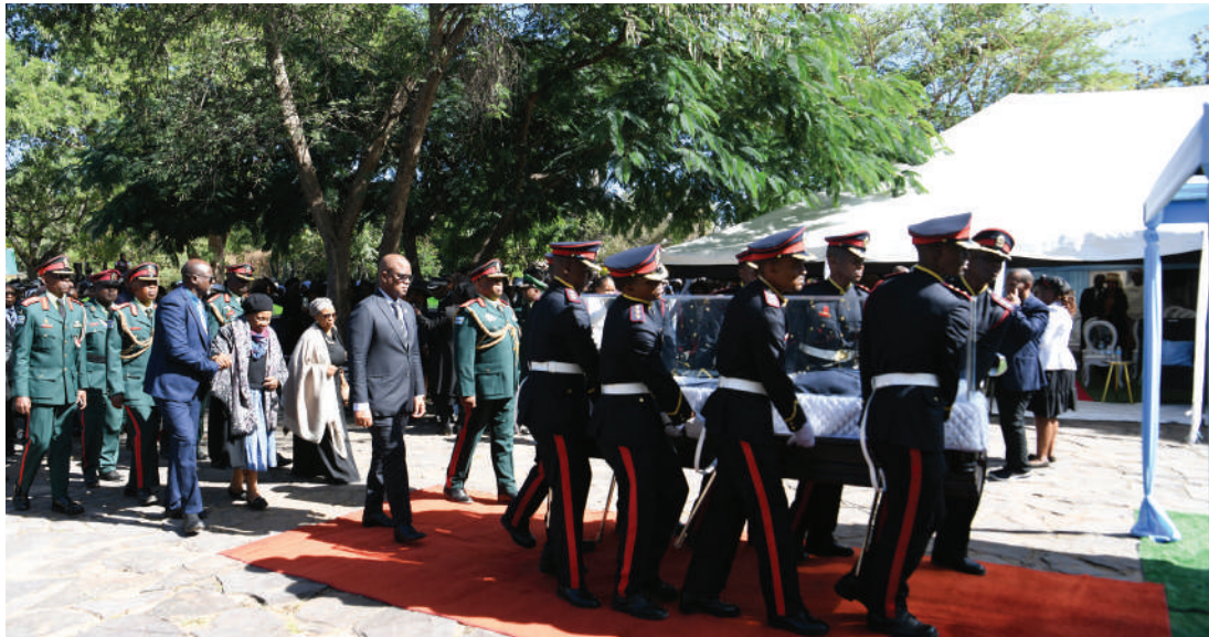
Members of the Botswana Defence Force (BDF) at the rank of Captain carrying the casket of former president Dr Festus Mogae into Parliament Buildings in Gaborone, where members of the public gathered to pay their last respects as he lay in state.