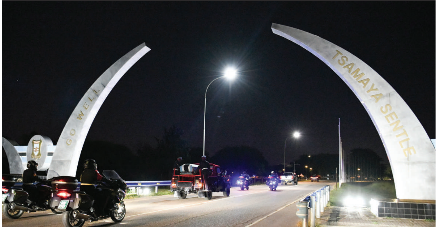
Botswana Defence Force convoy for former President Festus Mogae entering Sir Seretse Khama International Airport to be flown to Selebi Phikwe to commence procession to his home village of Serowe. Mogae, who died May 8, aged 86 was laid to rest at Phomolong Memorial Park, Phakalane on Saturday.