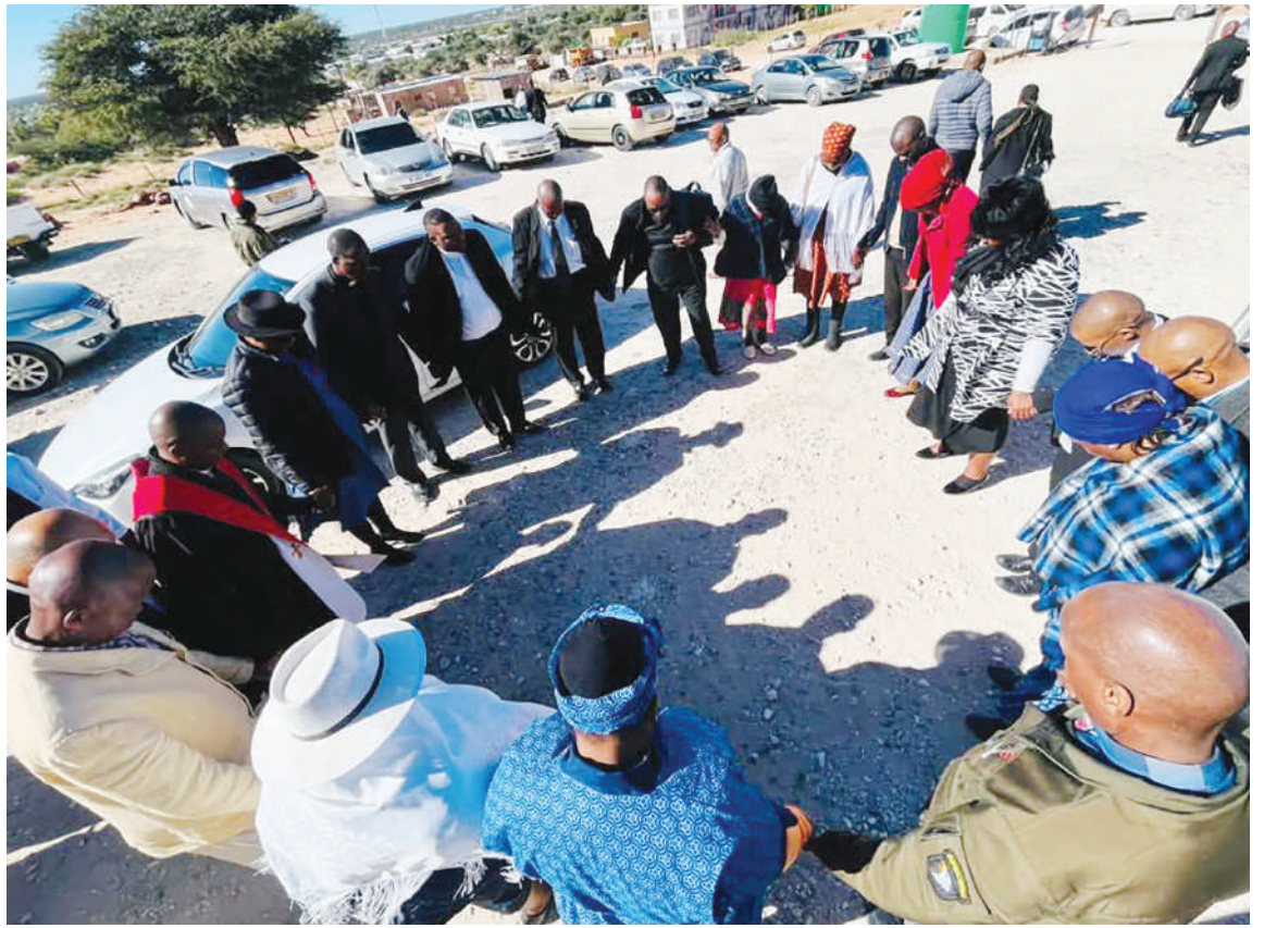
Participants at a recent men's convention in Tsabong. The convention was sparked by the recent surge in legal separations, highlighted by 2 000 divorce cases filed at the Gaborone High Court.