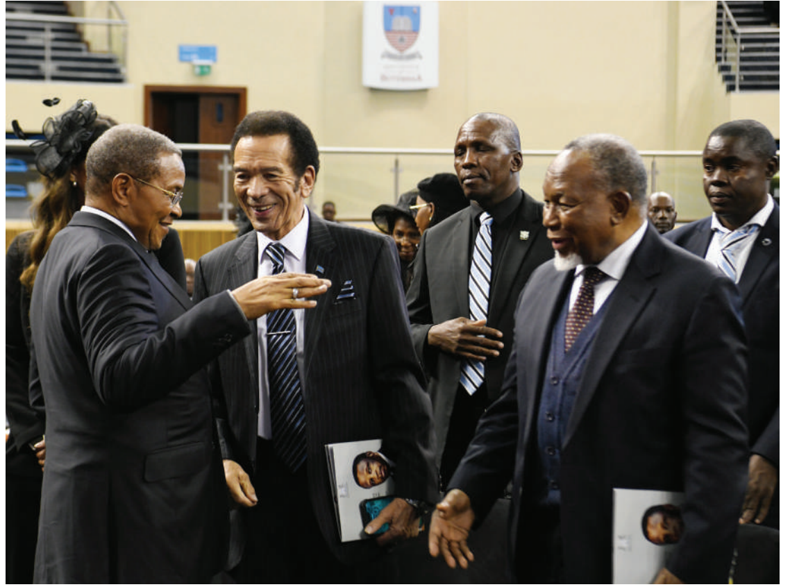
Former presidents Mr Jakaya Kikwete (left) of Tanzania, Lt Gen. Dr Seretse Khama Ian Khama (centre) and Mr Kgalema Motlanthe of South Africa reflecting on memories of Dr Festus Mogae during the funeral on Saturday. Mr Kikwete said Dr Mogae's life was characterised by humility, wisdom, integrity and unwavering dedication to public service in Botswana and across Africa.

He recalled that early in his presidency, Dr Mogae authorised the deployment of Botswana Defence Force (BDF) troops to Lesotho in 1998, alongside the South African National Defence Force (SANDF), to help restore peace and stability following post-