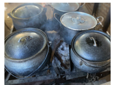
Mme Modupi a re o thusiwa ke bangwe ba losika go apaya, mme a ba atswa gore le bone ba kgone go oba letsogo.