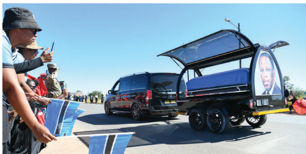
Palapye residents lining up to bid farewell to former President Mogae.