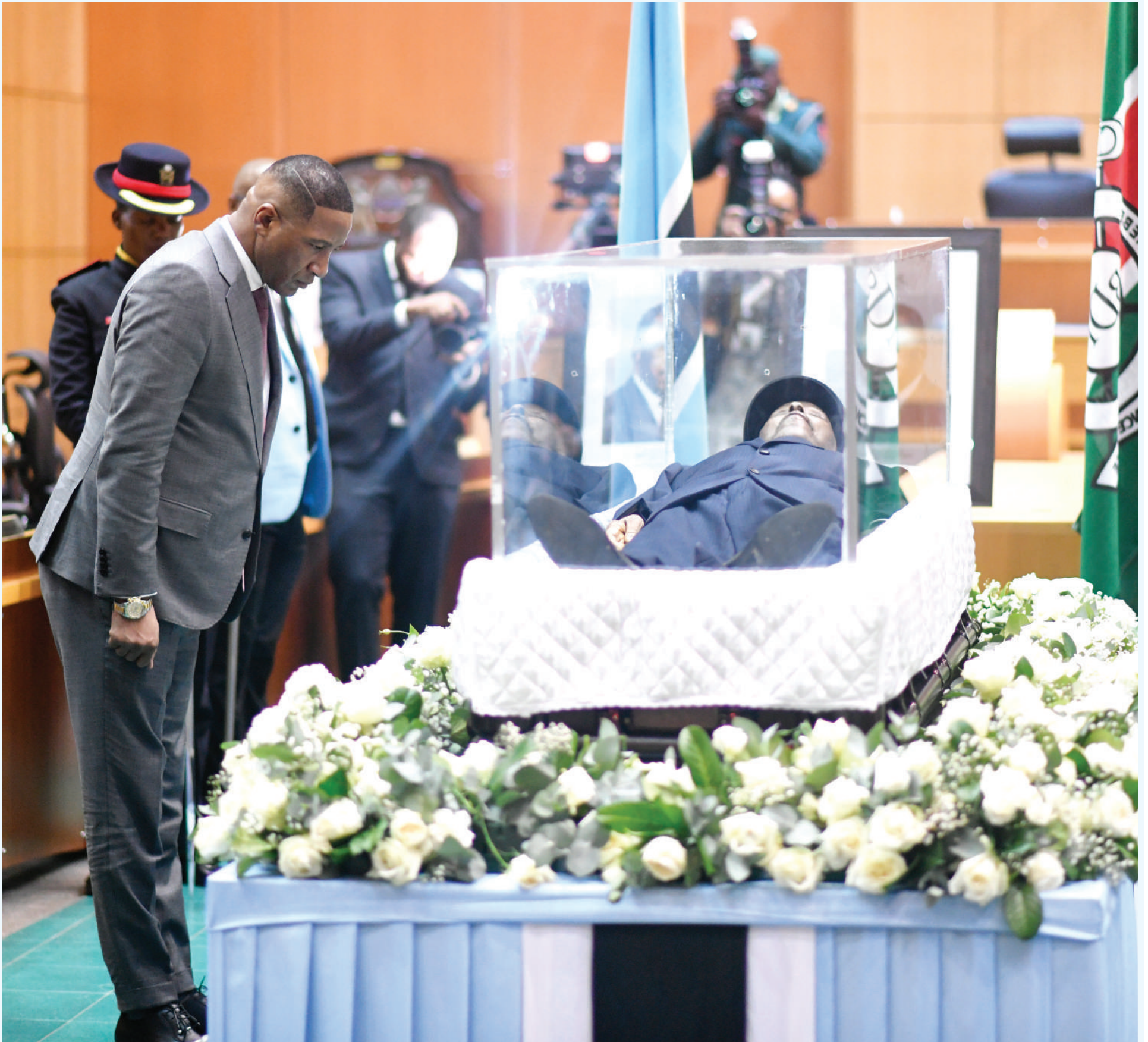
President Advocate Duma Boko paying his respects to the late former President, Dr Festus Mogae, as he lay in state at Parliament recently. President Boko described Botswana's third president as an exceptional leader who rose far above the ordinary.