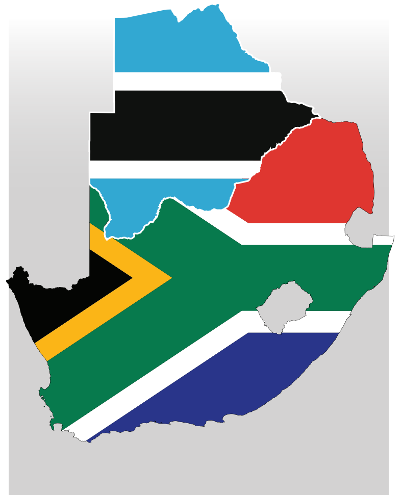
Botswana and South Africa enjoy strong and longstanding bilateral relations with cooperation spanning all sectors of the economy.

President Ramaphosa will be accompanied by government ministers, senior government officials and a business delegation. BOPA