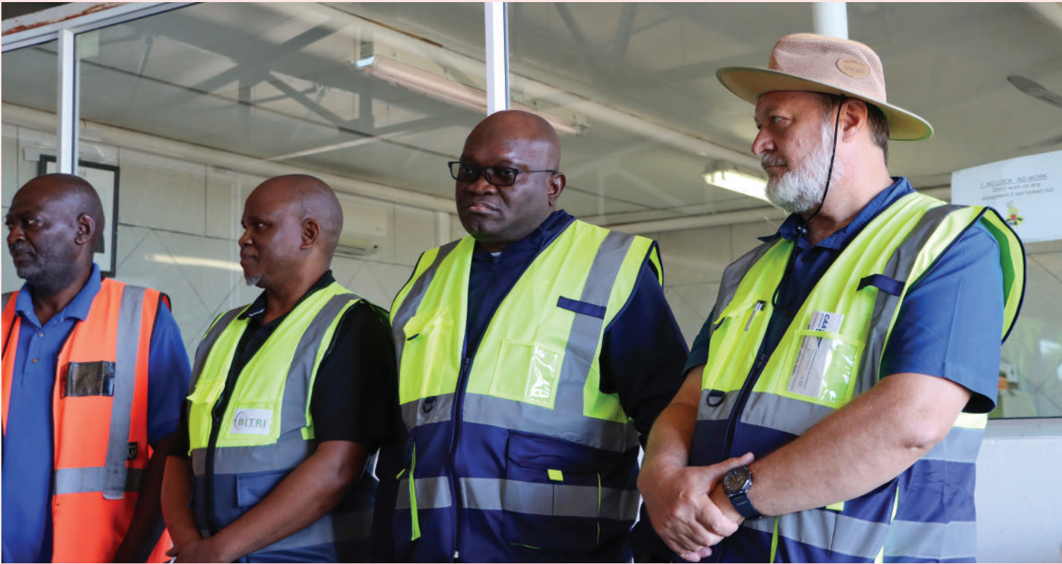
A team of experts from BITRI during a press briefing where Tsodilo Resources Company management announced the discovery of rare earth minerals located near Shakawe in the Okavango District.

BRASILIA - The government of Brazil said Wednesday it will soon introduce a fuel subsidy to help curb rising prices linked to the Middle East conflict, with the measure initially applying to petrol and potentially expanding to diesel at a later stage. According to the government, petrol has not yet been covered by subsidies or tax cuts introduced since the outbreak of the conflict. The measure could later be extended to diesel after an existing subsidy programme expires. The subsidy will be paid directly to producers and importers through the National Agency for Petroleum, Natural Gas and Biofuels, and will be capped at the level of federal fuel taxes, the government said. Mines and Energy minister Alexandre Silveira urged distributors and petrol stations to ensure that consumers quickly benefit from the measures. "I call on distributors and petrol stations to speed up the implementation of federal measures," he said. Planning and Budget Minister Bruno Moretti said the subsidies will be funded through the federal budget while remaining fiscally neutral and without adding pressure. Xinhua