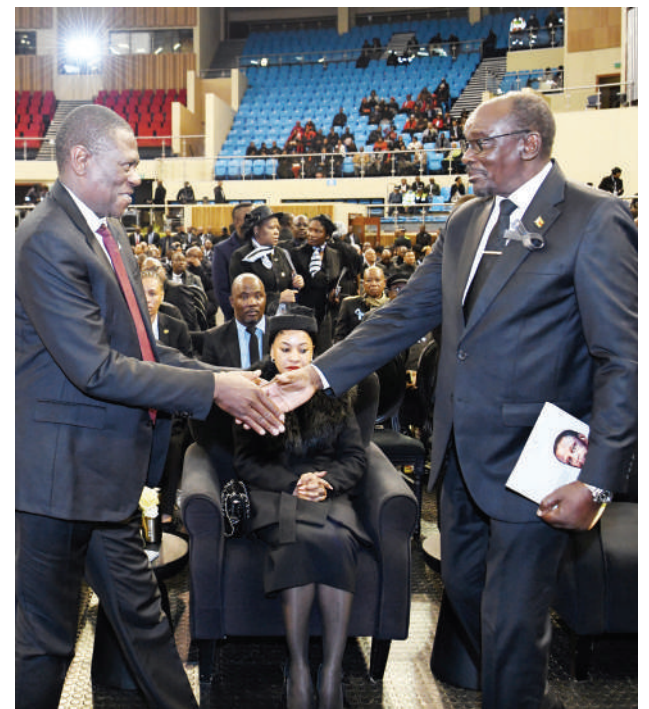
Vice President of South Africa, Mr Paul Mashatile and Zimbabwe Vice President, Mr Kembo Mohadi were some of the dignitaries who attended Dr Mogae's funeral.