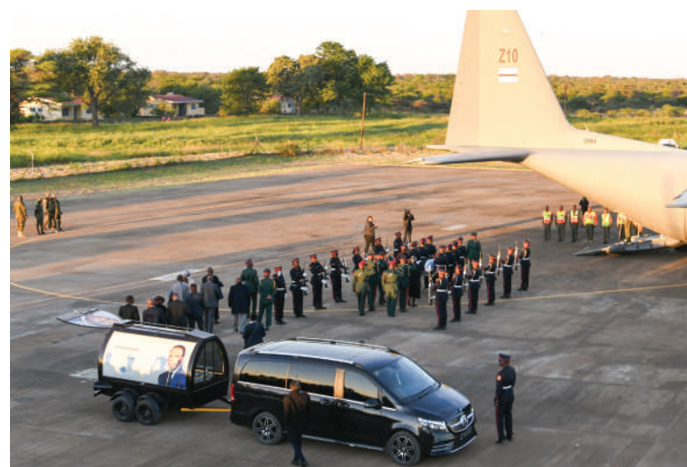
Botswana Defence Force C-130 Hercules aircraft, an Am was used to transport Dr Mogae's body to Selebi Phikwe