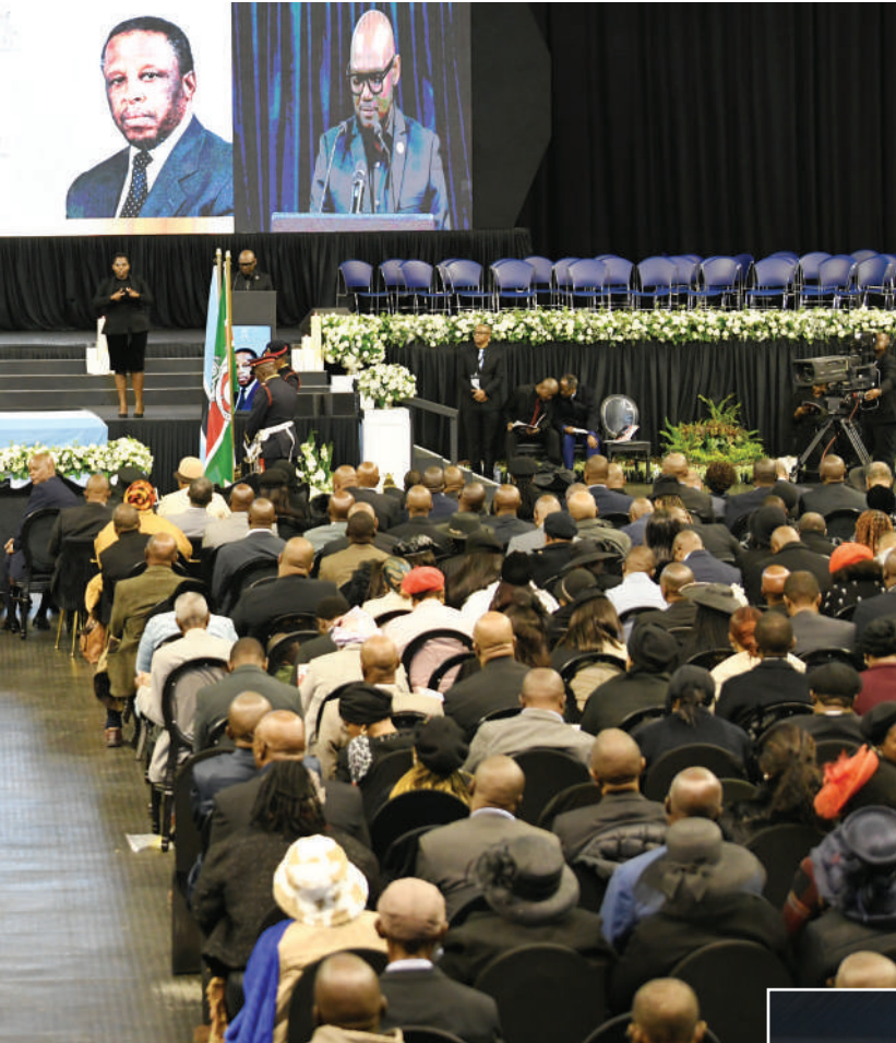
University of Botswana Sports arena