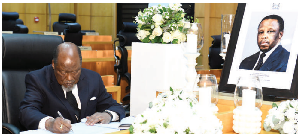
Former president of Mozambique, Mr Joaquim Chissano signing a book of condolences to pay tribute to Dr Mogae.