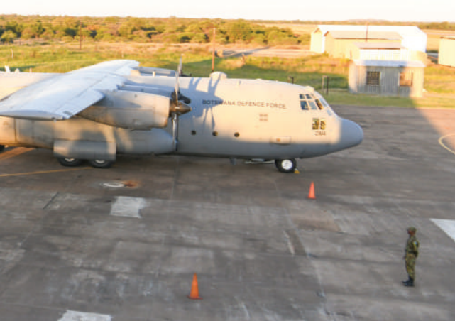
American four-engine turboprop military aircraft that... and back to Gaborone.