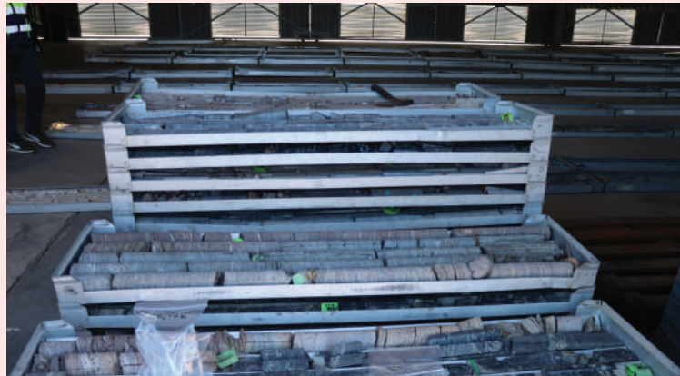
Tsodilo Resource, a base and precious metal exploration company is undertaking a study to establish the viability of the mineral deposits discovered at Gchwihaba Metals Project.