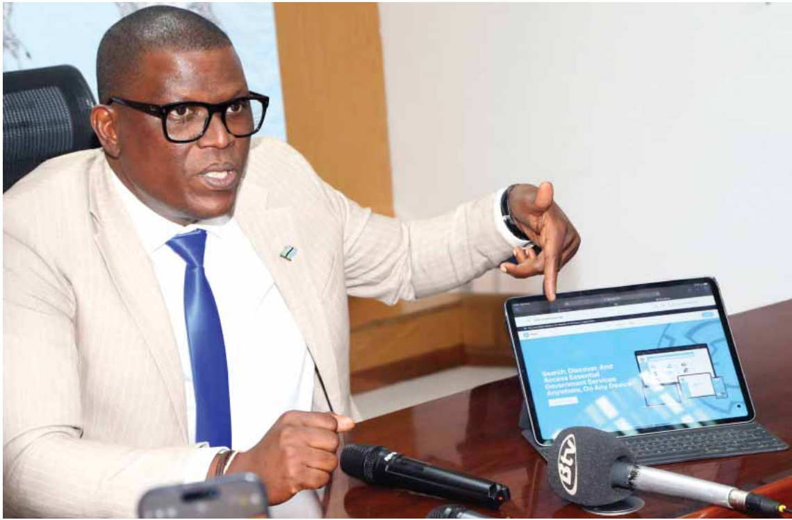
Minister of Communications and Innovation Mr David Tshere has requested P1.42 billion from Parliament to spearhead Botswana's digital transformation and infrastructure development for the 2026/27 financial year. He said funds would be used for implementation of several projects, including Information and Communication Technology, research and development, as well as detection and disposal of radioactive materials.