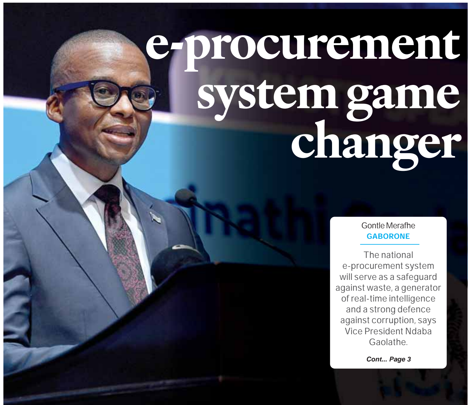
Vice President and Minister of Finance Ndaba Gaolathe at the National Public Procurement Pitso in Gaborone on Tuesday. He said the national e-procurement system that government intended to develop by 2027, would serve as a safeguard against waste, a generator of real-time intelligence and a strong defence against corruption.