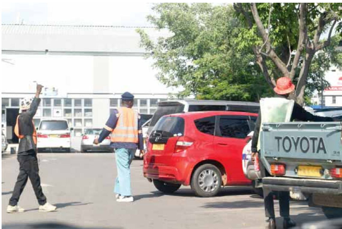
Gaborone Mayor, Mr Oarabile Motlaleng announced during a full council meeting on Monday that stricter measures would be enforced to address the growing problem of self-appointed parking assistants operating across the city. He said while some may have good intentions, many were forcefully demanding payment, littering, disturbing drivers and in some cases, even damaging vehicles.

Mr Motlaleng also announced stricter enforcement measures to address the growing problem of self-appointed parking assistants and abandoned roadside structures across the capital.