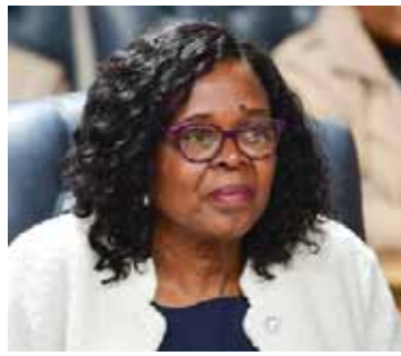
Minister of Child Welfare and Basic Education Ms Nono Kgafela-Mokoka

Furthermore, Minister Kgafela-Mokoka reminded teachers and non-teaching staff that government