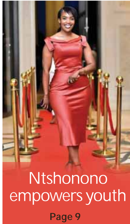
Ntshonono empowers youth