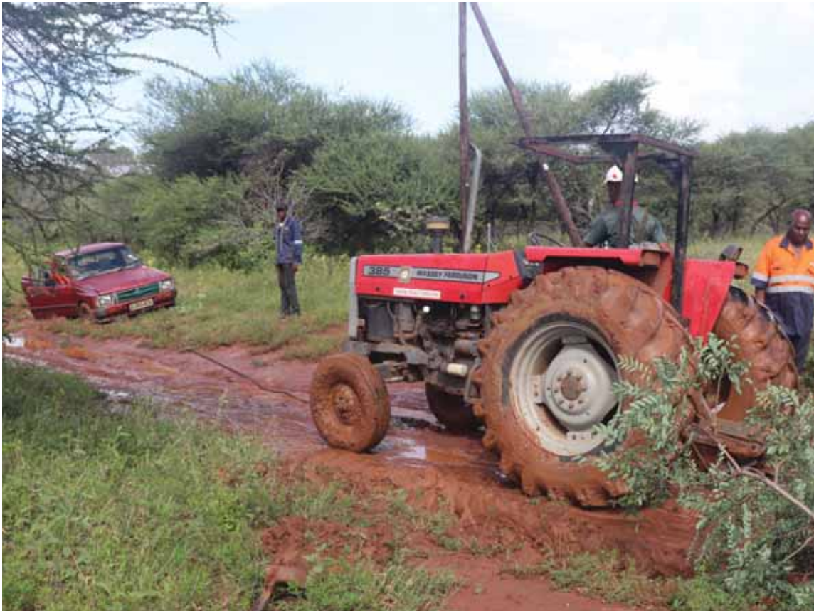
A tractor attempting to tow a van stuck in the mud in Lerala but also became immobilised following the heavy rains that left roads in the area impassable.