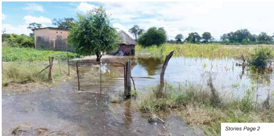
Stories Page 2

Three farmers lost 62 goats and 111 chickens in Tswapong