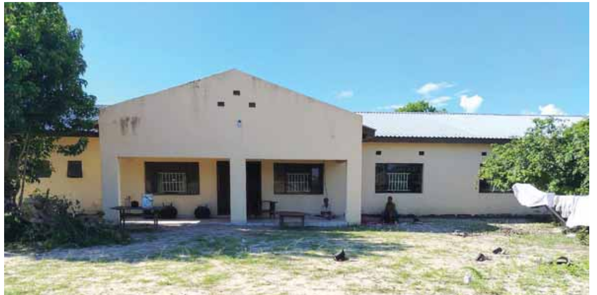
Khwai Development Trust has pledged its office to accommodate flood victims.

In addition, he said the flood situation had also affected some