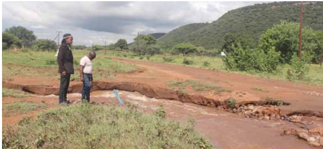
Heavy downpours on Sunday caused damages and widespread destruction in some areas in Tswapong.