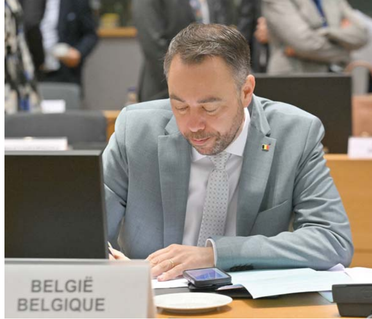
Belgium's Deputy Prime Minister and Minister of Foreign Affairs, European Affairs and Development Cooperation Maxime Prevot