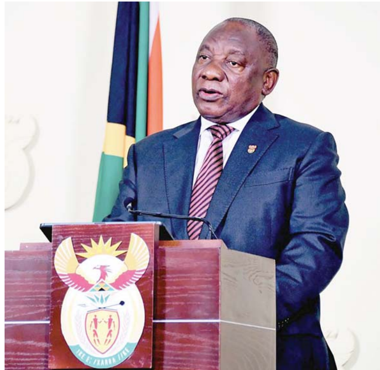
South Africa president Cyril Ramaphosa