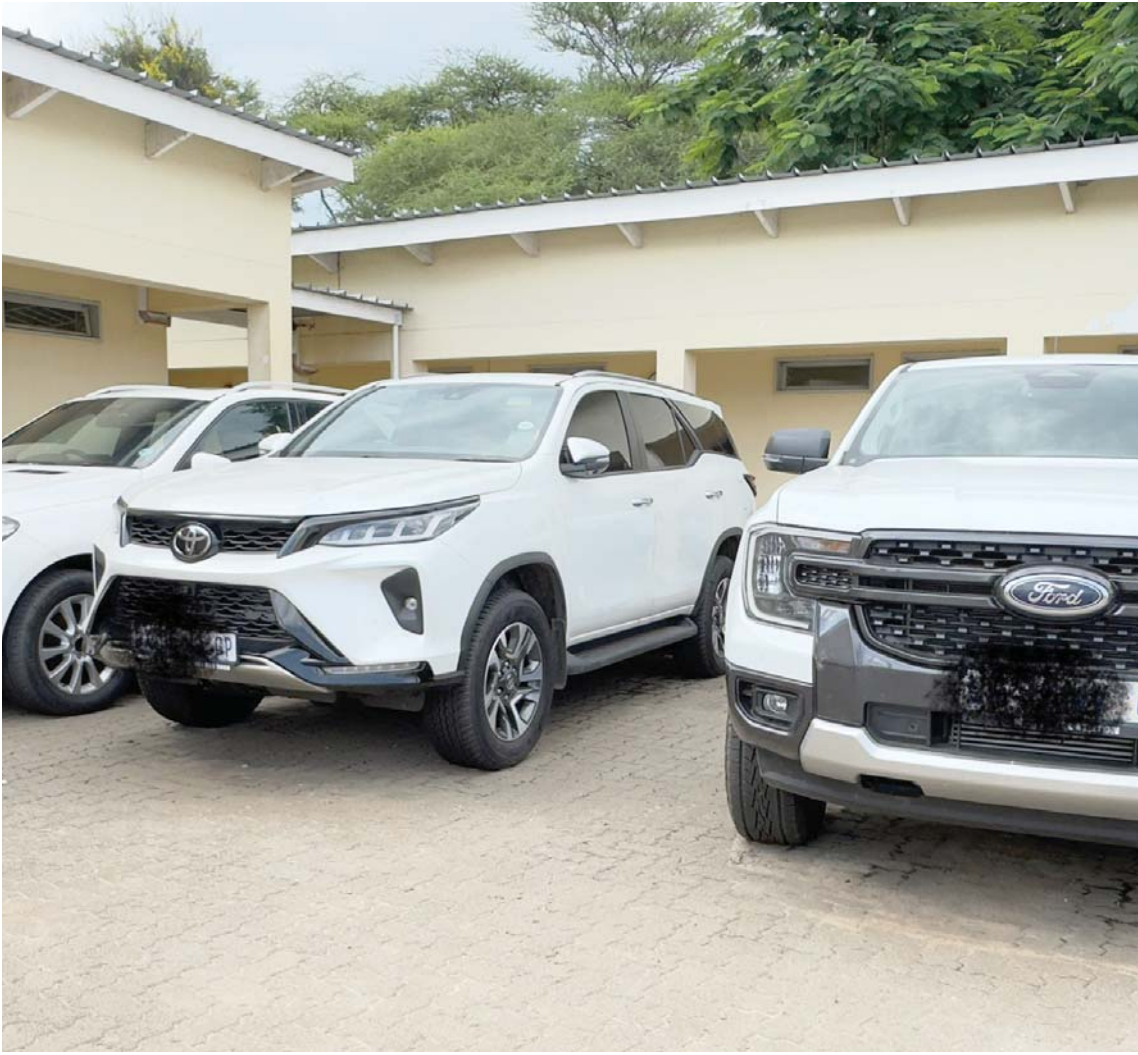
Some of the vehicles impounded by the police at Kazungula One Stop Border Post. The vehicles are all South African registered.