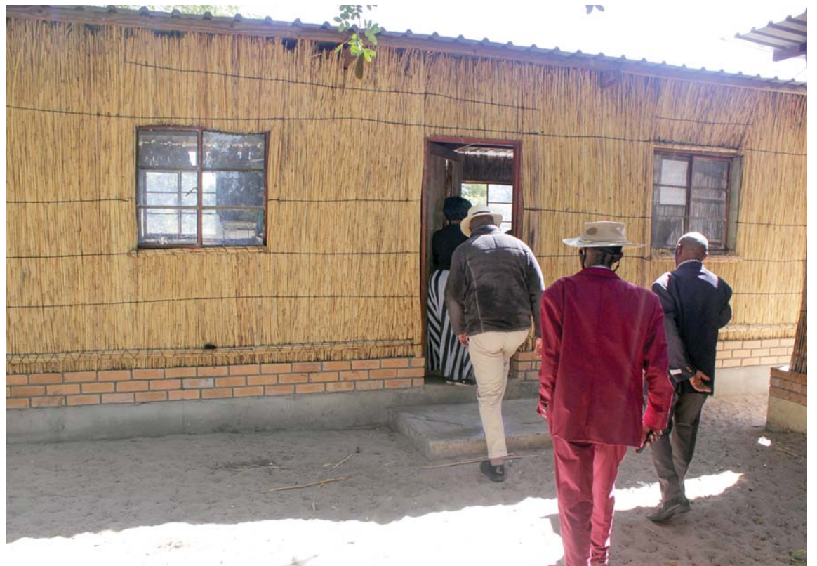
Minister of Local Government and Traditional Affairs, Mr Kethhalefile Motshegwa told Parliament that the process to upgrade Shaikarawe Primary School to a fully fledged school had commenced.