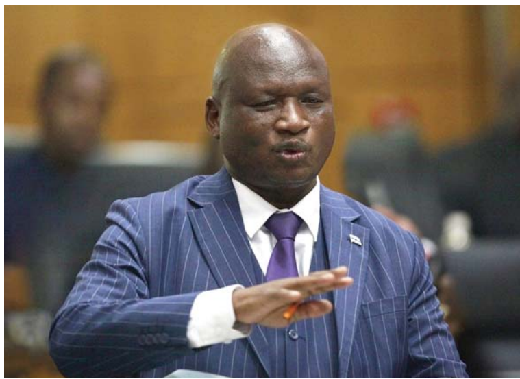
Minister of Water and Human Settlement, Mr Onneetse Ramogapi is expected to launch the Bonno National Housing Programme in Mabutsane’s Molwaagale Ward tomorrow.

Government is dedicated to fostering innovation, enhancing infrastructure and leveraging Botswana’s unique economic strengths to drive long-term prosperity, President Boko said. BOPA