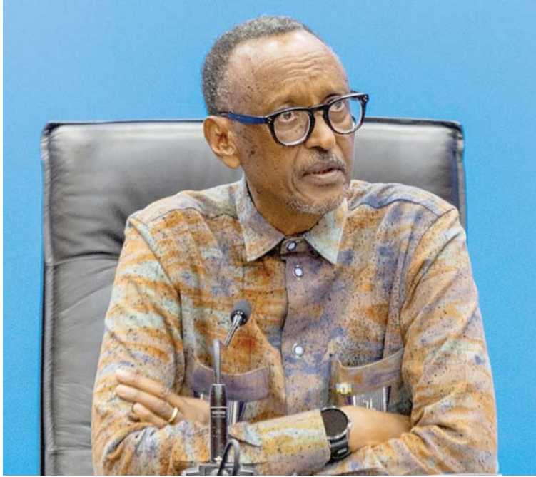
Rwanda president Paul Kagame

"Never, ever, as long as I am president of the DRC, will I have in front of me the delegation of the M23 or the AFC there ... to negotiate," Tshisekedi said in an interview in August 2024. Xinhua