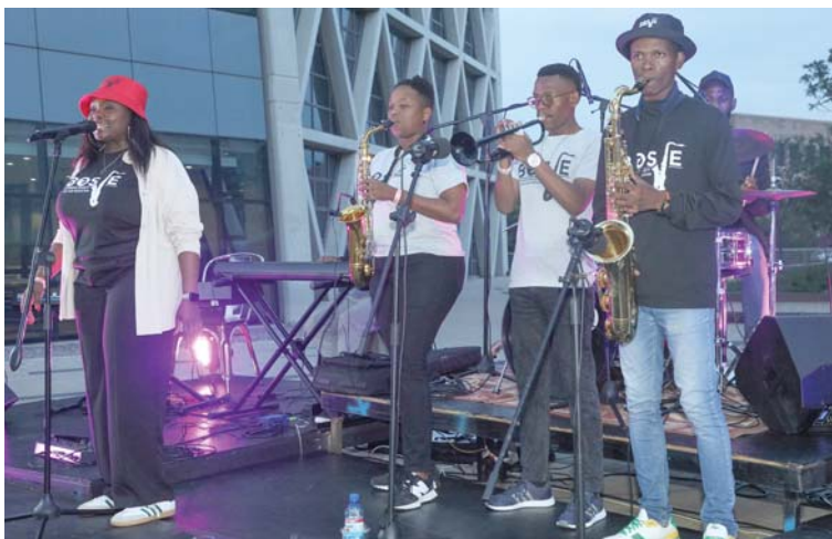
Botswana Society for Jazz Education performing at the Breezing Featuring WDP and Friends Jazz event in Gaborone on Sunday.