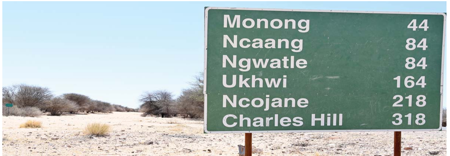
Minister of Transport and Infrastructure, Mr Noah Salakae said due to budgetary constraints, there was currently no plans to design and construct Hukuntsi-Ncojane road and access roads at Zutshwa, Ngwatle, Ncaang, Hunhukwe, Monong, Xhaa and Ukhwi roads.