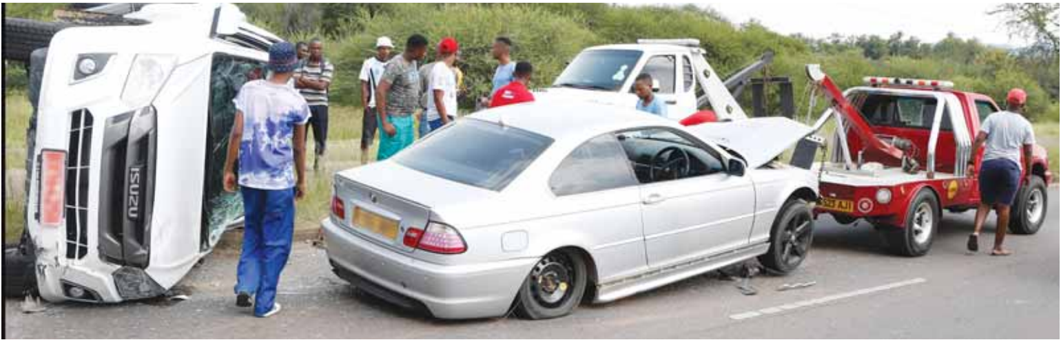
A total of 3 195 cases of causing death by dangerous driving were reported nationwide between 2016 and 2025.

Additionally, he had asked the minister when he intended to visit the project site to assess first-hand the severity of the road’s condition. BOPA