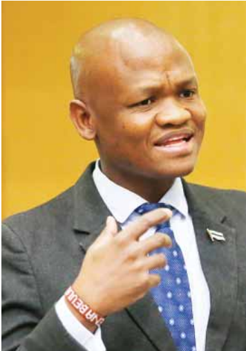
Acting Minister of Lands and Agriculture Dr Edwin Dikoloti

The Ministry of Lands and Agriculture, is committed to take decisive steps to allocate land orderly, transparently and equitably to all citizens, says acting minister, Dr Edwin Dikoloti.