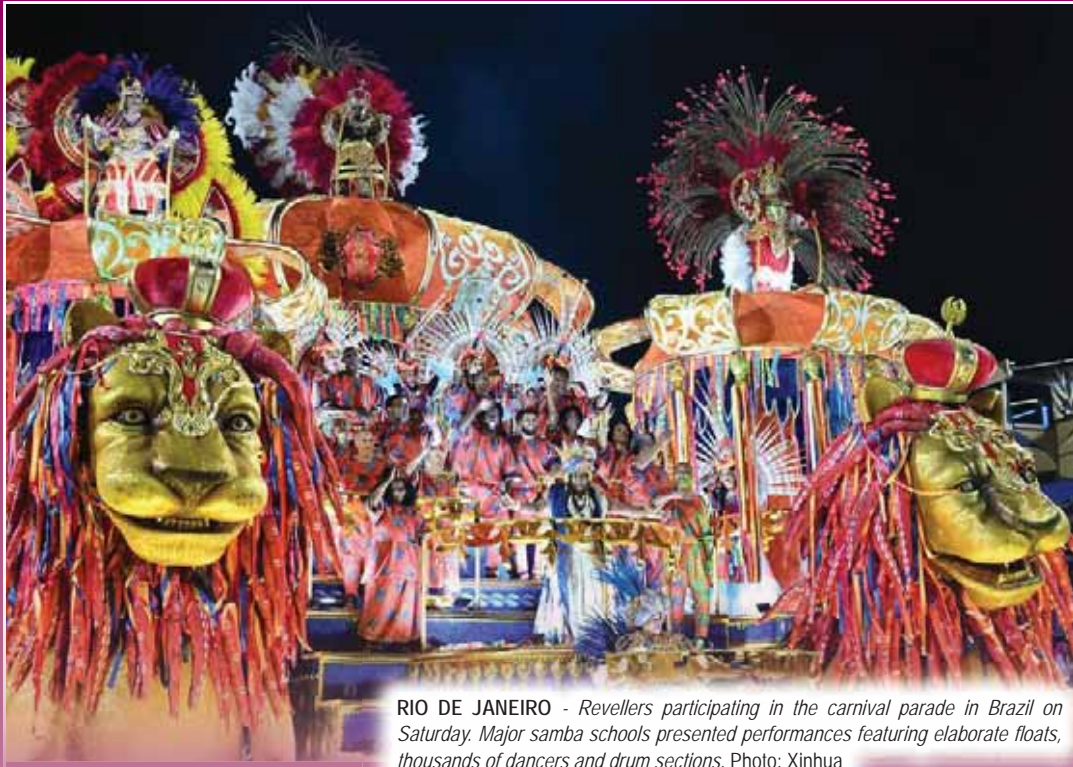
RIO DE JANEIRO - Revellers participating in the carnival parade in Brazil on Saturday. Major samba schools presented performances featuring elaborate floats, thousands of dancers and drum sections.

Preliminary information from investigative sources suggested a possible electrical short circuit, though authorities are yet to confirm its origin. Xinhua