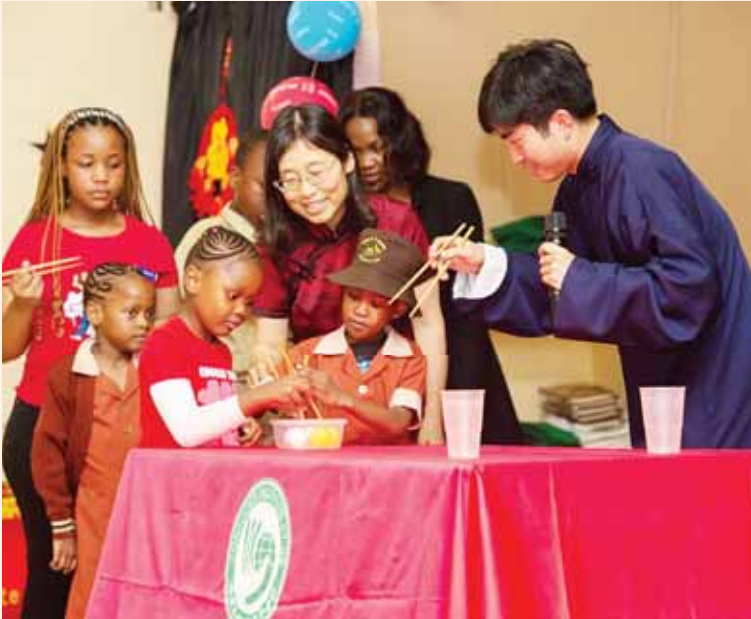
GABORONE - Children using chopsticks at an event to celebrate the Chinese Spring Festival on Tuesday. Co-hosted by the Confucius Institute at the University of Botswana and the Legate English Medium School, the event promoted cultural exchange.

Local authorities have stepped up security, sanitation, and health services to ensure safe celebrations, with campaigns promoting peaceful coexistence, diversity and responsible conduct. Xinhua