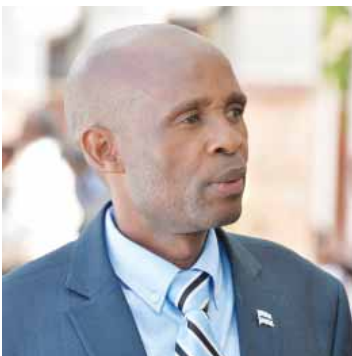
Minister of Higher Education Mr Prince Maele

Instead, he urged them to focus on strategic oversight, noting that substantial work remained