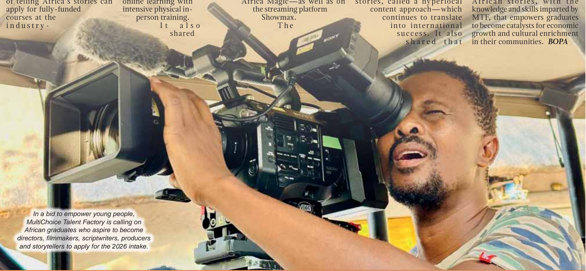
In a bid to empower young people, MultiChoice Talent Factory is calling on African graduates who aspire to become directors, filmmakers, scriptwriters, producers and storytellers to apply for the 2026 intake.

a number of MTF graduates have participated in and won numerous accolades at the Africa Magic Viewers' Choice Awards (AMVCA), Kalasha Awards, Uganda Film Festival, and the Women in Film Awards, among others. While in addition, alumni regularly collaborate with creatives in global spaces, including the European Film Market and the Durban FilmMart. For the organisation, the nominations and award wins further testify to the calibre of filmmakers that MTF produces individuals who can compete on a global scale by telling authentic African stories, with the knowledge and skills imparted by MTF, that empowers graduates to become catalysts for economic growth and cultural enrichment in their communities. BOPA