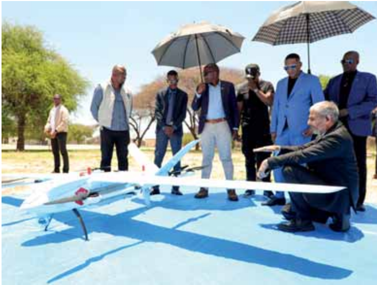
Medical delivery drones is an innovative breakthrough that will transform the way Ministry of Health has been delivering healthcare across the nation.

The innovation, which was launched by President Advocate Duma Boko, aligns with government's commitment to equitable healthcare, as no citizen should be denied timely access to critical treatment. BOPA