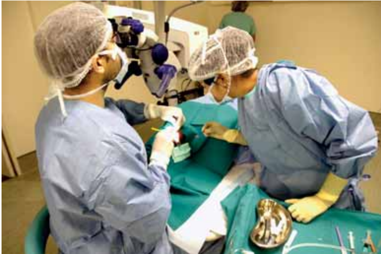
Two cataract surgery campaigns were conducted in 2025 at Selebi Phikwe Government Hospital and Scottish Livingstone Hospital to restore sight to 694 Batswana.

He said the KidsOR project, supported by the Lansdowns, had delivered transformative change by reducing waiting times, improving theatre infrastructure, and introducing sustainable energy solutions. With Nyangabgwe Referral Hospital preparing for its official opening and training programmes progressing, Botswana is positioning itself as a regional leader in paediatric surgery in Southern Africa.