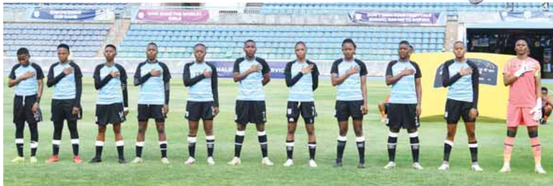
The Mares made history by qualifying for the WAFCON 2024 to be held in Morocco.

and Kenya. Kenya was crowned women champions after beating Namibia in a game that was fiery while South African men walked away with gold after beating Kenya.