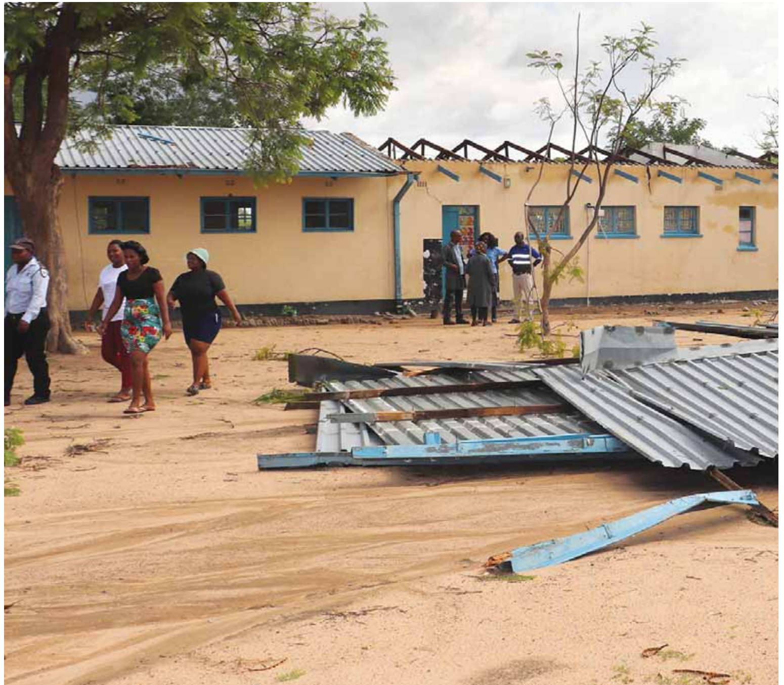
Classrooms at Tsamaya Primary School were some of the structures that were affected by the massive winds that swept through Tsamaya on Thursday. Businesses such as the hardware, retail stores, homesteads and other structures were also affected.