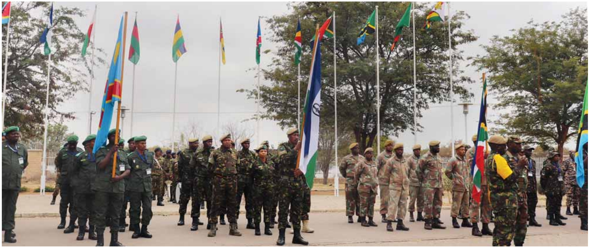
Military officers who participated in the recent SADC communications exercise code named 'Dipuisanyo' which gathered the military, police and civilian representatives from 10 SADC member states. The exercise was meant to come up with ways to synchronise military radios from different SADC member states for them to communicate seamlessly.