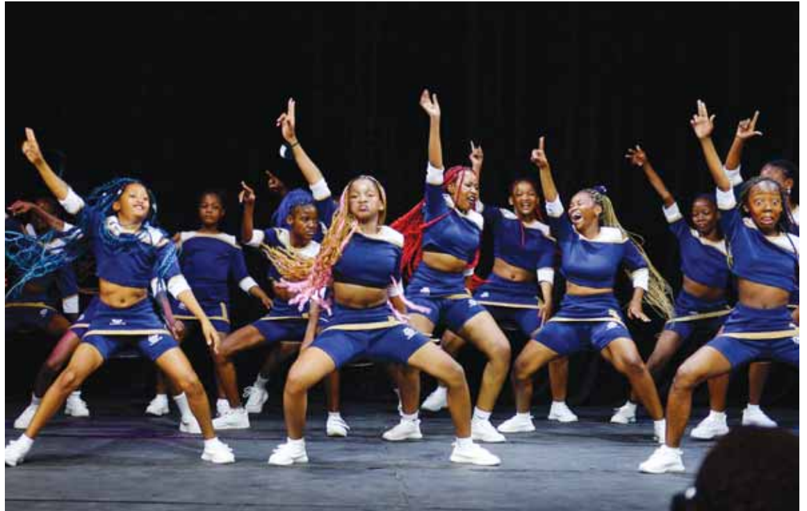
KatKim cheerleading squad performing during their appreciation ceremony in Gaborone on Saturday. The cheerleading squad was recognised for bagging gold and silver medals at the Africa Championships in South Africa recently.