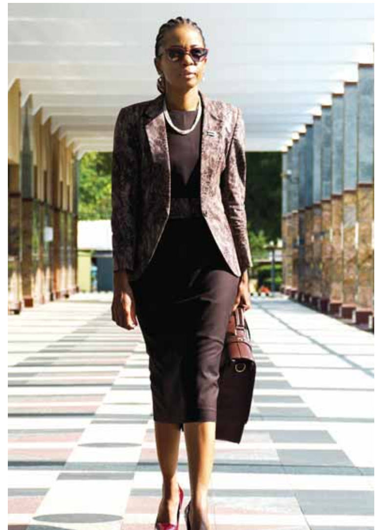
Minister Serame has told Parliament that the amendment of the Income Tax Act, which was under consideration would positively impact retiring members of pension funds.

He further enquired about the study that the minister had promised to undertake to enhance withdrawals for other pensioners than deferred ones as is currently the case. BOPA