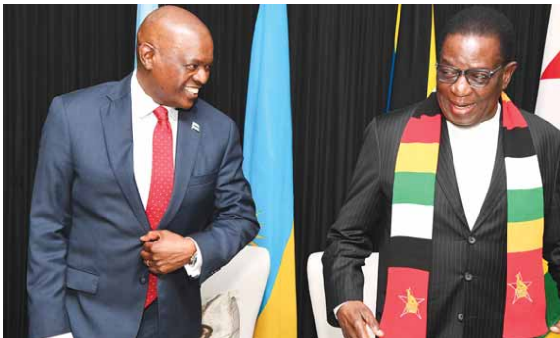
Minister Mokgethi said there was no signed agreement between Botswana and Zimbabwe on the use of national identity cards to cross the borders. She said President Masisi and Dr Mnangagwa discussed facilitating free movement between the two nations using national IDs during the recent Kusi Ideas Festival.

Ms Serame also explained that the proposals for supplementary estimates under the development budget would be sought from slow spending projects through development budget reallocation, which effectively means that it will not increase the 2023/24 annual budget provision. The supplementary estimates are currently before Parliament for debate. BOPA