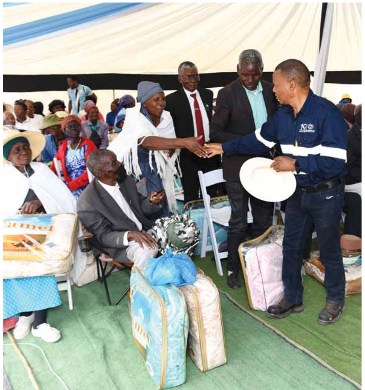
Acting President Tsogwane (right) giving out blankets during a luncheon hosted in honour of the elders in Kedia on Saturday. He said government would continue to strive for the betterment of lives of the elderly people in the country through improved programmes.

He noted that the event, held at the clinic, was also an opportunity for elders to access health services as many seldom visited health facilities. At the event pensioners were tested for hypertension and diabetes among other diseases. BOPA