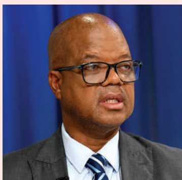
Minister for State President, Defence and Security Mr Moeti Mohwasa

insourcing, he said was informed by years of experience with outsourced services across government ministries and departments. While outsourcing has initially been adopted as a cost-saving measure aimed at improving efficiency, the minister said government assessments revealed that the expected benefits had not always materialised.