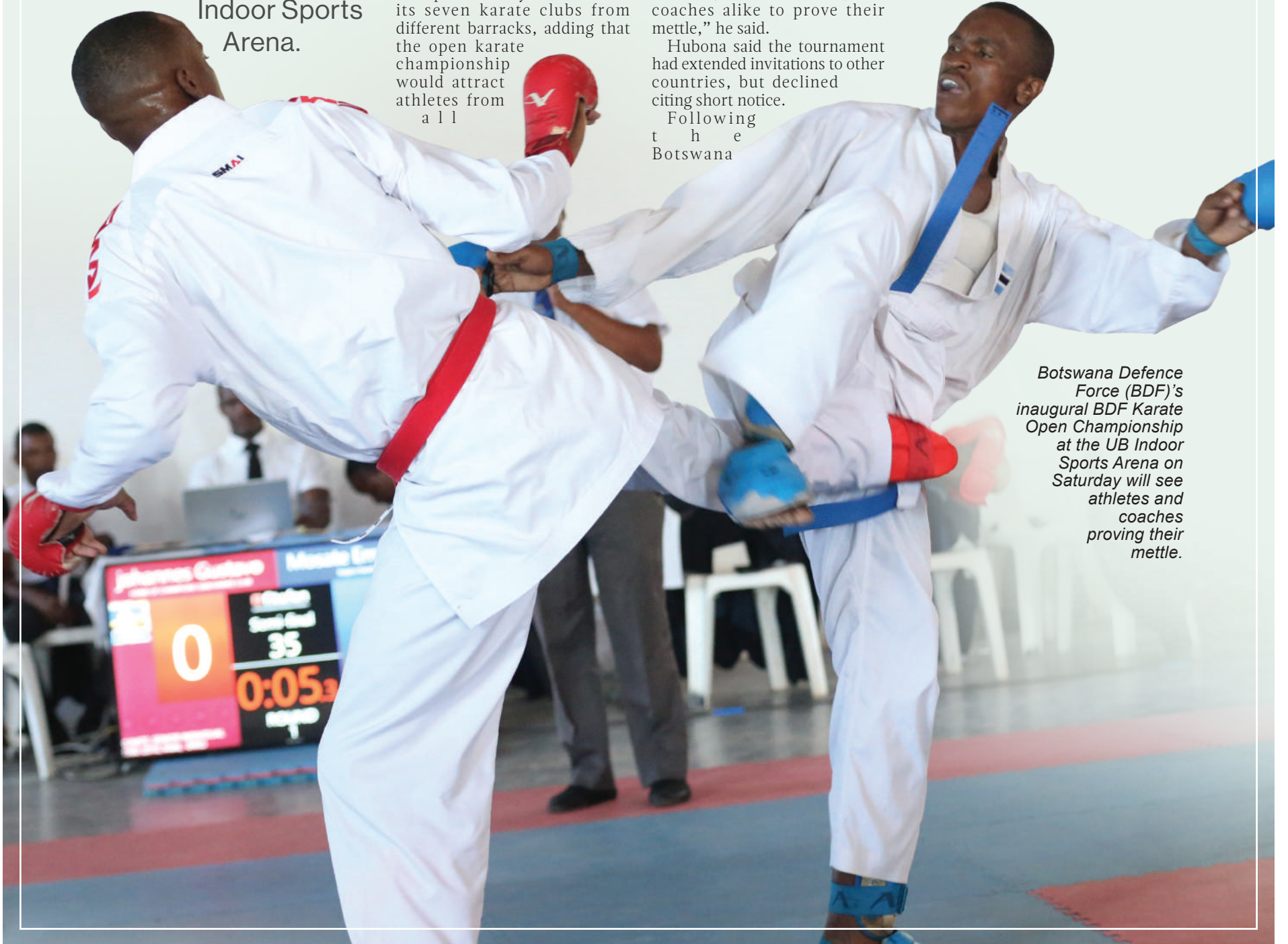
Botswana Defence Force (BDF)'s inaugural BDF Karate Open Championship at the UB Indoor Sports Arena on Saturday will see athletes and coaches proving their mettle.

However, he said they were pleading with sponsors to come on board and be part of the historic event. BOPA