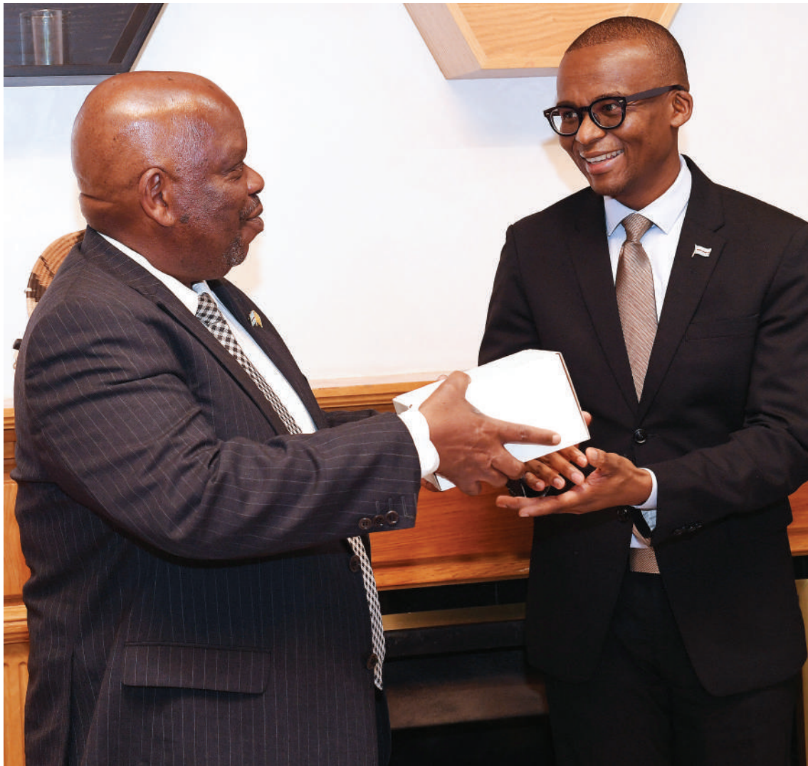
Vice President and Minister of Finance, Mr Ndaba Gaolathe (right) and Ntlo Ya Dikgosi chairperson, Kgosi Malope II during a dinner for Dikgosi in Gaborone on Monday. Mr Gaolathe said government would soon meet with members of Ntlo Ya Dikgosi to discuss the Botswana Economic Transformation Programme and gather their views and ideas on the initiative.

Given the urgency and the need to provide timely assistance, councils are expected to prioritise the exercise and deploy necessary resources for its successful implementation. BOPA