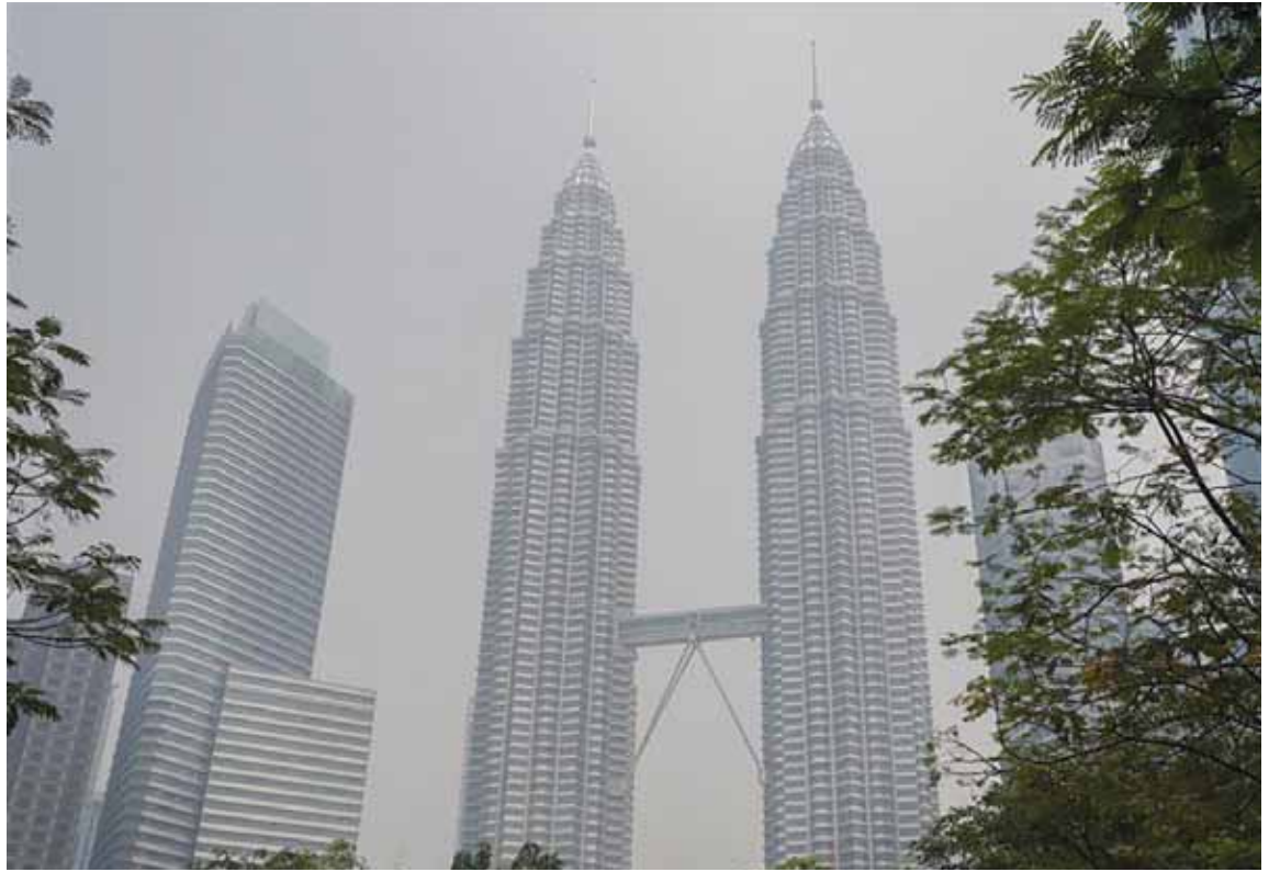
KUALA LUMPUR - Petronas Twin Towers shrouded in haze. Hundreds of schools were closed in Malaysia's Sarawak state after air quality dropped due to the ongoing haze, the state Education Department said recently. Air quality in several parts of the state were rated as 'unhealthy' with the Air Pollution Index reading between 120 and 186 points.

Guterres reiterated his call for an immediate halt to the fighting and a return to dialogue, saying he will continue to engage with regional leaders and Sudanese stakeholders to find a way out of this crisis, it said. Xinhua