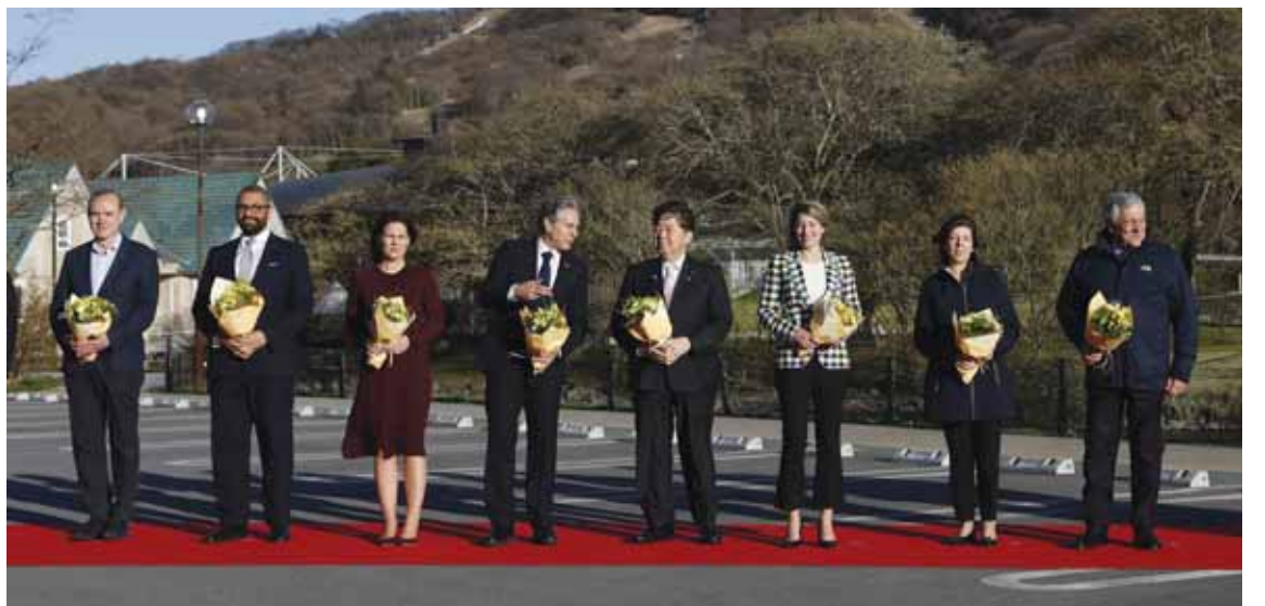
KARUIZAWA - Deputy secretary general of the European External Action Service (EEAS), Enrique Mora, British Foreign Secretary James Cleverly, German Foreign Minister Annalena Baerbock, US Secretary of State Antony Blinken, Japan's Foreign Minister Yoshimasa Hayashi, Canadian Foreign Minister Melanie Joly, French Foreign Minister Catherine Colonna and Italy's Foreign Minister Antonio Tajani at a welcoming ceremony for G7 Foreign Ministers' meeting in Japan on Sunday.

The inclusion of natural gas within the phase-out goals adds pressure on Japan, which plans to rely on the energy source for around 20 per cent of its electricity generation in fiscal 2030, alongside coal for roughly 19 per cent and crude oil for around 2 per cent, the report added. Xinhua