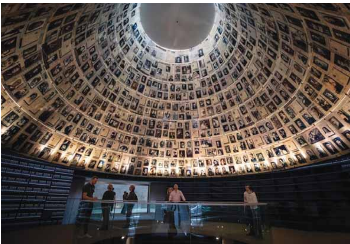
JERUSALEM - People visiting Yad Vashem, Israel's official Holocaust memorial on Sunday. Israel's national annual Holocaust remembrance day will be marked on Monday and Tuesday.