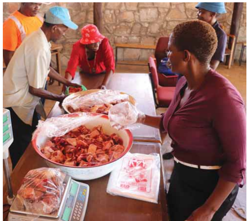
Maloko a Tsamama Trust a rekisa nama ya kamela kwa kgotleng ya Tsabong bosheng. Mo nakong ya gompieno dikamela di feta makgolo a matlhano mme dipatlisiso tsa BUAN di supile fa palo ya dikamela e feta selekanyo se lefelo le ka se amogelang. Ka jalo khuduthamaga ya Tsamama Trust e tsere tshwetso ya go di tlhaba le go rekisa nama ya tsone. Trust gape e ikaelela go rekisa le di-tswa kameleng tse dingwe mo isagong.

A re kereke ke yone e ka bopang setshaba le go tsisa thitibalo le ledula gareng ga batho ka jalo a rotloetsa maloko a mokgatlo go tswela ba tsaya karolo ya go rutuntsha ka borai jwa nnotagi ka se e tlaa bo e le go tswaledisa letsema la go bopa setshaba. BOPA