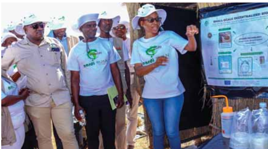
Project leader explaining about the Low-Tech Mobile Kilns for production of Biochar from biowaste and waste heat utilization, Valorization of farming residues through biorefinery processes (mushroom production) technology