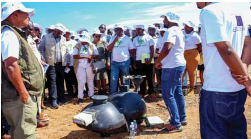
Project leader explaining about the Solar Supported Bio-gas Digester technology