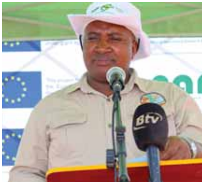
Minister of Agriculture-Honourable Fidelis Molao delivering keynote address