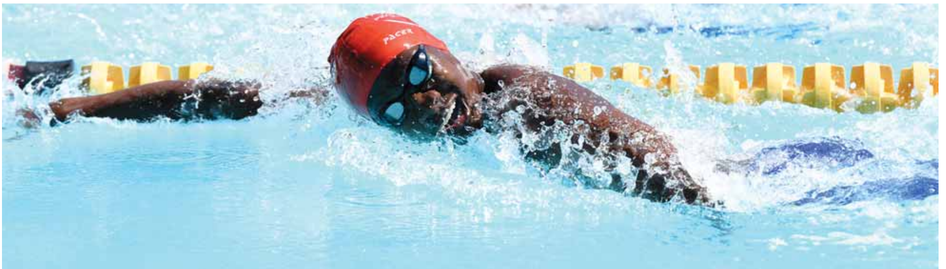
Gaamangwe (top) participating in the men's 200-metre freestyle during the 4 th DMSS Gators swimming gala in Gaborone on Saturday. He won the category by clocking 2:12.11. Tselane (bottom) won the women's 200-metre freestyle by clocking 2:25.81 at the same event.

Muhomba Tariro of Bulawayo Amateur Swimming is the girls 14-year-olds 100 metres breaststroke champion, stopping the clock at 1:29.29, followed by her teammate, Tatenda Muhomba with 1:34.75 while Realeboga Molelowatladi of Gaborone Aquatics Club finished third with 1:40.31. BOPA