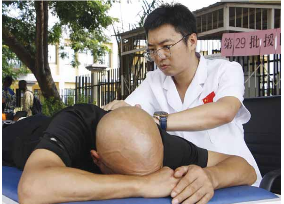
BRAZZAVILLE - A Chinese doctor demonstrating Chinese massage therapy at an open house hosted by the Confucius Classroom in the Republic of the Congo on Saturday.

Confucius Classrooms are an extension of the Confucius Institute program. Whereas Confucius Institutes are university-based, Confucius Classrooms are partnerships with local schools and education centers with the goal of strengthening the Chinese language and culture programs at the school and in the local area. Xinhua