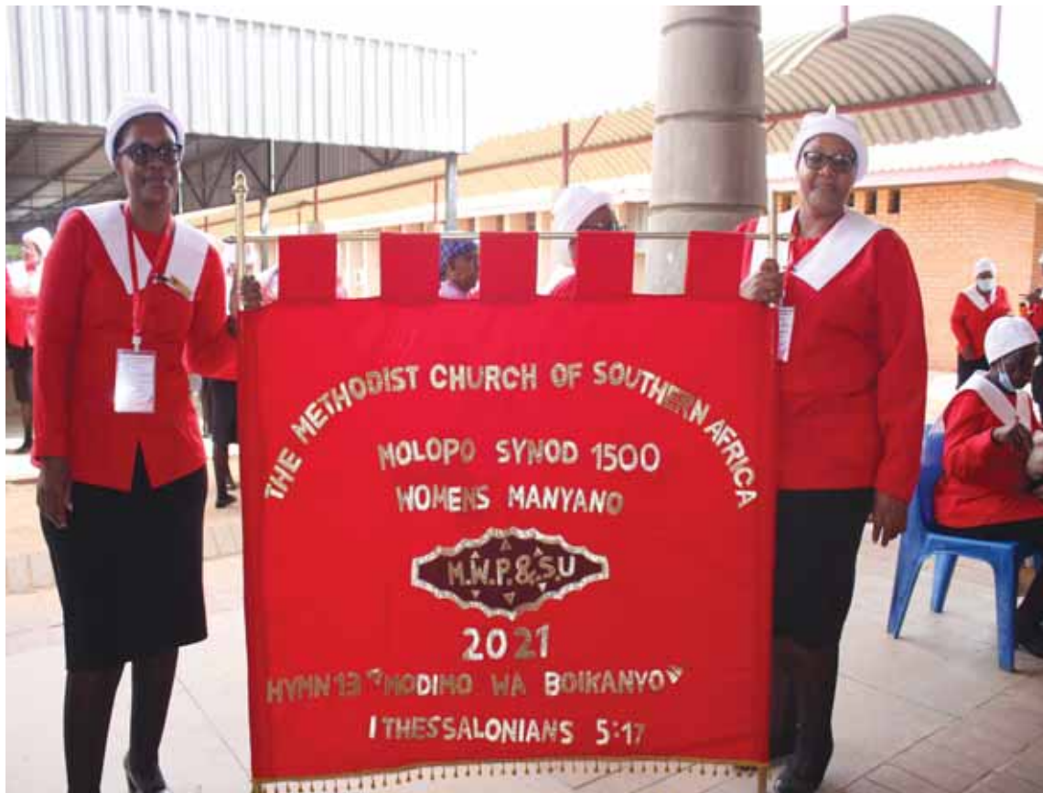
Members of the Methodist Church of Southern Africa-Molopo District at a women convention in Selebi Phikwe over the weekend. The women's wing aims to empower women so that they can provide for their families, create an inclusive environment for all as well as address social ills within communities.

She encouraged other organisations to follow suit by addressing GBV and all forms of discrimination. BOPA