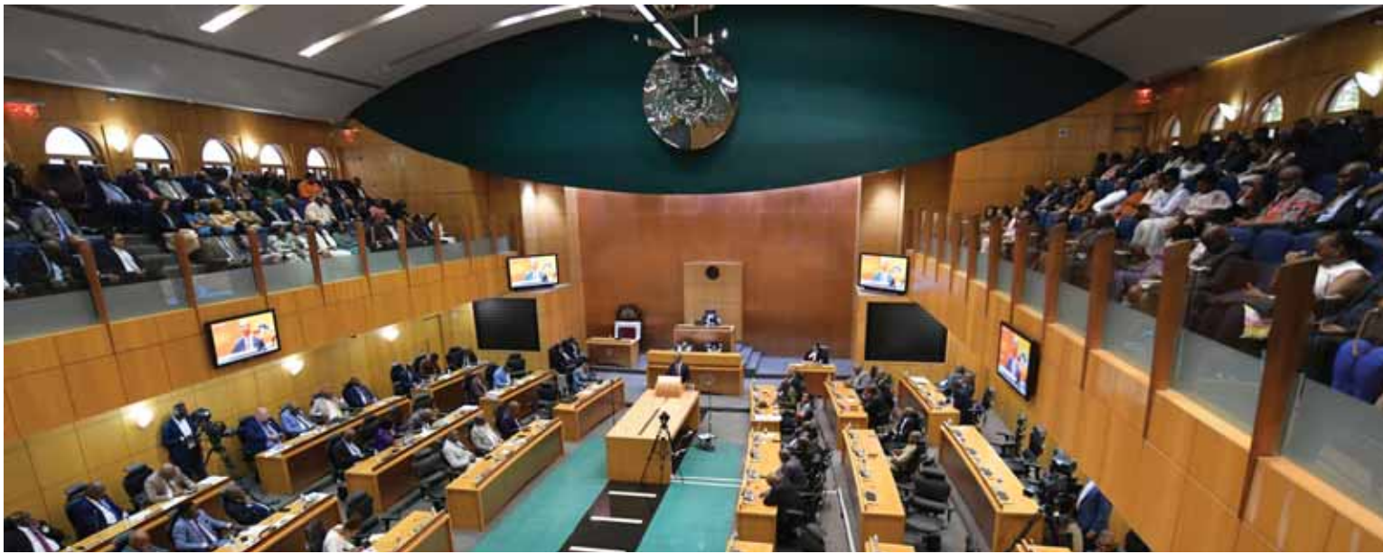
Legislators held different views on government's new austerity measures during their contributions to the 2026/27 proposed budget. While some MPs hailed the fiscal tightening as a necessary 'bitter pill' to rescue an economy characterised by empty coffers, others viewed the cuts as a threat to essential service delivery, arguing that the burden of recovery was being placed on the nation's most vulnerable.