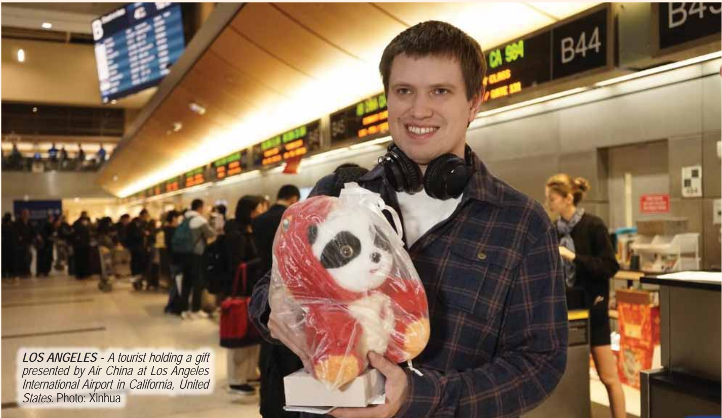
LOS ANGELES - A tourist holding a gift presented by Air China at Los Angeles International Airport in California, United States.