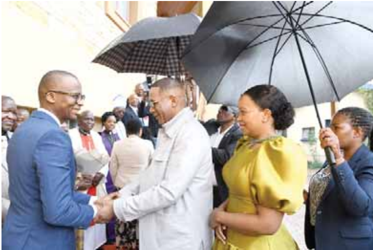
President Advocate Duma Boko (centre), First Lady Kaone (second right) and Vice President Ndaba Gaolathe at the Second National Thanksgiving Prayer Service in Gaborone on Sunday. Ms Boko said people united in prayer were blessed and sustained with peace during challenging times.

“Visioning for the country is spiritual. I am never despondent,” he said. President Boko expressed gratitude to the Church, saying its prayers sustained him, his family, the Cabinet and the nation of Botswana