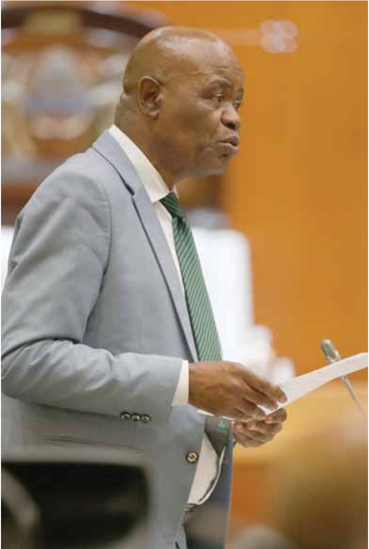
Minister of Labour and Home Affairs Maj. Gen. Pius Mokgware on Monday brought a bill to introduce citizenship by investment programme to attract investors and stimulate economic growth.

He dismissed those arguing that the bill opened the door to state capture, noting that many countries had the same arrangement but had never experienced anything of the sort. BOPA