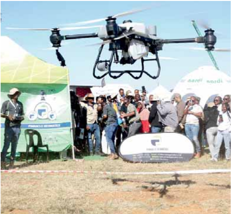
Government intends to adopt the use of precision farming method, which involves the use of technology to observe, measure and respond to variability in crops, soil and fields.

However, he noted that BMC had now improved on their turnaround time of paying suppliers.