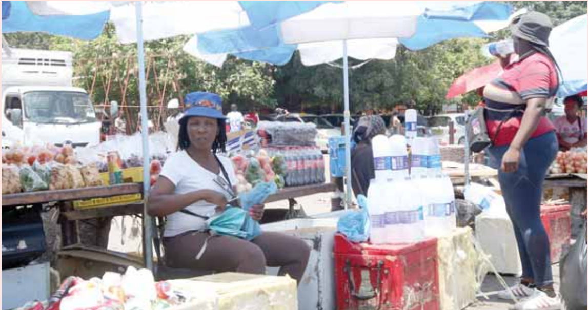
Vendors operating at the Gaborone bus rank market stalls were recently given a court order directing them to vacate the area by December 31 to pave way for upgrading of infrastructure.

He explained that the renovation tender was awarded through a lawful expression-of-interest process. The mayor added that temporary displacement of traders was unavoidable to allow construction of a new, modern multi-level terminal, which would be implemented in three phases, with the first phase expected to be completed by the end of 2026. BOPA