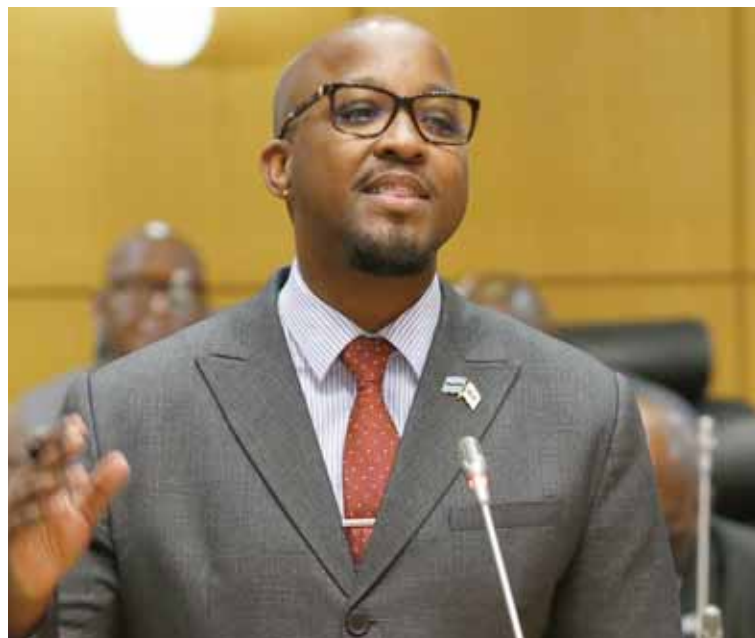
Minister of Health Dr Stephen Modise said COVID vaccines were approved by reputable health authorities and played a crucial role in reducing severe illness, hospitalisation and deaths.

A total number of 1.7 million in Botswana received two doses, translating into a total of 3.4 million doses of the COVID-19 vaccines, Dr Modise said.