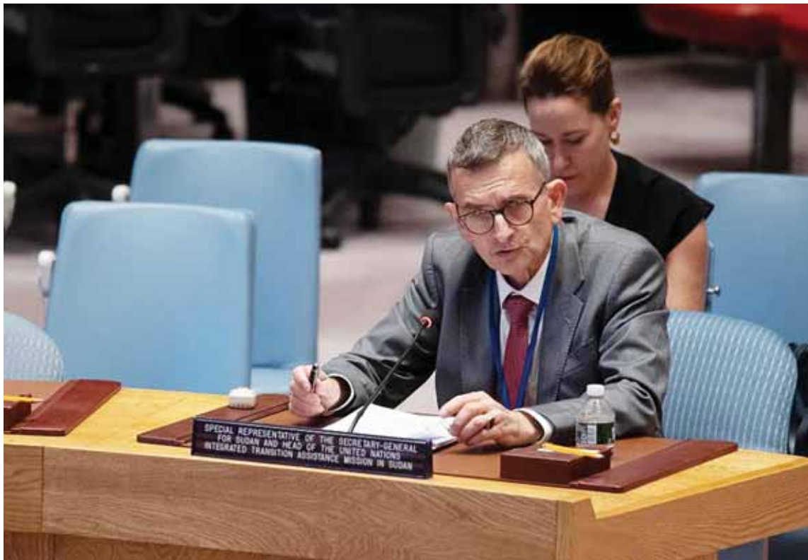
NEW YORK - Perthes during a Security Council meeting on Sudan at the UN headquarters on Tuesday. The envoy has vowed to help end the political crisis in Sudan.