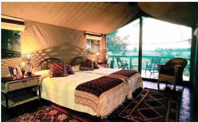
Collaboration between government and stakeholders on diversification the tourism sector can result in the industry contributing significantly to GDP.