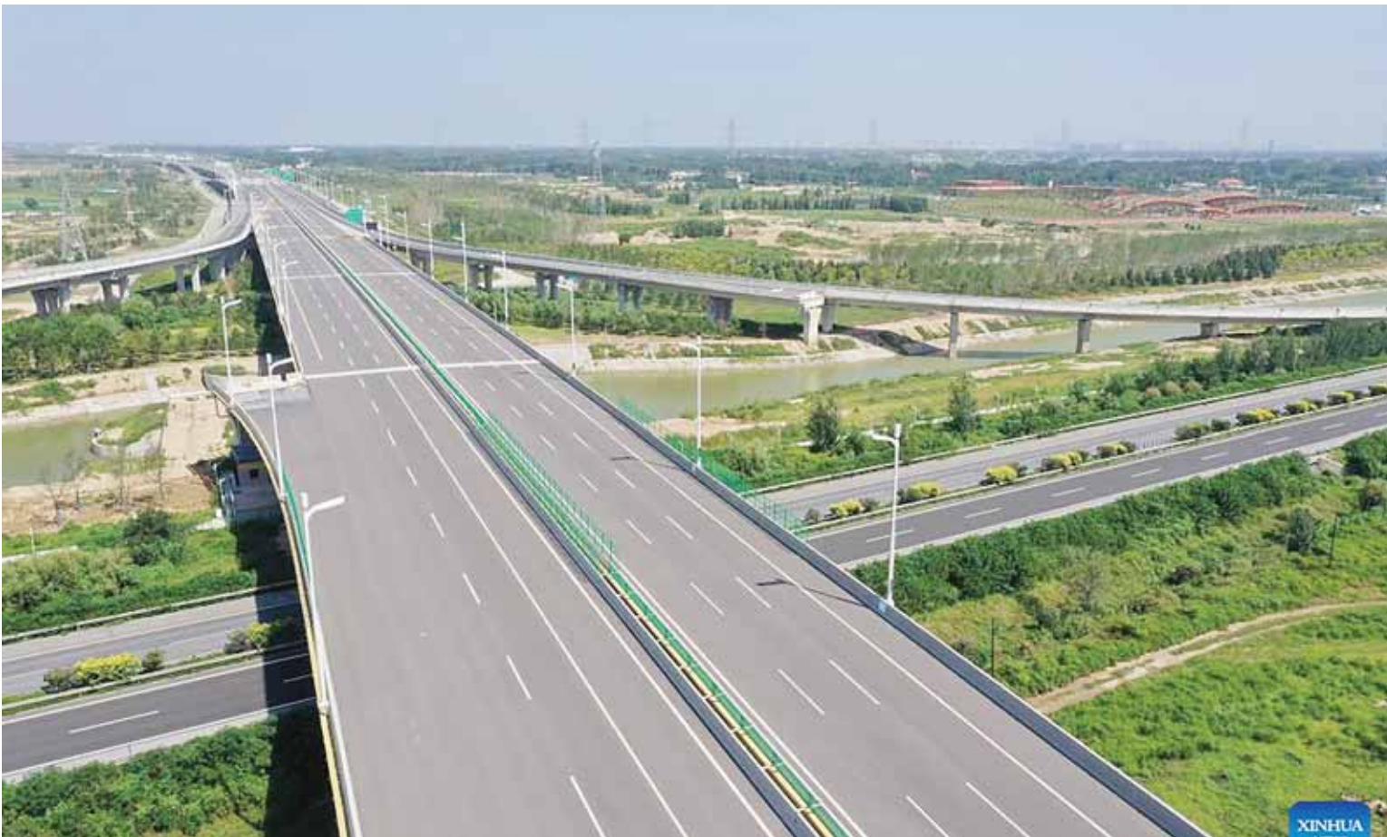
XIONG'AN - The connecting line between Haiyue Street and Beijing-Xiong'an expressway, in Xiong'an New Area, north China's Hebei Province. The main urban road network is expected to support large-scale construction in the area.