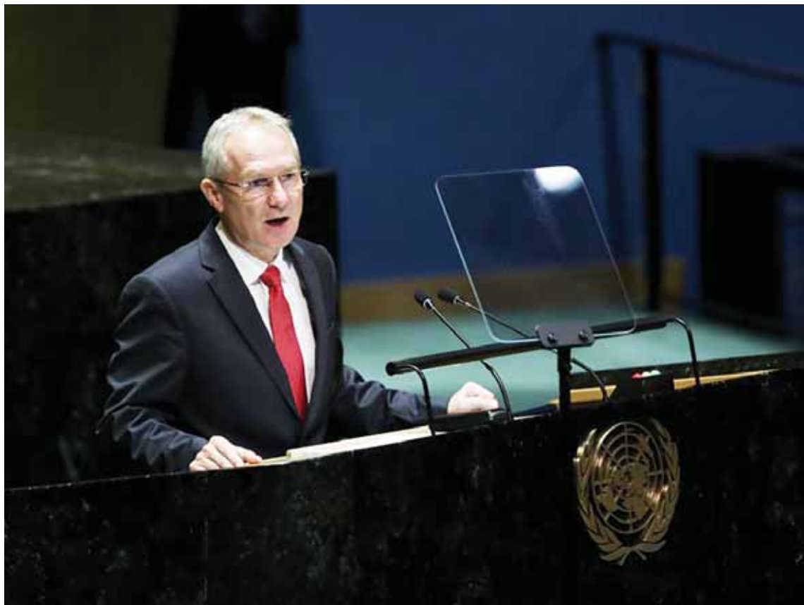
NEW YORK - Korosi speaking at the first plenary of the 77 th session of the General Assembly in the US on Tuesday. Xinhua

This also holds true for small arms and light weapons, the proliferation of which is a great obstacle to our development and progress around the world. We must work to stop their illicit trade," said Korosi. Xinhua