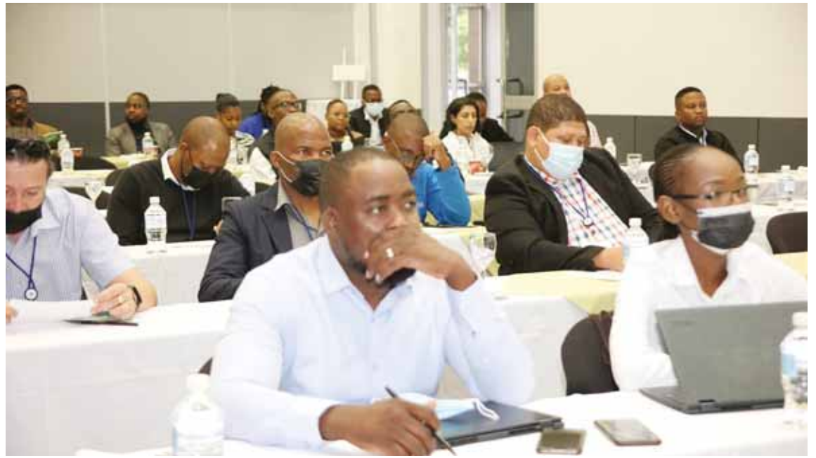
Technocrats, experts and information technology consumers at the 6th African Cyber Crime conference in Gaborone yesterday. Mr Masiga said protection of personal data was crucial in the current economic environment.

Stressing the need for institutions to protect data, he said cyber security was the enabler of the Fourth Industrial Revolution. BOPA