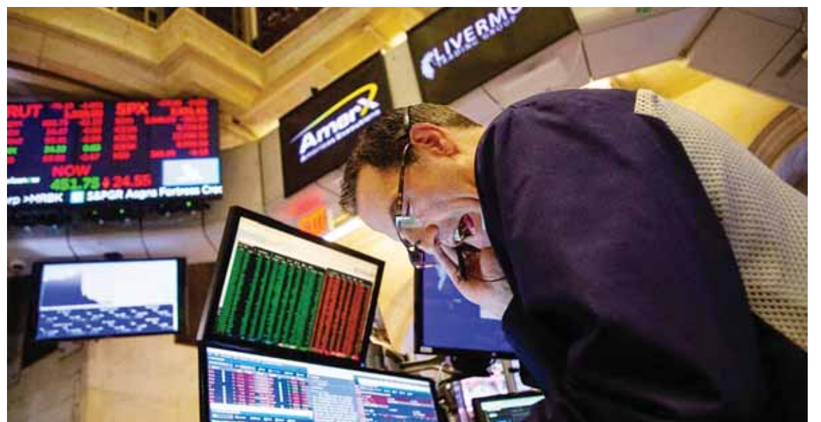
NEW YORK - A trader at the New York Stock Exchange in the US on Tuesday. Wall Street's three major averages plummeted as a hotter-than-expected US inflation report stoked fears that the Federal Reserve Bank of New York is likely to deliver more outsized rate hikes.

Tourk is not optimistic about the future, saying the chances of the United States falling into a recession are not small, and the question is how severe the recession would be. Xinhua