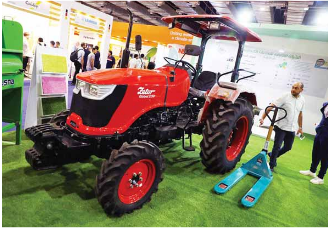
CAIRO - People visiting a booth of agricultural machinery at the Sahara Expo, the International Agricultural Exhibition for Africa and the Middle East, in Egypt, on Sunday. Over 150 companies from more than 20 countries participated at the agricultural expo which ended yesterday.