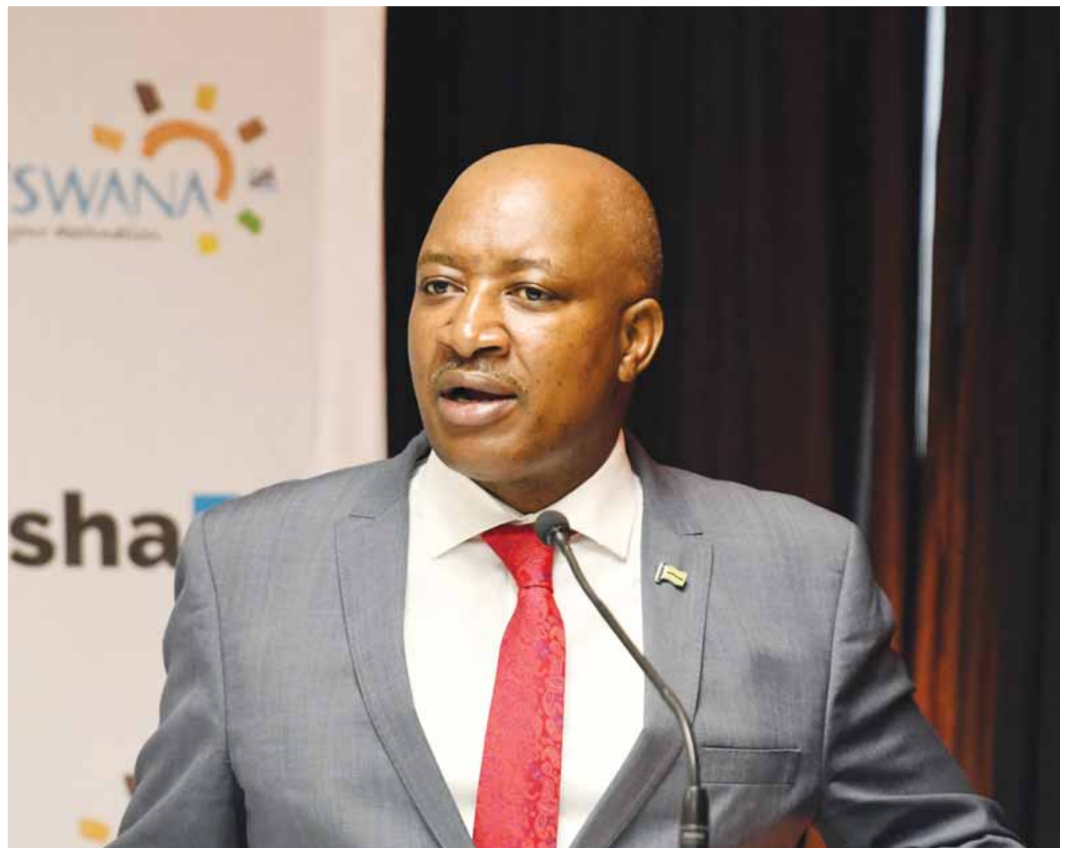
Minister of Agriculture, Mr Fidelis Molao addressing the media in Gaborone yesterday on the Selebi Phikwe citrus project first harvest ceremony and #PUSHABW Selebi Phikwe expo. The 1 500 hectare project's first harvest ceremony is set for March 21. The citrus project targets to export fresh citrus to international, regional and local markets. Minister Molao said his ministry played an important role in facilitating access to international markets.