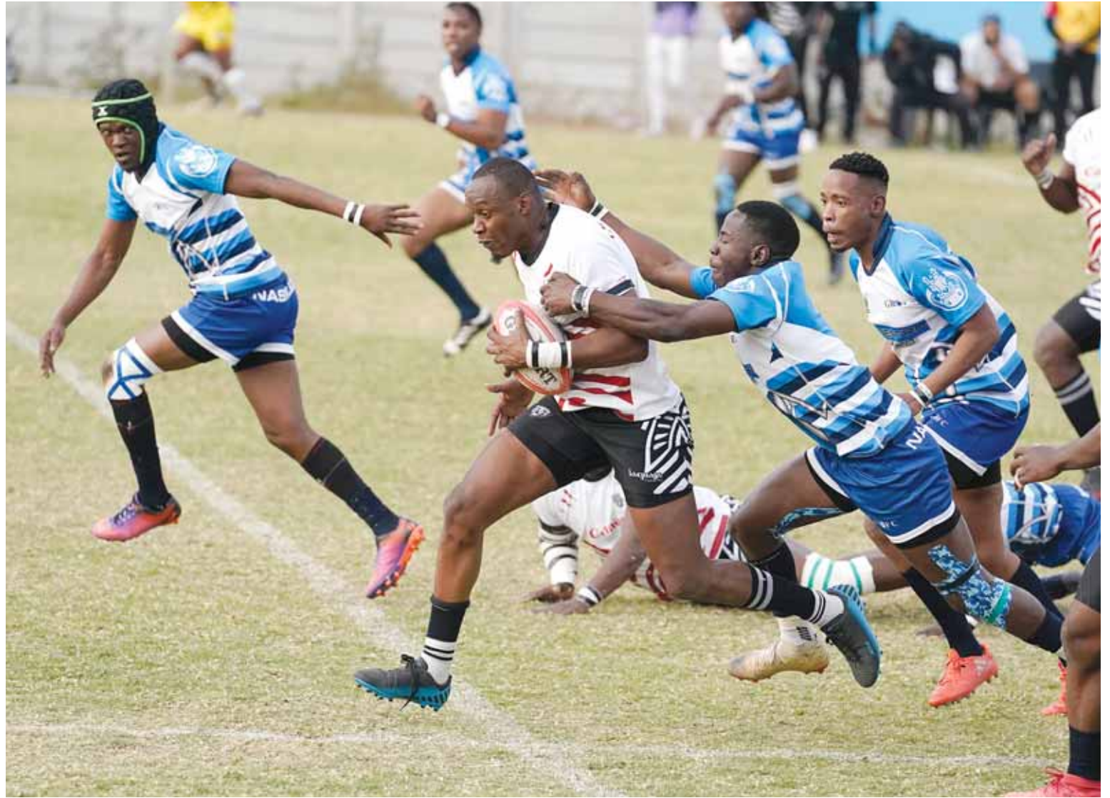
The Hogs (in blue) will go toe to toe with UB Rhinos during a pre-season knockout tournament at Wharic Park on Saturday.