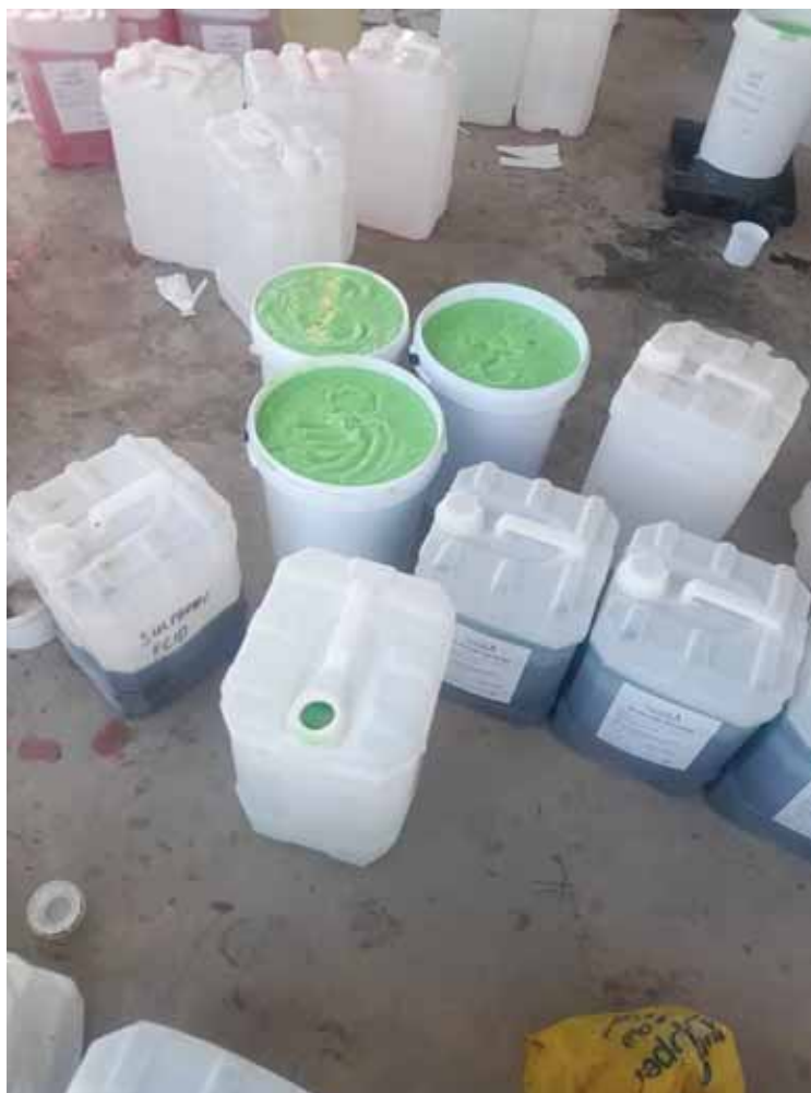
Some of the products manufactured by Zekethubojwa Company in Shakawe. The company has recently expanded its operations by commissioning a facility for manufacturing of cleaning products.

He complained that basing the valuation of a residential property on the living room, the kitchen and the built structure was insufficient in terms of determining its correct value. BOPA