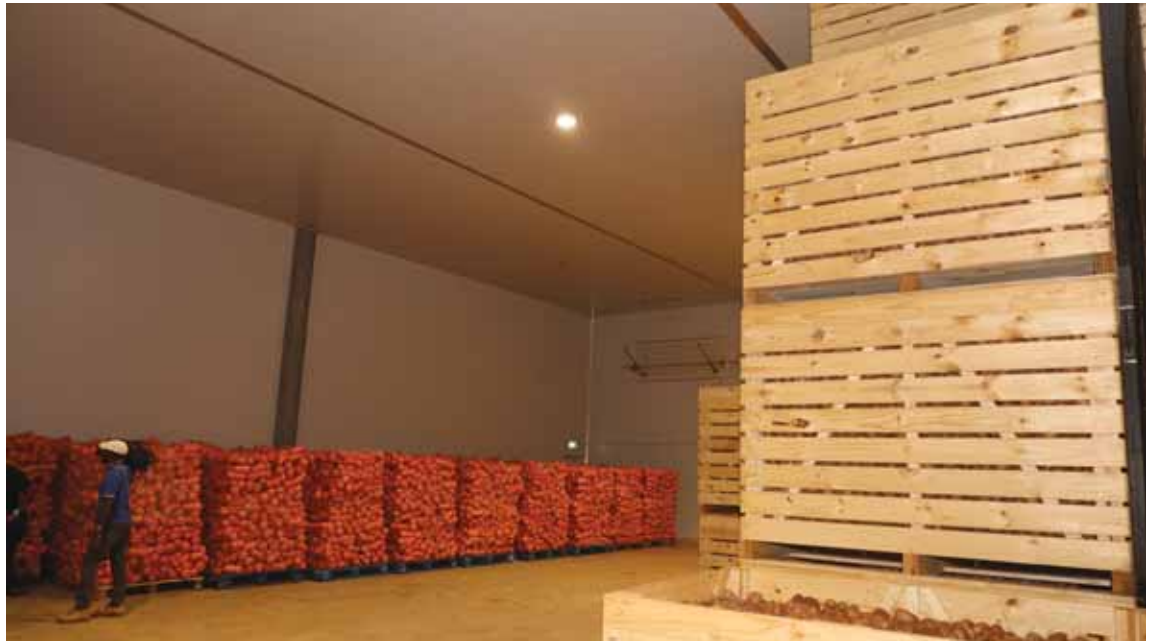
Mr Roos said the facility was not only equipped with highly sophisticated computer systems but also served to deter pests, rodents and potential theft thereby preventing losses and decay in vegetable produce.

The farms specialise in the production of premium-quality vegetables, catering for a variety