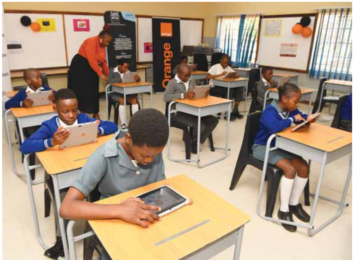
Mr Saleshando said improvement of internet connectivity was required for Botswana to successfully turn into a knowledge-based economy.

The budget proposal included P977 321 140 estimates for the recurrent budget and P1 728 445 447 estimates for the development budget. BOPA.