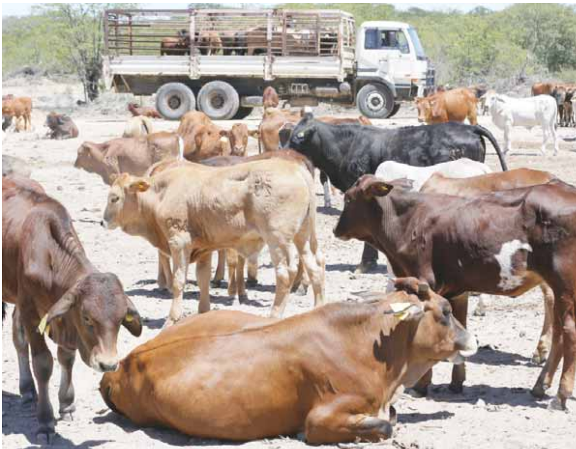
Mopalamete wa Tswapong North, Rre Prince Maele o kopile banni ba Manaledi go tsaya karolo mo moonong wa go oketsa palo ya dikgomo go tswa kwa go 1.7 million go ya kwa go 5 million.