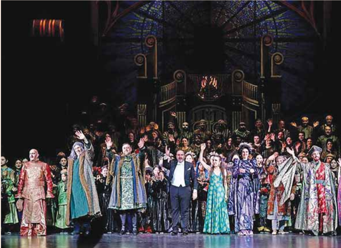
CHONGQING - The cast and crew of the opera Turandot acknowledging the audience after the performance at the Chongqing Grand Theatre in southwest China’s Chongqing on Saturday.