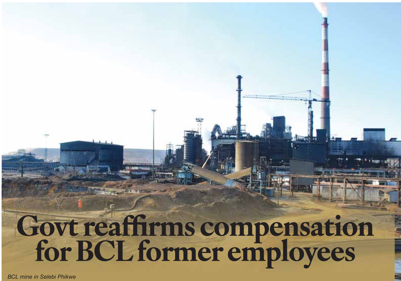
BCL mine in Selebi Phikwe