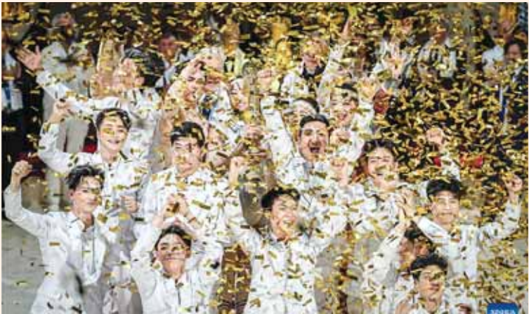
BUDAPEST - Members of the China National Acrobatic Troupe celebrating after winning the Grand Prix of the 16 th Budapest International Circus Festival in Budapest on Monday. Photo: Xinhua

gold prizes were awarded. Flying Tabares from Argentina and the United States won gold for flying trapeze, Ukrainian artist Kateryna Kornieva received gold for swing pole, while the Martinez Brothers of Colombia and Japan claimed gold for Icarian Games. Silver prizes were awarded to acts from Israel, the United Kingdom, Russia, and Italy. Bronze prizes went to performers from Italy, France and Switzerland, Russia, and Canada. Budapest International Circus Festival is widely regarded as one of the world’s most prestigious professional circus competitions. Xinhua