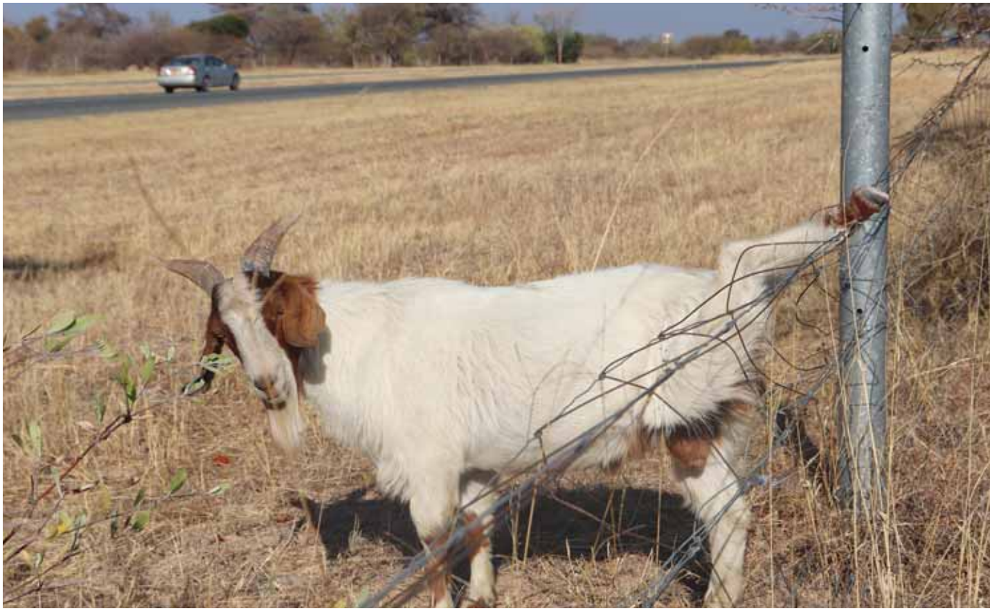
E re ka jaana phulo e simolotse go fokotsega kwa mafodisong, diruiwa di simolotse go iphataphatela mo teng ga tsela. Pudi e, e ne ya tlhoka lesego ya tshwarwa ke terata mme ba Lephata la Dikitsiso ba e falotsa.