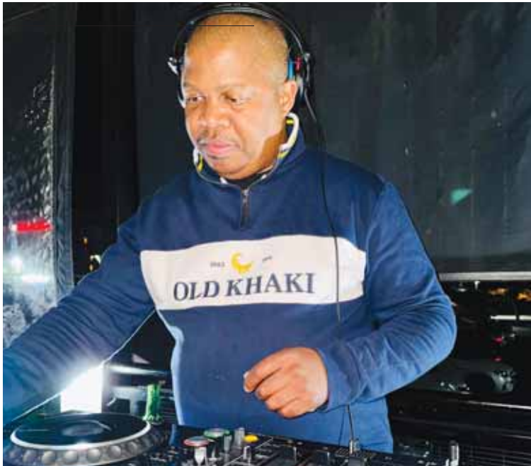
Ole said DJ Stomps had a vision for not only his business but also Botswana's creative space.