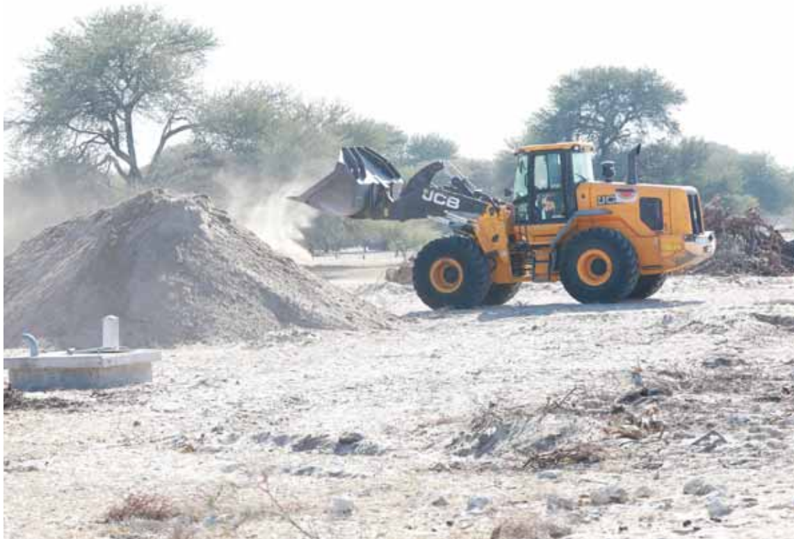
Minister of Transport and Public Works, Honourable Eric Molale said the ministry was scheduled to implement Project Governance Framework which defined processes and procedures for managing various aspects of projects, including Corporate Social Responsibility initiatives.

He further asked the minister, to provide a timeline or a plan as to when the missing data on end sums paid for those projects would be available and accessible, considering difficulties in retrieving information due to COVID-19 related office closures. BOPA