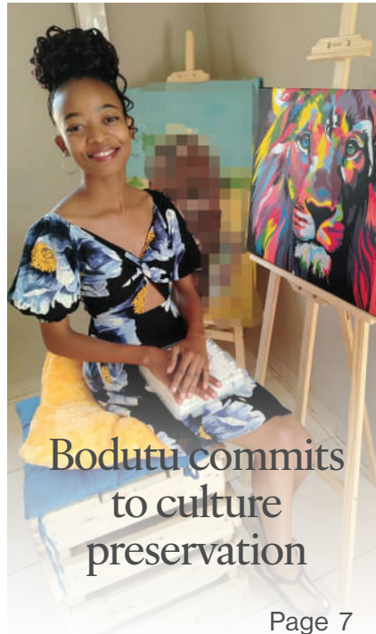
Bodutu commits to culture preservation