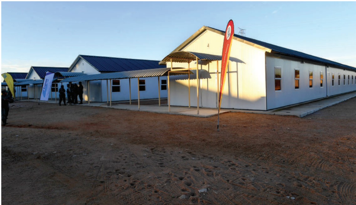
The newly constructed Special Support Group accommodation and ablutions blocks were officially opened by Minister for State President, Defence and Security, Mr Moeti Mohwasa in Gaborone on Monday. The project comprises four prefabricated accommodation blocks and two ablution facilities, which together are capable of accommodating 368 officers.

Mr Morolong also criticised the high number of executive public servants holding roles in an acting capacity, and highlighted that teachers were heavily congested within the C-Scale, with many performing extra duties without additional remuneration. BOPA