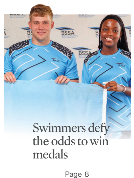
Swimmers defy the odds to win medals