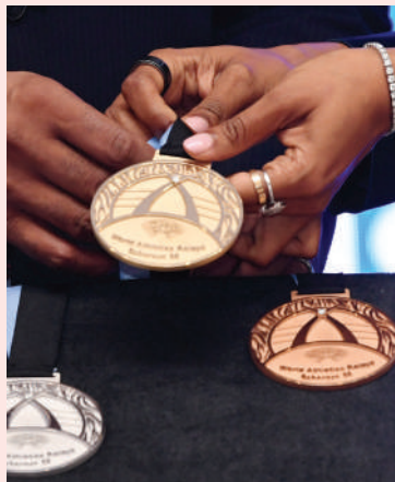
About 120 locally sourced natural diamonds were embedded into the medals awarded.

For decades, diamond revenues have underpinned Botswana's development, transforming