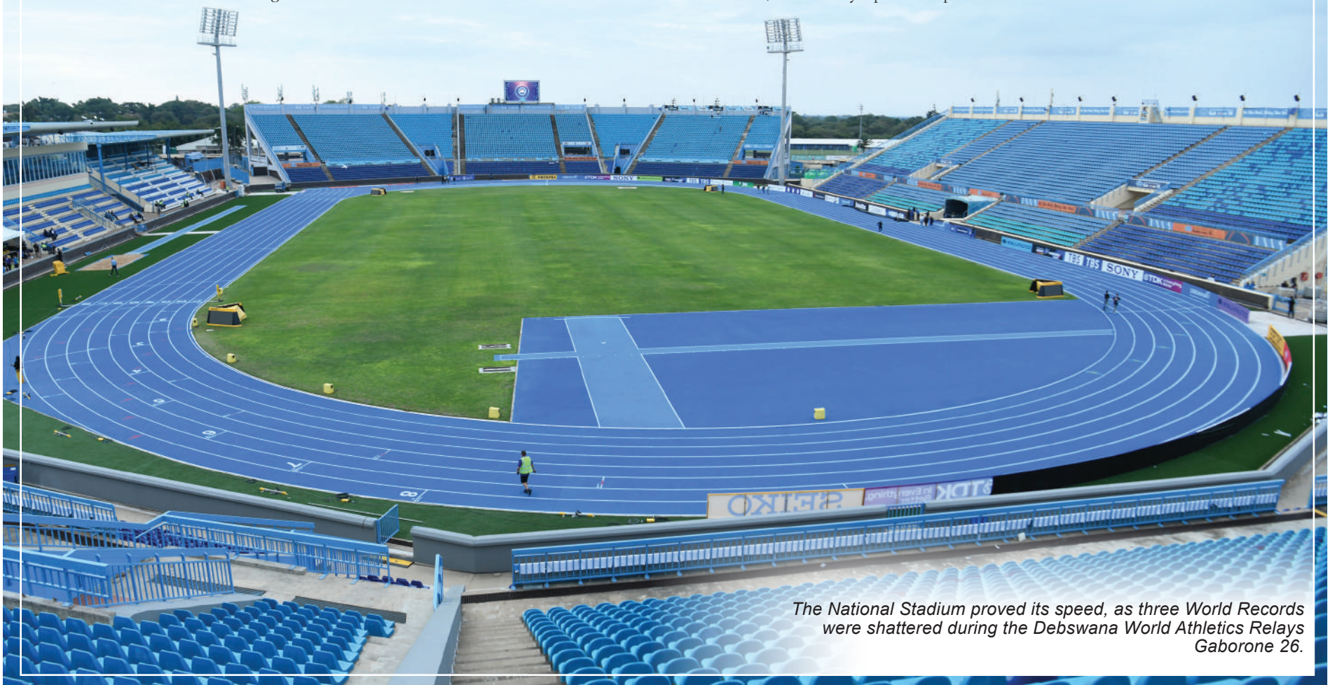
The National Stadium proved its speed, as three World Records were shattered during the Debswana World Athletics Relays Gaborone 26.

By hosting more events during qualification windows, Botswana can expect to attract top-tier international athletes who are willing to travel at their own expense for a chance to compete on one of the world's fastest surfaces. BOPA