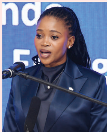
Minister of Minerals and Energy, Ms Bogolo Kenewendo.

livelihoods and driving national progress. However, declining global demand, increased competition from synthetic alternatives, and an oversupplied market have significantly impacted export earnings.