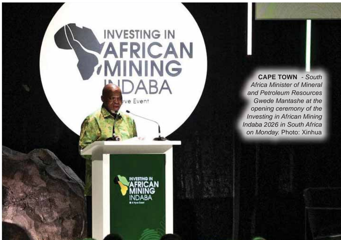
CAPE TOWN - South Africa Minister of Mineral and Petroleum Resources Gwede Mantashe at the opening ceremony of the Investing in African Mining Indaba 2026 in South Africa on Monday.