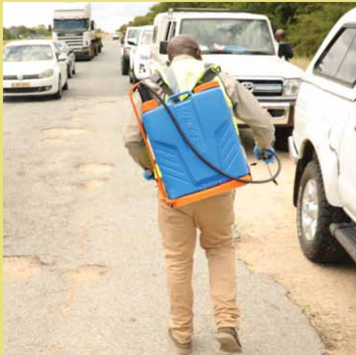
An officer fumigating vehicles before leaving Zone 6b at Bisoli Veterinary Gate. Bisoli gate is part of a broader system of 14 main veterinary disease control zones used by government to protect the beef markets since the outbreak of Foot & Mouth Disease at Jackalas No.1.

“ Society has collectively failed to mould such individuals, resulting in the Botswana Prison Service having to carry the burden of rehabilitating them into responsible citizens of the country - free from re-offending ”