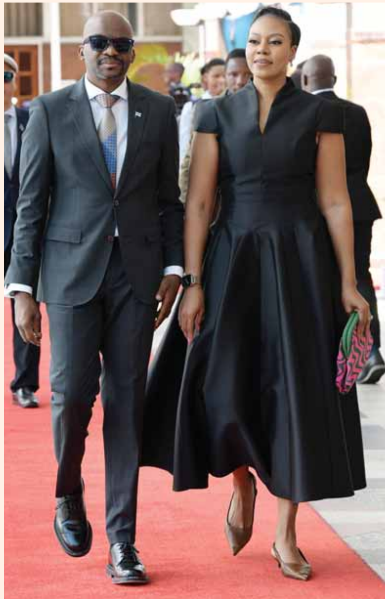
Speaker of the National Assembly, Mr Dithapelo Keorapetse (left) and wife, Katlego graced the red carpet with poise and sophistication, setting the tone for the occasion.

The 2026/27 Budget Speech was not just a political milestone, it was also a red carpet moment where style took centre stage. Legislators, executives and public figures showcased fashion elegance, blending classic tailoring with modern fashion sensibilities. From impeccably cut pinstripe suits to minimalist yet striking designs, the red carpet became a stage for personal expression, proving that even at formal state events, fashion speaks volumes.