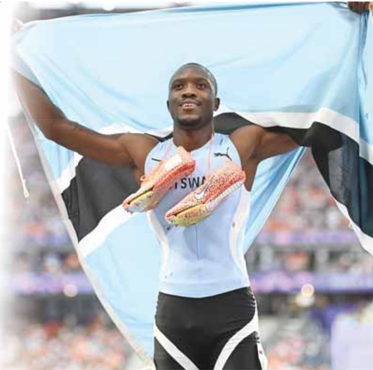
Botswana's sprint sensational Letsile Tebogo has received keys to a brand-new home in Kgale View in recognition of his historic 200m gold medal win at the Paris 2024 Olympic Games.

‘This is a promise made to the athletes that anyone who does exceptionally well and brings home a medal will be rewarded accordingly.’