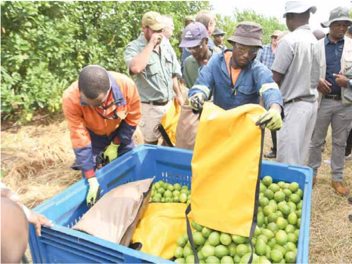
Minister of Labour and Home Affairs, Major General Pius Mokgware told Parliament that out of the 696 farm workers currently employed by Selebi Phikwe Citrus Project, 320 were Batswana engaged on permanent basis, while 110 were Batswana temporary workers. He cited lack of professional picking and packaging skills, which were not available in Botswana, as one of the reason for importing labour from other countries.