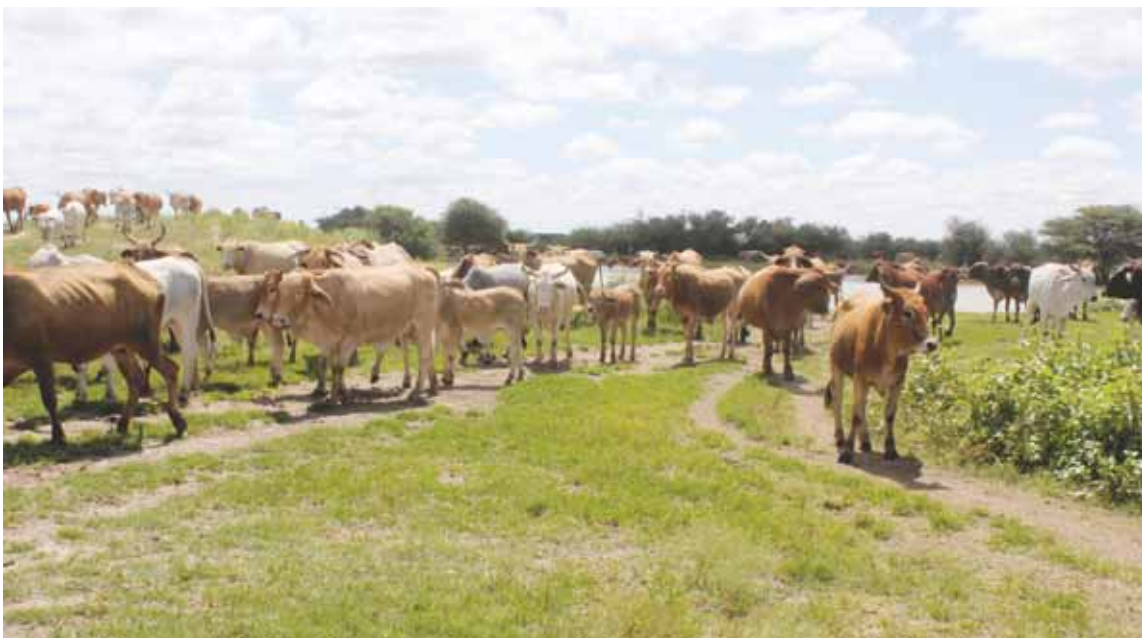
President Advocate Duma Boko said transformation of the cattle industry remained paramount through identifying and eliminating bottlenecks for continuous improvement. He said the country's herd had dwindled from three million to 1.1 million.