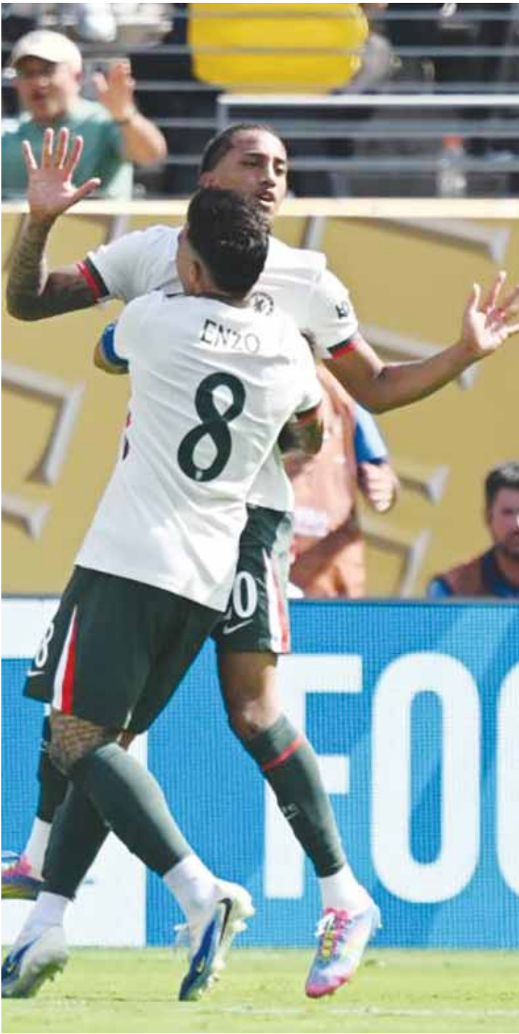
TRENTON - Joao Pedro (right) of Chelsea celebrating after scoring his first goal during the semi-final match against Fluminense FC at the FIFA Club World Cup 2025 at the MtLife Stadium, New Jersey, the United States on Tuesday. Pedro scored twice against his former club as Chelsea reached the final with a 2-0 win.