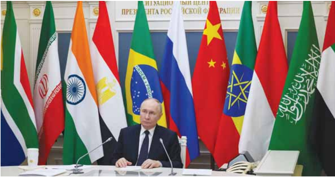
RIO DE JANEIRO - Russia president Vladimir Putin taking part in the main plenary session of the 17 th BRICS Summit in Brazil. During the session, dedicated to peace, security, and global governance reforms, participants discussed prospects of further cooperation between the BRICS states in politics, trade, the economy, culture and humanitarian affairs, as well as the international agenda. After the BRICS Summit, the final declaration, BRICS Leaders’ statement on the Global Governance of Artificial Intelligence and Leaders’ Framework Declaration on Climate Finance, was adopted.