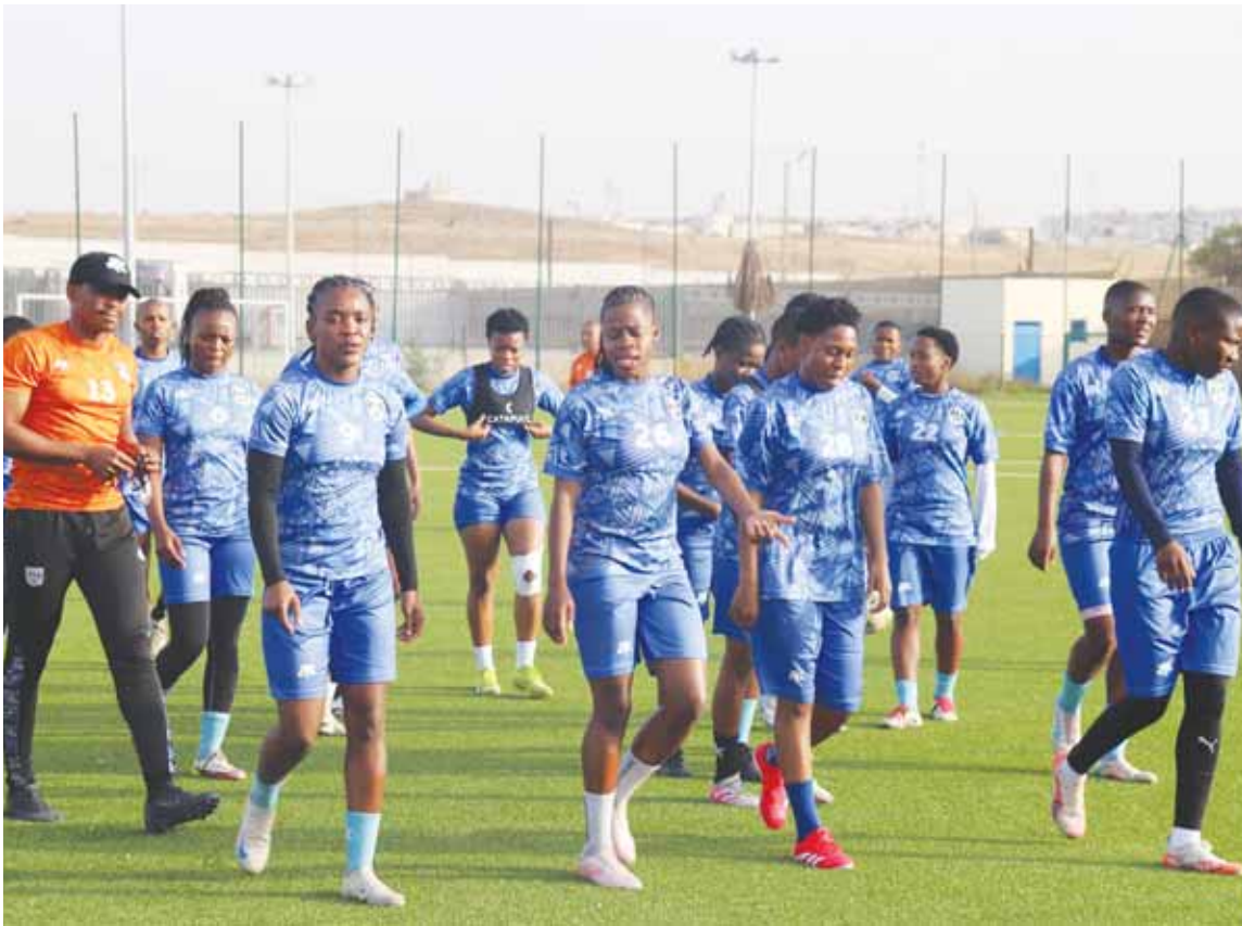
Setlhopha sa setshaba sa bomme sa kgwele ya dinao, The Mares, se itomile molomo wa tlase go dira ka natla mo motshamekong wa TotalEnergies CAF Women’s Africa Cup of Nations (WAFCON) kgatlhanong le Nigeria, bosigo jwa gompiano ka nako ya boferabongwe.