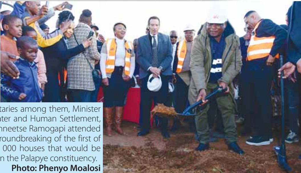
Dignitaries among them, Minister of Water and Human Settlement, Mr Onneetse Ramogapi attended the groundbreaking of the first of the 1 000 houses that would be built in the Palapye constituency.