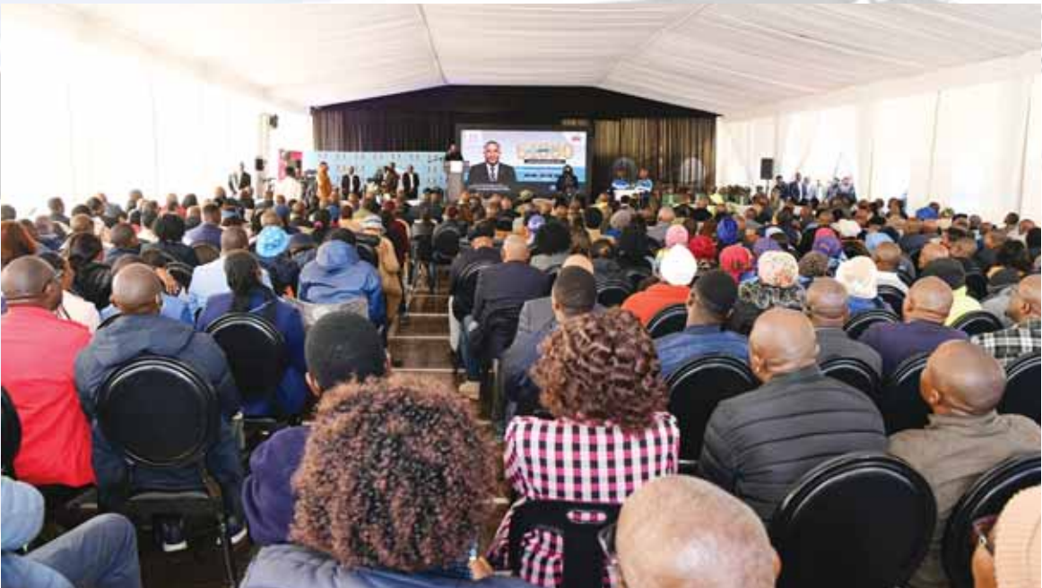
Palapye residents graced the launch.