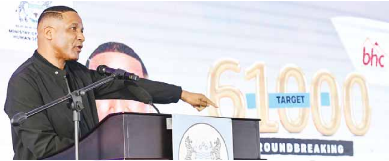
President Boko launching the housing programme in Palapye.

Botswana is making notable progress in aligning with the United Nations' recognition of adequate housing as a basic human right, focusing not only on shelter, but also on ensuring dignity and peace for its people. On Tuesday, President Advocate Duma Boko launched the 61 000 housing units programme that will see government deliver 1 000 houses in each of the 61 constituencies across the country over a period of two years. He said the Bonno National Housing Target 61 000 Programme, would help restore human dignity and help Botswana uphold the right to adequate housing as a fundamental right. President Boko said the project was designed to restore dignity and improve lives, while creating over 200 direct jobs, particularly targeting youth. The programme encompasses a variety of housing schemes, which include the Bonno Home Improvement Loan Scheme, Bonno Turnkey Development Loan Scheme and the Bonno D4 Scale and below or equivalent Housing Loan Scheme.