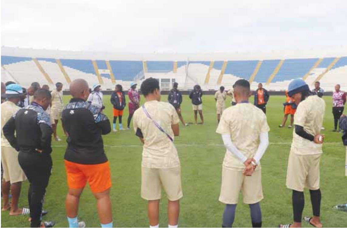
CASABLANCA - The Mares familiarising themselves with the Laarbi Zaouli pitch, where they will play against Nigeria today in a crucial TotalEnergies CAF Women's Africa Cup of Nations encounter.

As the host nation, Indonesia is continuing to refine all aspects of its preparations, including arena readiness, technical arrangements, budgeting, and training camps for the national team, Ita added. Xinhua