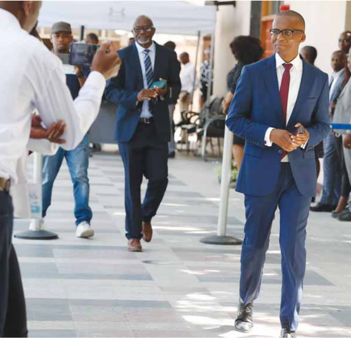
The Vice President and Minister of Finance, Mr Ndaba Gaolathe has said only 14 out of 45 reviewed State-Owned Enterprises are compliant with the King III Code of governance principles, which was adopted by the authority to fulfill compliance mandate.