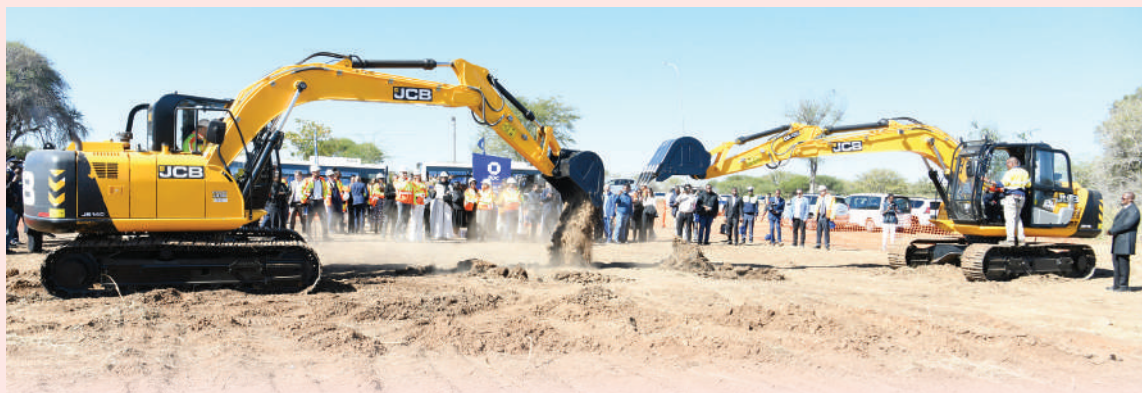
The groundbreaking of the multi-million Pula New Botswana City in Gaborone recently. The New Botswana City is a strategic economic platform designed to unlock economic growth and facilitate trade as well as attract direct foreign investment.

He noted that the onus was on all stakeholders to translate vision into delivery, partnership into progress and ambition into tangible economic outcomes. BOPA