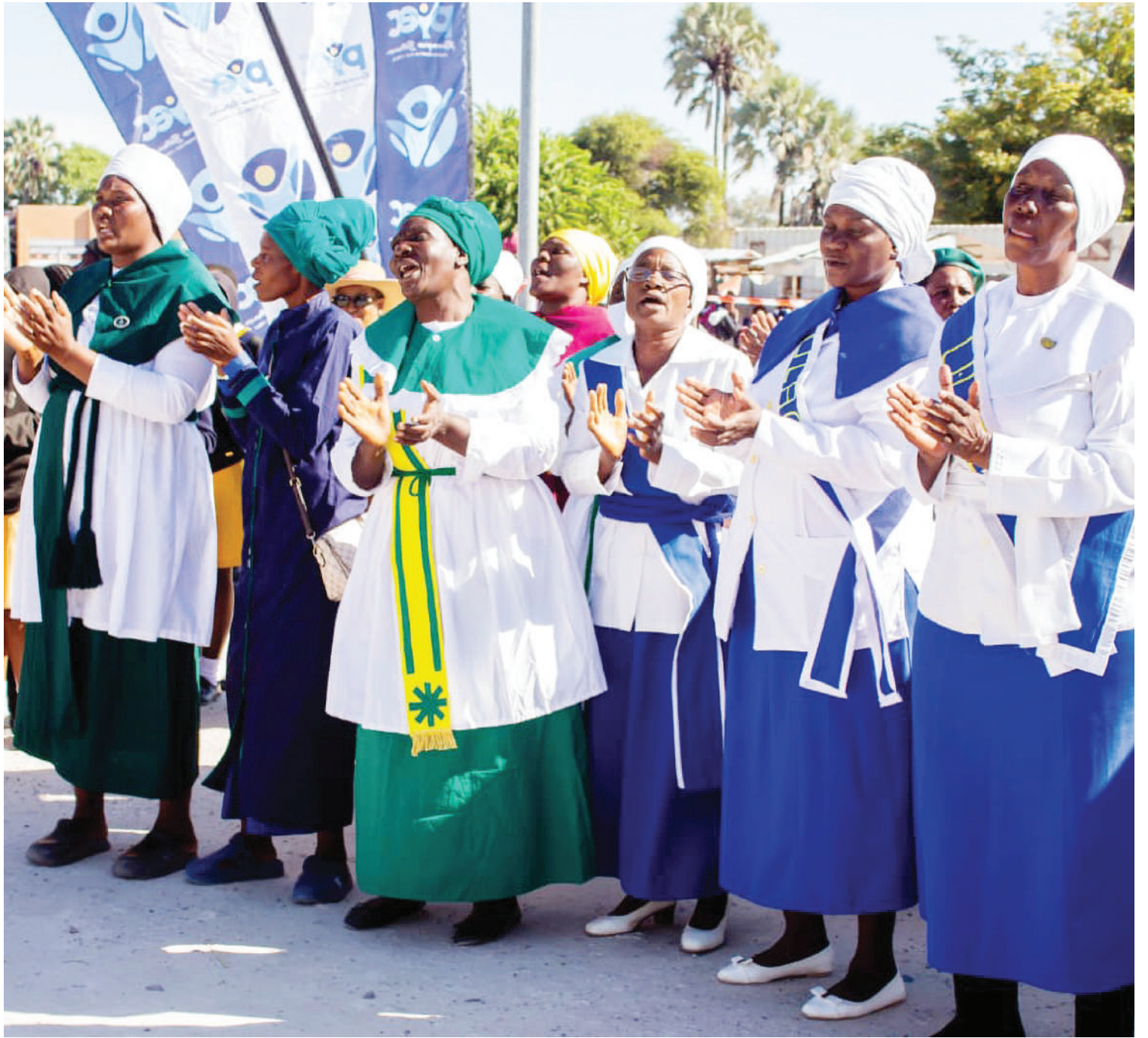
Bangwe ba maloko a dikereke ba ba neng ba le karolo ya letsatsi la merapelo kwa Gumare bosheng. Merapelo e ne e rulagantswe ka tshwaragano ke badiragatsi le lephata la metshameko le bodiragatsi kwa Gumare, maikaelelo e le go rapela kgatlhanong le borokutlhi.