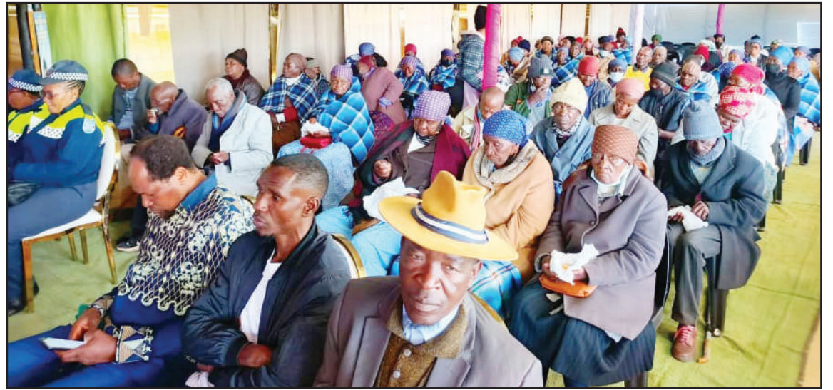
Jews Fest Tabernacles Church will host an event on Friday to celebrate and honour elders for their service to society and the guidance they continue to provide to younger generations.

"The Bible teaches us to honour our fathers and mothers and to care for one another. Through these initiatives, we seek to put those teachings into practice," he said. Previous luncheons have drawn dikgosi, Village Development