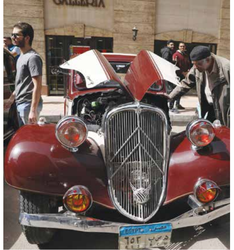
CAIRO - People visiting a vintage car exhibition in Egypt. Dozens of rare vintage automobiles rolled through downtown Cairo, turning historic streets into a living museum and offering a nostalgic tribute to the golden age of automotive design.

Trump on Saturday issued a 48-hour ultimatum demanding Iran reopen the Strait of Hormuz - a key route for global oil trade by April 6, a demand Iran’s military swiftly rejected. Xinhua