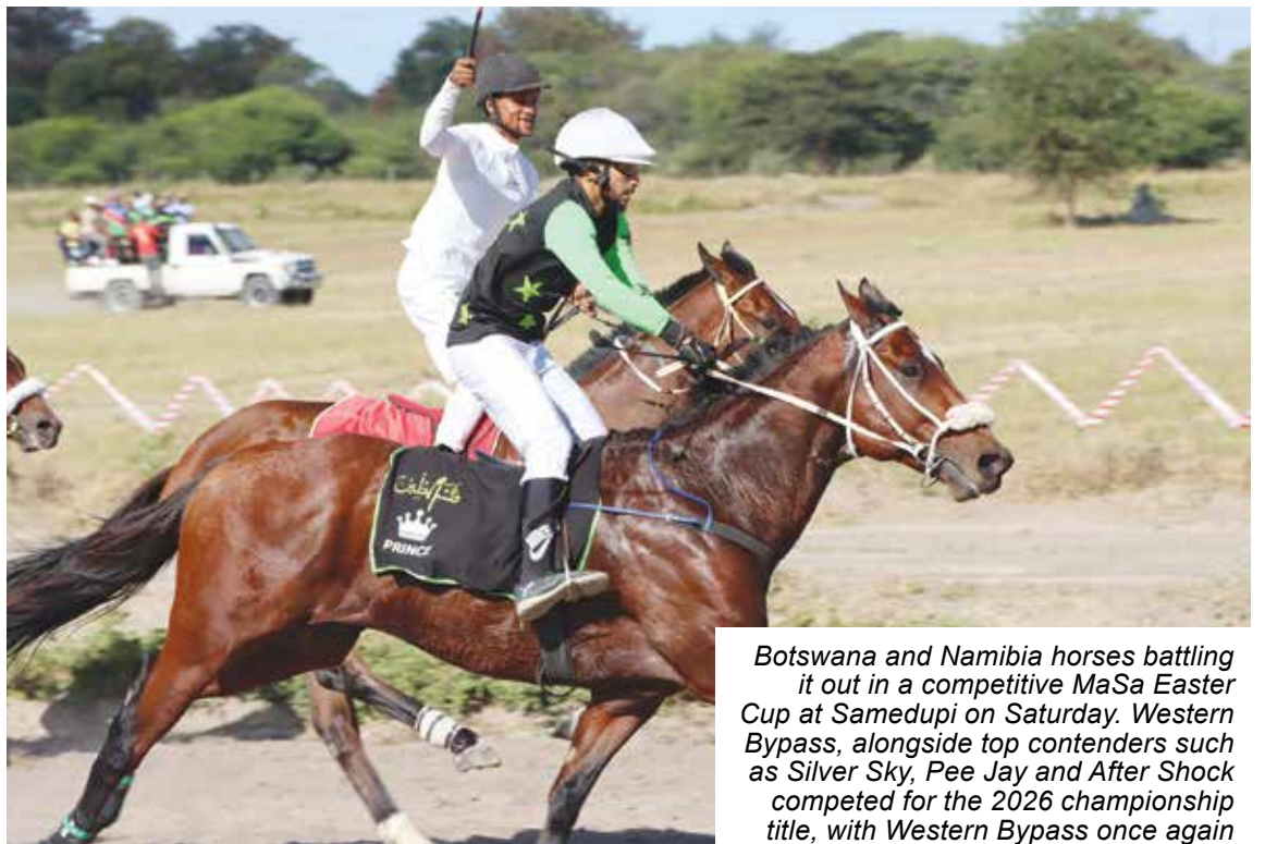
Botswana and Namibia horses battling it out in a competitive MaSa Easter Cup at Samedupi on Saturday. Western Bypass, alongside top contenders such as Silver Sky, Pee Jay and After Shock competed for the 2026 championship title, with Western Bypass once again emerging victorious to retain the crown.

In the 1 600 meters thoroughbred, Whisper from Namibia clinched first price, cashing P10,000 while local horses After Shock and Silver continued their impressive form taking position two and three worth P8,000 and P6,000 in that order. BOPA