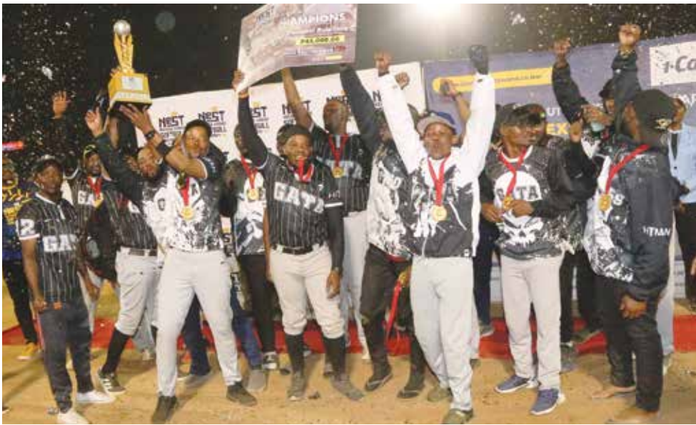
Gatalamotho Softball Club men are the National Easter Softball Tournament champions after defeating Wells International 15-6 in the finals at National Diamond Ground in Gaborone on Sunday. Gatalamotho won gold medals, a trophy and P45,000 while Wells took silver medals and P30,000.