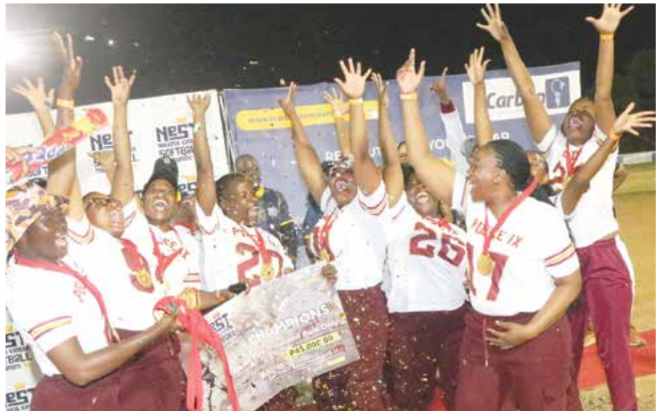
Police IX women celebrating after emerging champions of the National Easter Softball Tournament finals in Gaborone on Sunday. They defeated Titans 3-2 to claim gold medals, a trophy and P45,000, while Titans finished second, taking silver medals and P30,000.