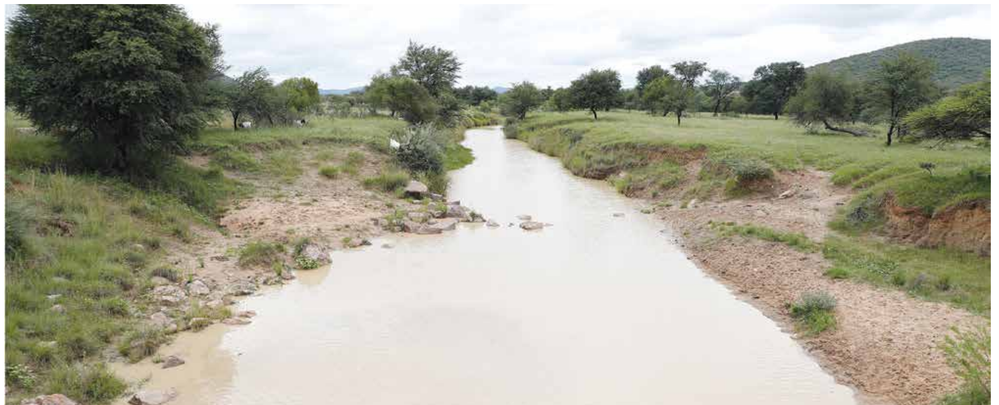
The village is built along the river, hence the name Molapowabojang.