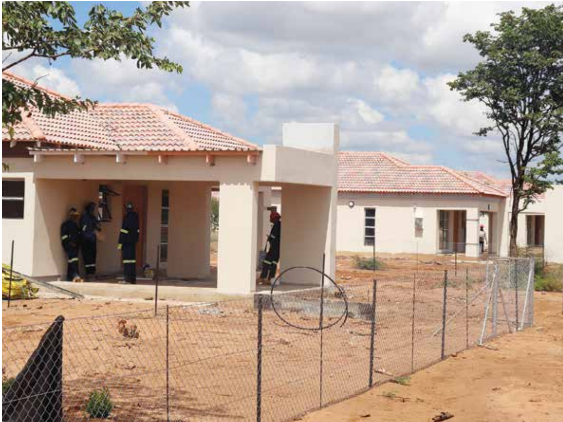
Minister of Water and Human Settlement, Mr Onneetse Ramogapi has informed Parliament that 31 projects had been budgeted for under various components of the Bonno National Housing Programme in the Ngami Constituency.