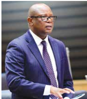
Minister of Environment and Tourism Mr Wynter Mmolotsi

"These works will be rolled out in a phased approach across other protected areas," he added. On why infrastructure remained severely dilapidated despite consistent levy collections, Mr Mmolotsi bemoaned delays in project execution and weak