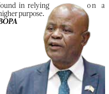
Minister of Labour and Home Affairs Major General Pius Mokgware

His message resonated deeply, reminding everyone of the power of faith and the comfort that can be found in relying on a higher purpose. BOPA