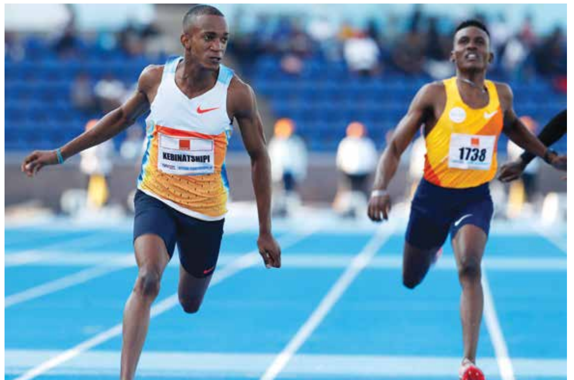
The 400 metres world champion, Collen Kebinatshipi produced a World Lead of 9.89 seconds in 100 metres.