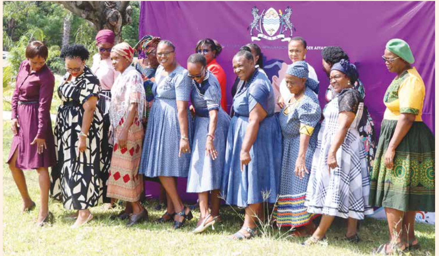
Women during a dress-up campaign organised by the Department of Gender Affairs in Maun recently. The initiative celebrates how fashion serves as a form of self-expression, strength and empowerment in women's daily lives.

“Women must walk with their heads held high, not just in how they look, but in how they stand up for their children.”