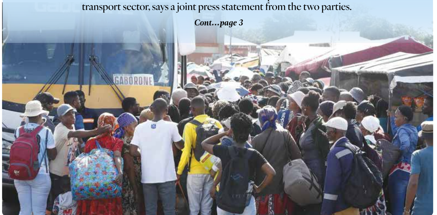
Commuters at Gaborone Bus Rank leaving for their respective destinations on Thursday. The Ministry of Transport and Infrastructure and Botswana Transport Association have expressed gratitude to the public for their patience and continued support as ongoing engagements between the two continue, aimed at improving service delivery and sustainability in the transport sector for the benefit of both operators and the travelling public.