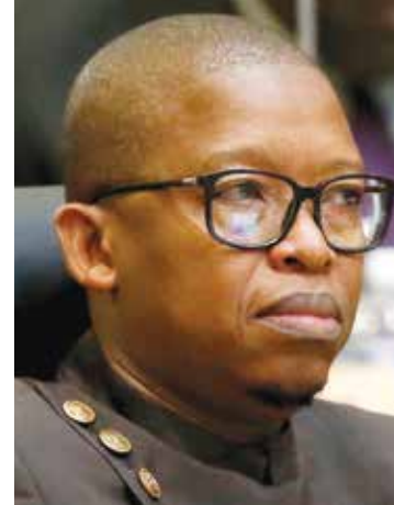
Minister of Trade and Entrepreneurship Mr Tiroeaone Ntsima