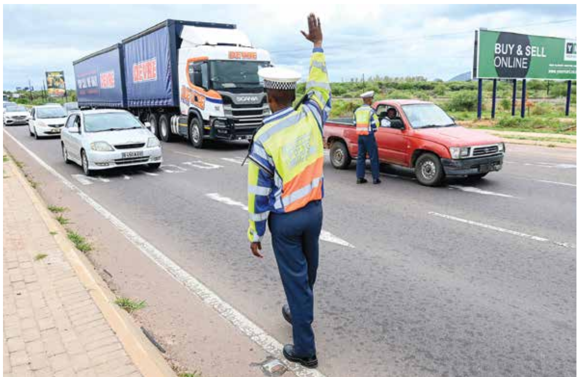
President Advocate Duma Boko revealed during his Easter Holiday address to the nation that government had taken the decision to grant a seven-day grace period for the use of vehicles with expired licences and permits, citing delays and long queues caused by challenges within the Department of Road Transport Services system.

Furthermore, President Boko encouraged motorists to drive safely over the Easter Holidays, and advised that the police, DRTS transport inspectorate officers and other government stakeholders would collaborate to ensure orderly travel, urging the public to cooperate with on duty offer officials. BOPA