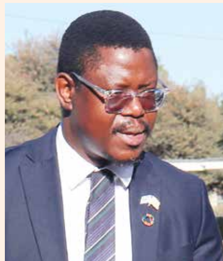
Minister of Local Government and Traditional Affairs Kethlalefile Motshegwa

"Your numbers are mouthwatering to any insurer... run this insurance with openness and diligence," said Lucas. BOPA