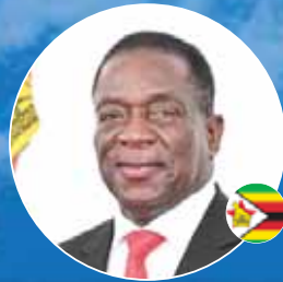
H.E. Emmerson Mnangagwa President of The Republic Of Zimbabwe