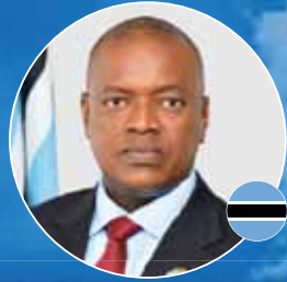
H.E. Dr. Mokgweetsi E.K Masisi President Of The Republic Of Botswana