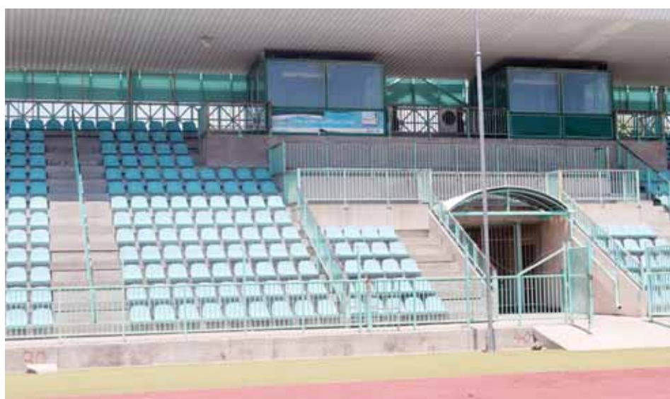
BNSC officials have expressed concern about the poor state of Maun Sports Complex. They said the dilapidated facility needed attention.

The festival attracted children from Maun and surrounding villages to engage in disciplines such as athletics, basketball, chess, judo, karate, netball and tennis.