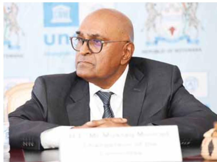
Moorad said he hoped hosting 18.COM would benefit the local community, as delegates from across the world engaged on various tourism activities and appreciated the living heritage element of the Seperu folk dance.

But, he said he hoped 18.COM would inspire communities to come forward and increase the national inventory so that 'we apply and be evaluated for listing.' BOPA