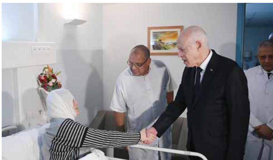
TUNIS - Tunisia President Kais Saied (R, Front) visits a Palestinian patient at a hospital in, Tunisia, on Sunday. Saied said that all the injured Palestinians admitted to Tunisian hospitals will receive necessary treatment and return in good health to their homeland, according to the Tunisian presidency.

Titled How Factory Farming Emissions Are Worsening Climate Disasters in the Global South, the WAP report stated that attaining net-zero targets could be a mirage unless demand for animal-based protein dips significantly. "Factory farming is contributing at least 11 percent to global greenhouse gas emissions, escalating climate disasters like heatwaves, cyclones, droughts and flooding." Xinhua