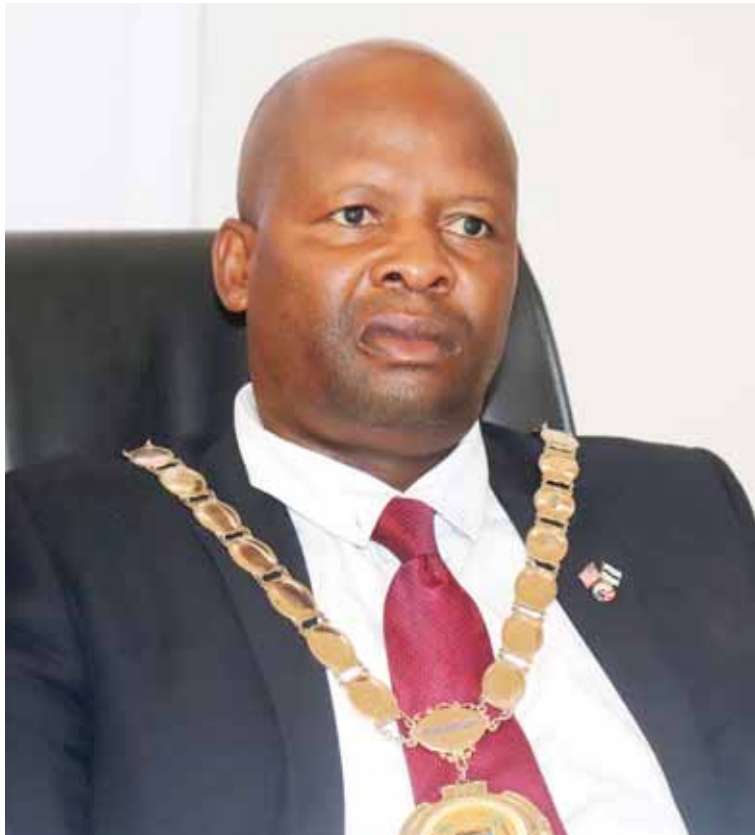
Mr Jacob told the Kweneng District full council meeting on Monday that projects to be implemented under the Development Management Model, included construction of three new primary schools in Molepolole and Kopong, construction of 25km internal roads in Molepolole, construction of Molepolole bypass road and construction of a clinic in Kopong.