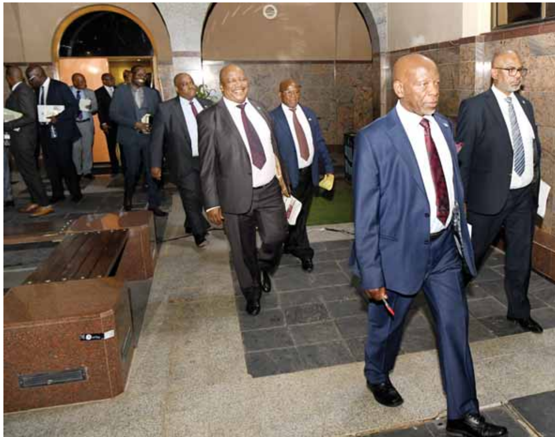
Legislators leaving the National Assembly after a session. Parliament on Monday passed three bills; Bail Bill, the Criminal Procedures and Evidence (Amendment) Bill, as well as the Anti-Human Trafficking Bill.

prone to engage people as slaves and sex workers hence the need to keep an open eye. He proposed that the maximum charge or jail term must remain open to even include life imprisonment. BOPA