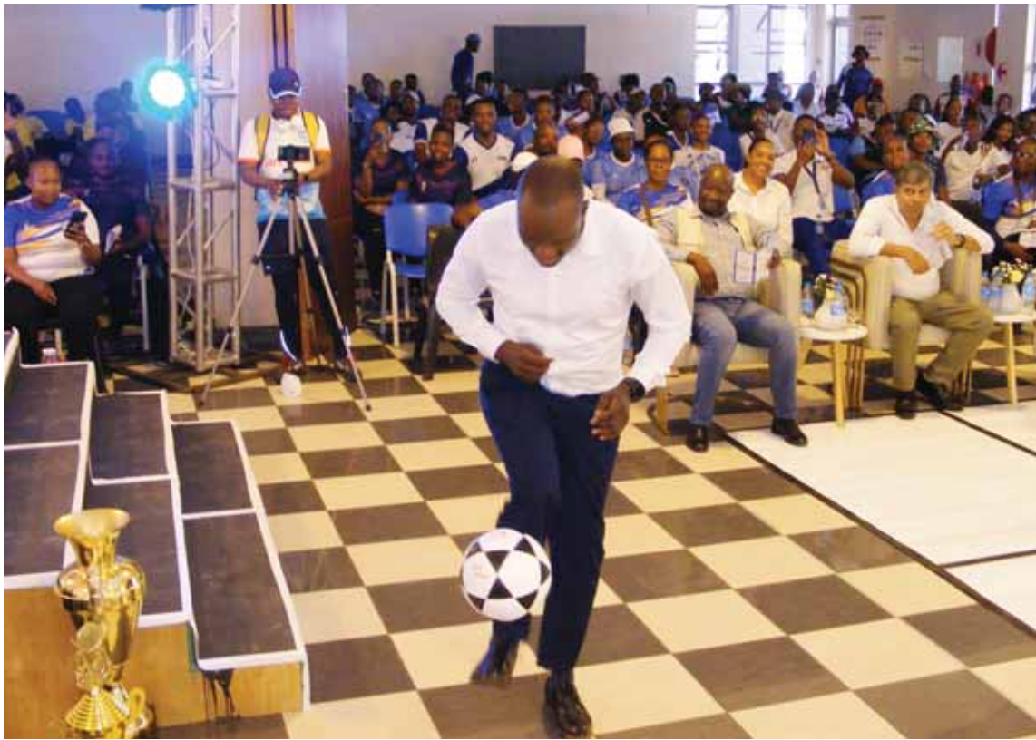
Dr Mogalakwe during the 2023 Ministry of Health national inter-health games official opening in Francistown yesterday. He said health workers were not immune from health risks, therefore they needed to take care of themselves.