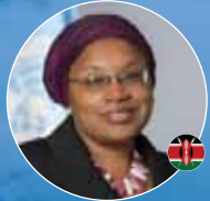
Alice Nderitu Under-Secretary-General-Special Adviser On The Prevention Of Genocide, United Nations