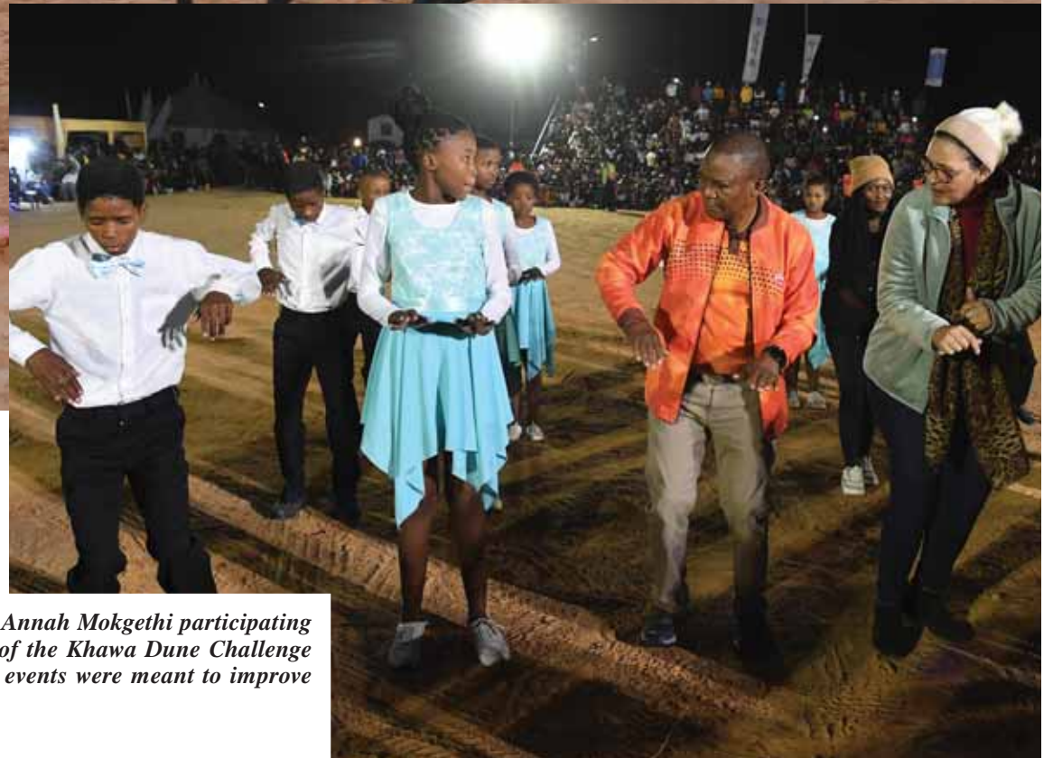
Tsogwane (second right) and Minister of Labour and Home Affairs, Annah Mokgethi participating in Polka dance with Khawa Primary School pupils at the opening of the Khawa Dune Challenge and Cultural Festival on Saturday. The Acting President said such events were meant to improve livelihoods.