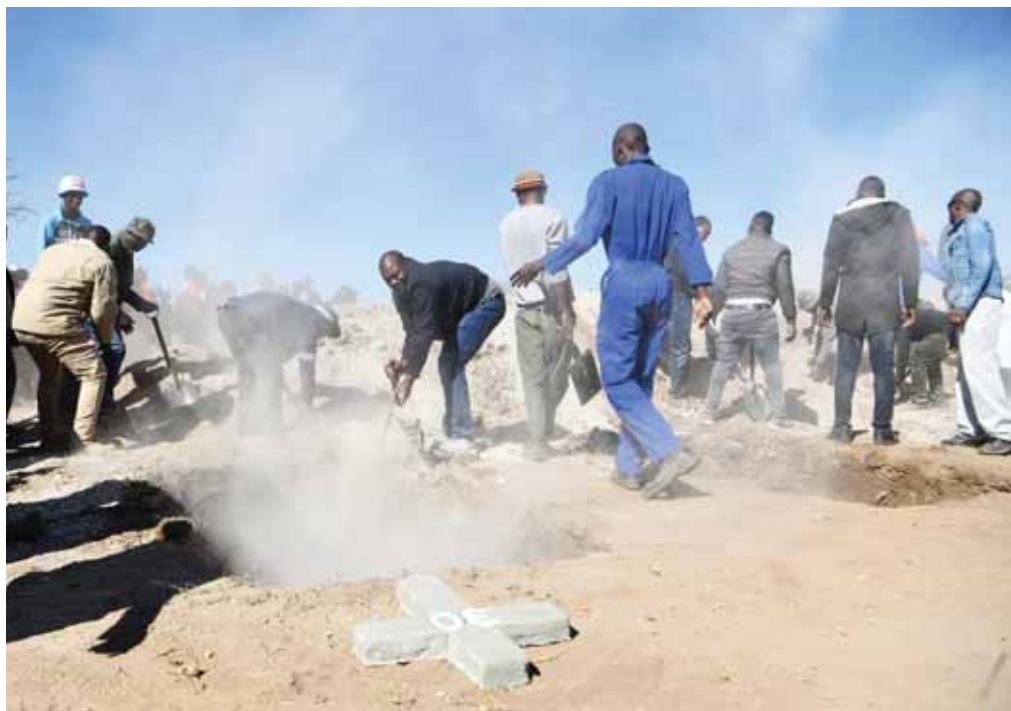
Members of the community bidding farewell to the 44 victims at Garanta cemetery.