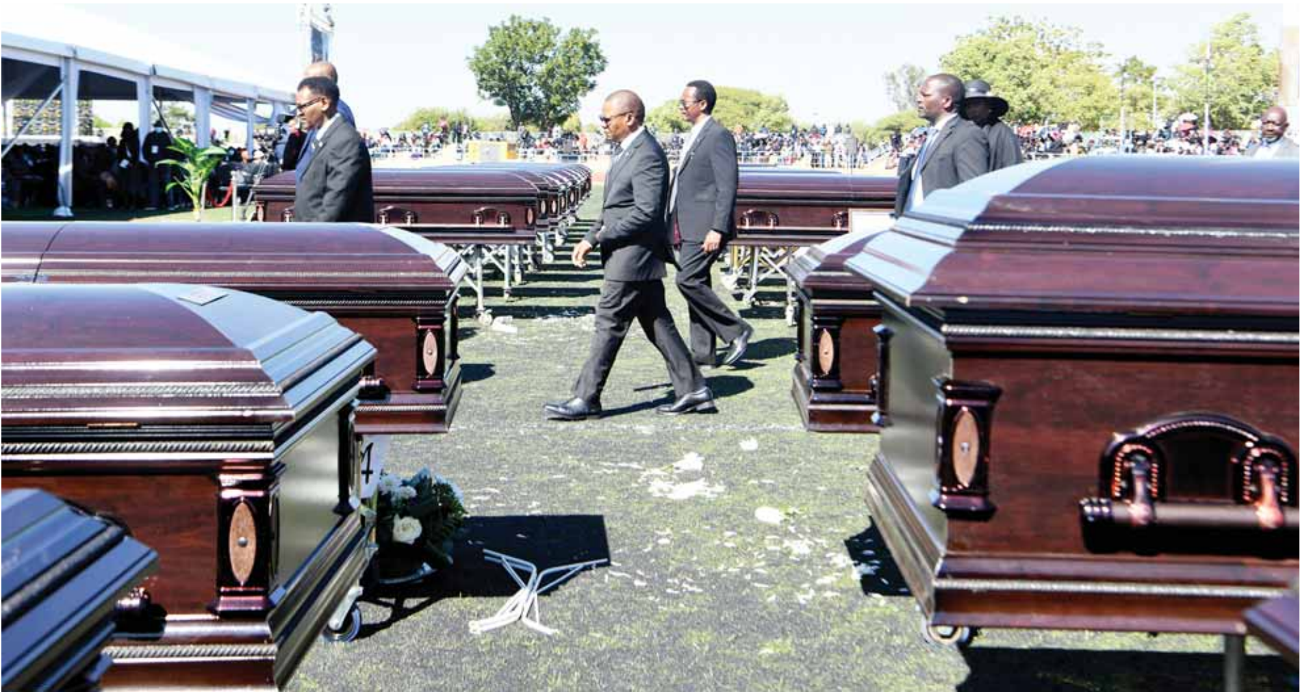
Acting President Slumber Tsogwane (centre) after delivering a message of condolences during a mass funeral service of the 45 victims of Mamatlakala Bridge bus accident at Molepolole Sports Complex on Saturday. He urged the nation to remain united in order to face future challenges together. He thanked the bereaved families for their patience, as due to the nature of the accident, it took long for the bodies to be repatriated for burial and he also called upon them to take solace in the Word of God, saying since the matter had been brought to finality, it was now time for the families to start the healing process. Forty-four of the victims were buried at Garanta cemetery in Molepolole, while the other was laid to rest in Thamaga.