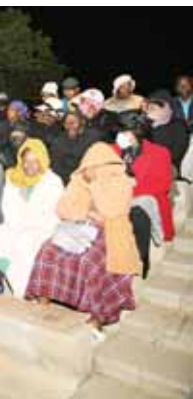
and bid farewell to