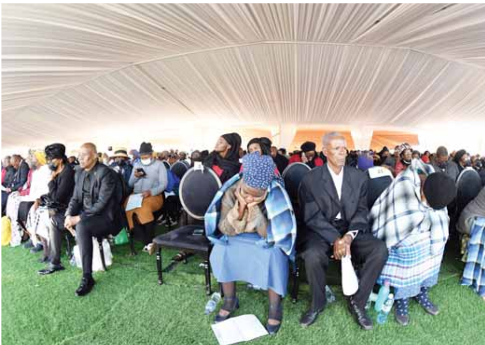
Members of the bereaved families.