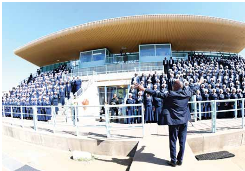
St Engenas ZCC choir.