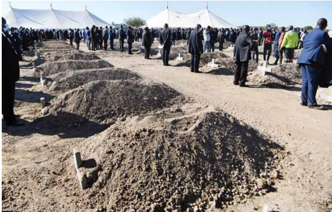
Grave site of the 44 victims of Mamatlakala bridge bus accident that were buried at Garanta cemetery in Molepolole on Saturday.

Forty-four members of the St Engenas ZCC, who died tragically at Mmamatlakala on their way to Moria, South Africa for the Easter holidays, were buried at Garanta ward in Molepolole while one, the bus driver, was buried in his home village of Thamaga on Saturday. BOPA