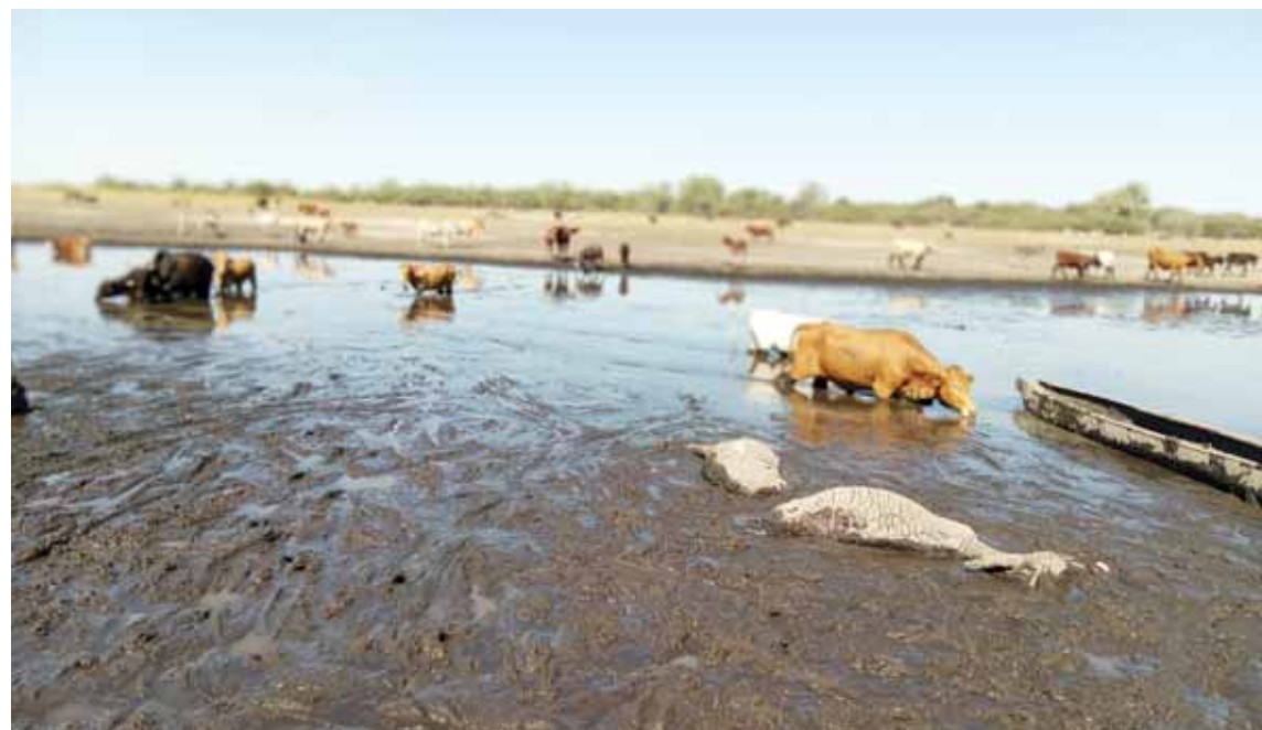
Chanoga water channel, which forms part of Boteti River has dried up leaving some wild animals, livestock and the farming community in limbo.

"As leadership we have been running around to lure the private sector to come on board and save the animals and some business owners have agreed to supply farmers with water from their boreholes," he added. BOPA