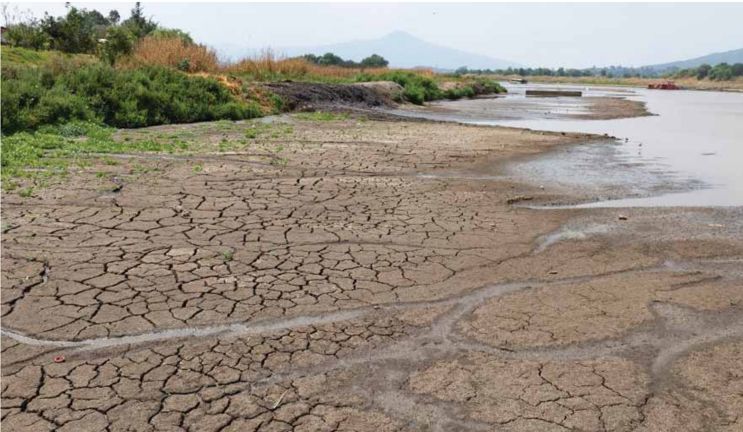
MICHOACAN - Partially dried-up lake bed of Patzcuaro Lake, a traditional fishing place and tourist resort in Mexico recently. Drought has hit several regions in Mexico due to rising temperature and lack of rainfall.