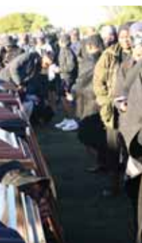
rs of the victims as