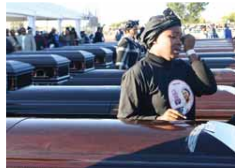
A difficult moment for some family members as they bid them farewell.