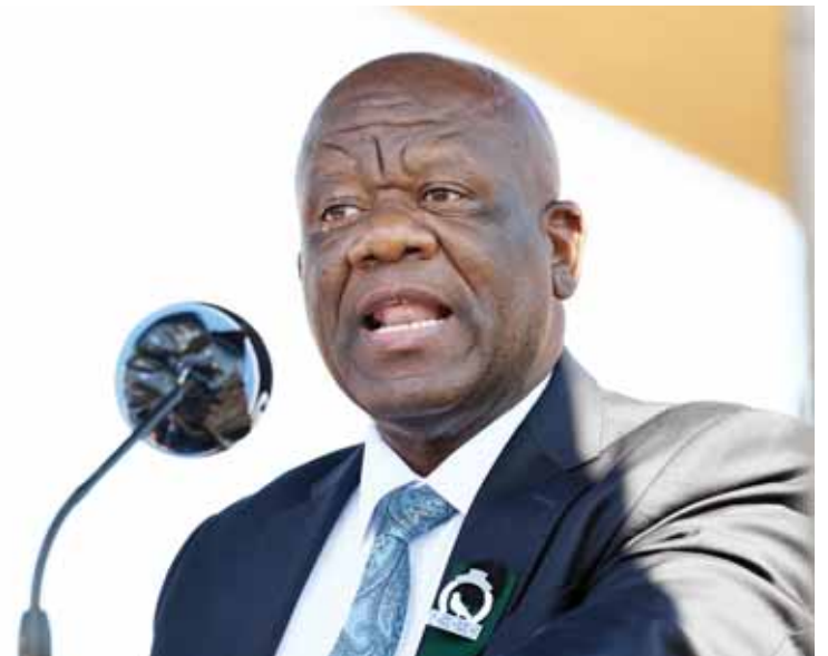
Minister Manthata delivering a message of condolences from the church headquarters. He encouraged the bereaved families to look up to God for comfort.