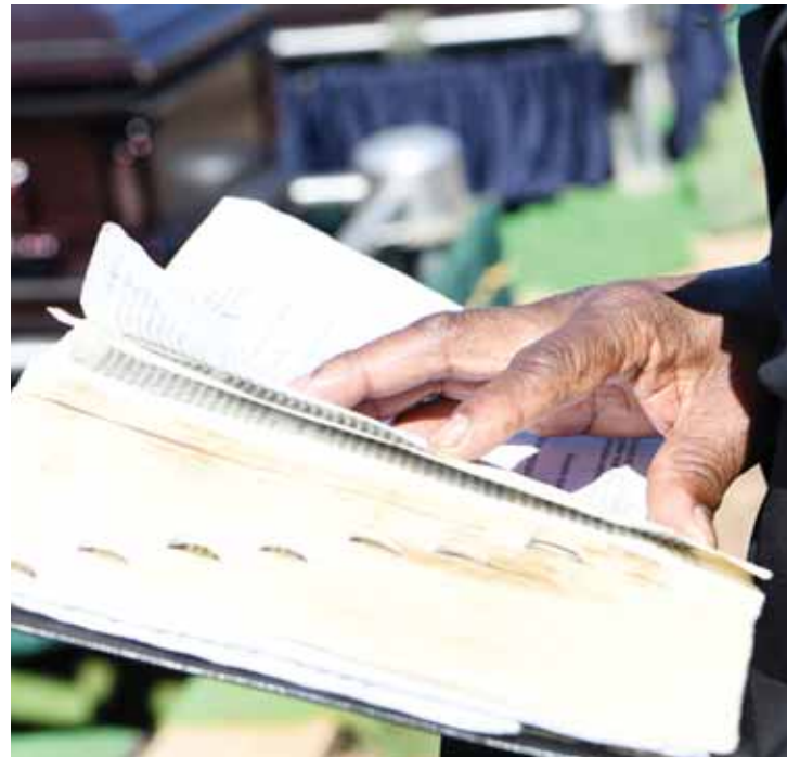
Psalm 34:18 says "The Lord is close to the brokenhearted and saves those who are crushed in spirit".