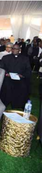
and Minister of ong the guests