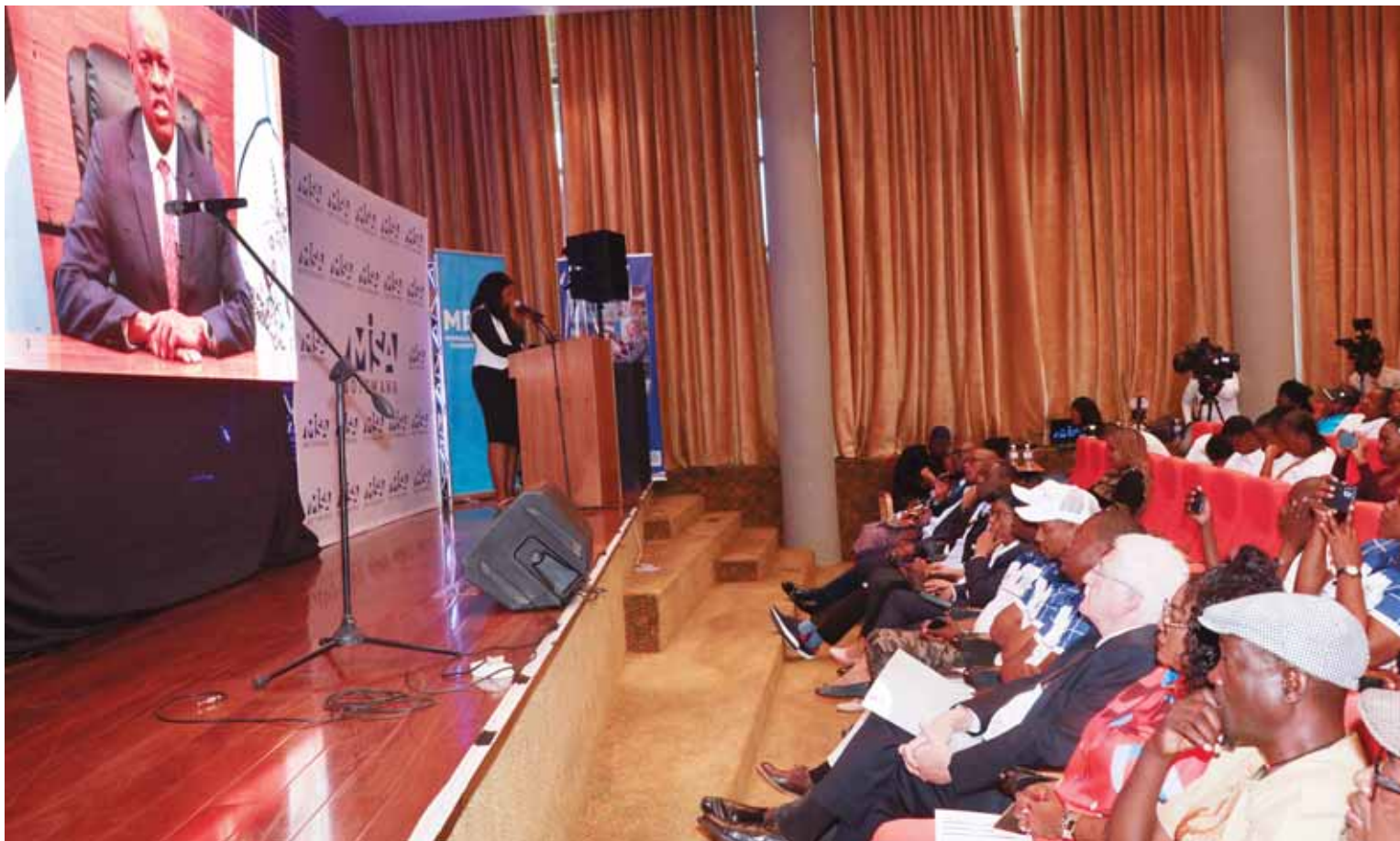
President Masisi addressing the media virtually on World Press Freedom Day on Saturday. He said the day compelled the African media to leverage on its influence to raise awareness and reshape narratives about the continent to foster collective efforts toward environmental conservation and sustainability.

"In that breadth, SADC has put in place environment and climate change programmes that seek to facilitate implementation of the Regional Indicative Strategic Development Plan, Africa Agenda 2063 and SDGs," he said. BOPA