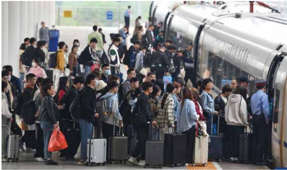
FUYANG - Passengers lining up to board a train at Fuyang West Railway Station, east of China's Anhui Province yesterday. China witnessed an increase of passenger trips on the last day of the five-day May Day holiday.