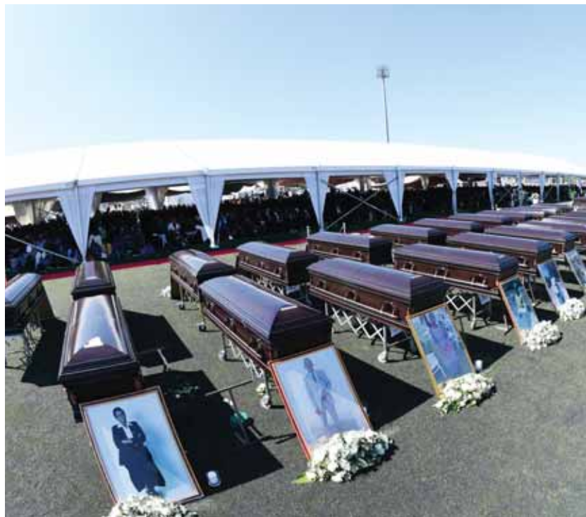
The 45 coffins with the remains of the victims lying-in-state during funeral proceedings.