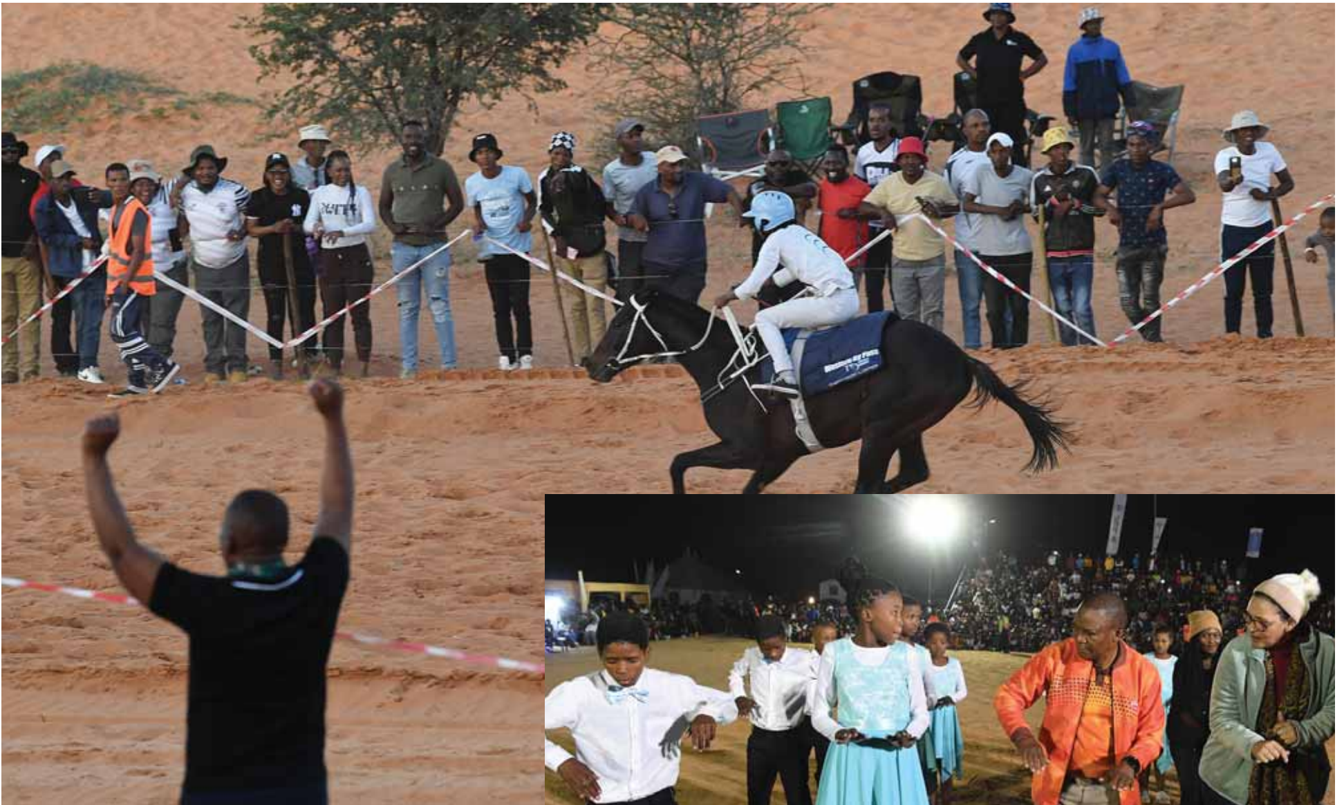
Western ByPass from Motokwe won the 2400m grand prize during Khawa Horse Race on Saturday.