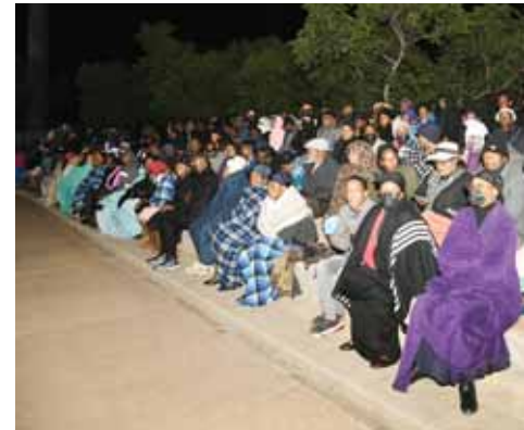
Batswana braved the cold weather to come and bid farewell to their fellow countrymen.