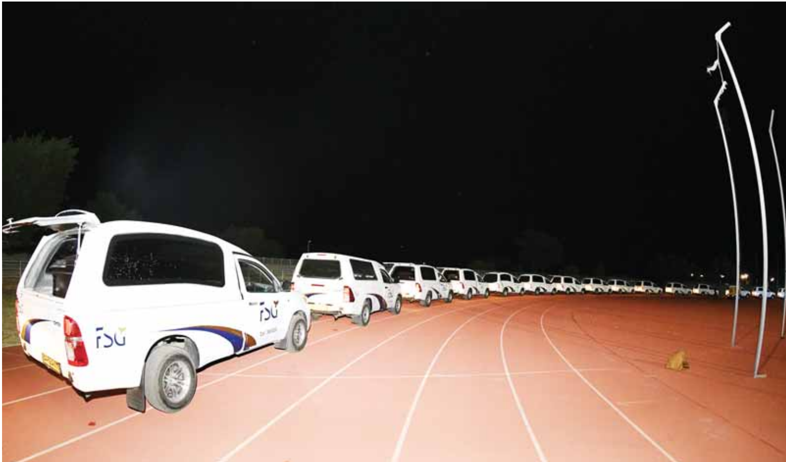
Forty-five FSG hearses arriving at Molepolole sport complex.