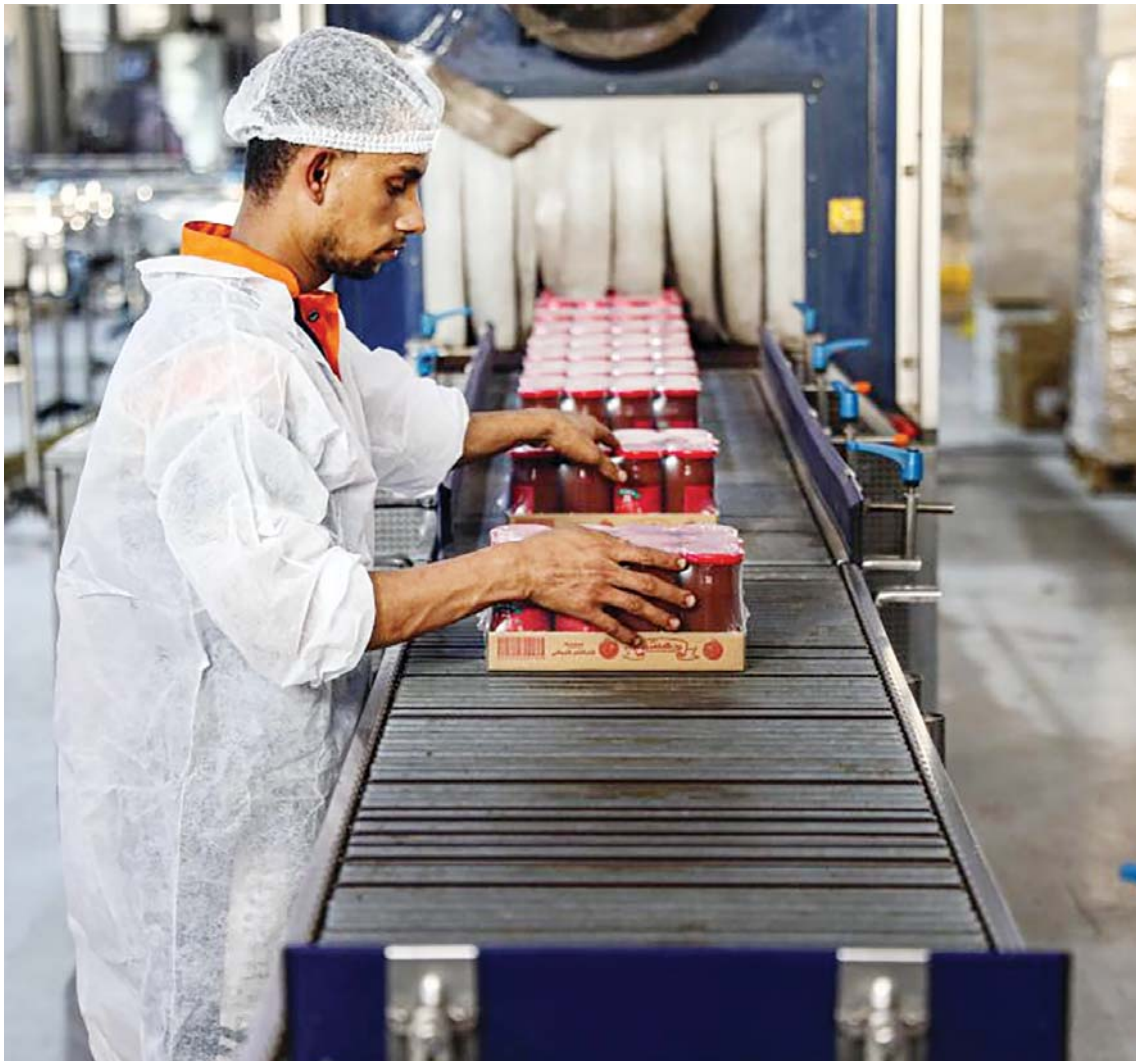
CAIRO - Workers move packed tomato paste at a production line of the Egyptian Swiss Group company in Sharqia Governorate, Egypt recently. Egyptian President Abdel-Fattah al-Sisi met on Sunday with Managing Director of the International Monetary Fund Kristalina Georgieva, where they discussed the country’s economic reform programme amid the ongoing regional crises.