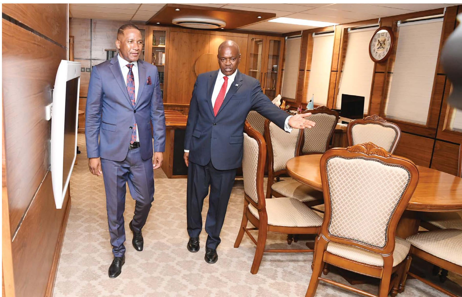
President Advocate Duma Boko (left) and former president Dr Mokgweetsi Masisi during the handover of government and its instruments at Office of the President yesterday. Dr Masisi called on accounting officers to accord Advocate Boko the respect and support he deserved.