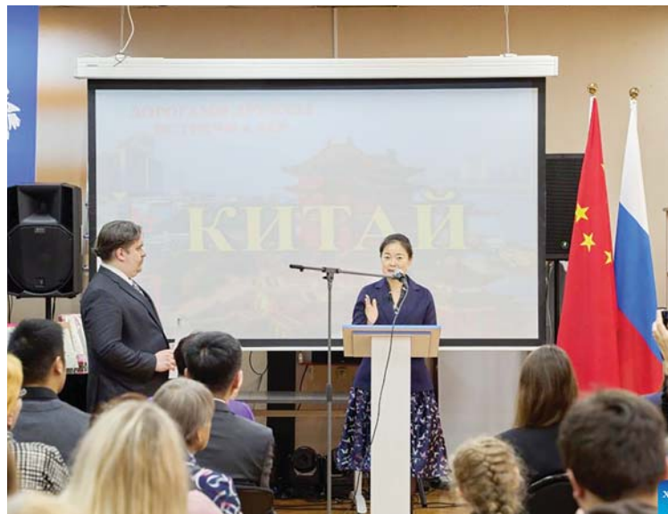
VLADIVOSTOK - An event promoting traditional Chinese culture was held in Vladivostok, Russia on Saturday, drawing over 100 participants, including culture enthusiasts, students, and local residents.

The event was co-hosted by the Chinese Consulate General in Vladivostok, the Representative Office of the Russian Ministry of Foreign Affairs in Vladivostok, the Gorky Public Library of Primorsky Krai, and the Confucius Institute at Far Eastern Federal University. Xinhua