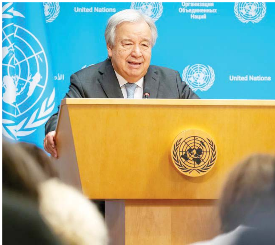
NEW YORK - In his message to mark World Cities Day, UN Secretary-General Antonio Guterres has highlighted the role of young people in driving climate action and shaping urban futures and further called for their empowerment to accelerate global sustainable development progress.

The UN General Assembly later designated October 31 as World Cities Day to raise awareness of the imperative to make cities more sustainable, accessible, and livable. Xinhua