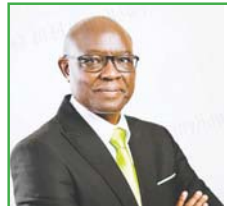
NAME: Dr Kesitgile Gobotswang PARTY: BCP CONSTITUENCY: Tswapong South NUMBER OF VOTES: 5 998