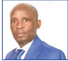
NAME: Prince Maele PARTY: UDC CONSTITUENCY: TSWAPONG NORTH NUMBER OF VOTES: 7 433