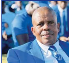
NAME: Prince Mosanana PARTY: UDC CONSTITUENCY: Kanye East NUMBER OF VOTES: 10 833