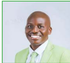
NAME: Tlhabologo Furniture PARTY: BCP CONSTITUENCY: Tati East NUMBER OF VOTES: 4 490