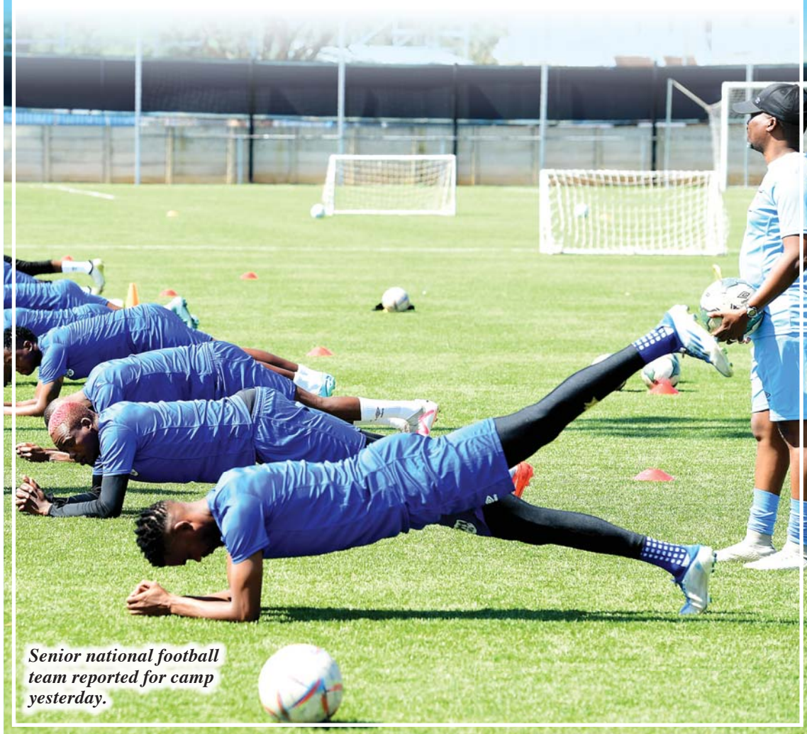
Senior national football team reported for camp yesterday.

The coach said the most important thing is to have a team that will be able to stand the pressure that their opponents will try to bring, and have the energy and the ability to make sure that they attack.