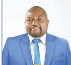
NAME: Dr Pheny Butale PARTY: UDC CONSTITUENCY: GABORONE CENTRAL NUMBER OF VOTES: 5 493