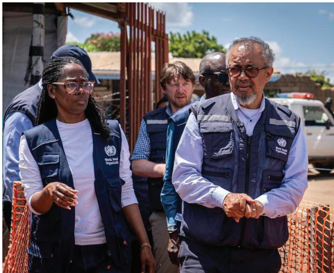
KINSHASA - World Health Organization Director-General Tedros Adhanom Ghebreyesus (left) during a visit to Bunia, the capital of Ituri Province in northeastern Democratic Republic of the Congo (DRC) on Sunday. The DRC health ministry said 263 confirmed cases had been reported in the country as of May 29, including 42 deaths.

A further 24 058 bottles of unregistered cough syrup valued at ZiG3 608 700, together with khat and other unregistered medicines, were confiscated. The total estimated value of all substances recovered during the period amounted to ZiG79 931 130. New Ziana