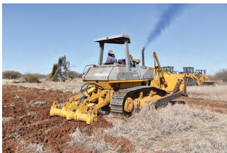
Clearing machinery in Leshibitse clusters. The area cultivated in Leshibitse increased from 329 ha in 2020/21 to 400 ha in 2021/22.

Botswana has been selected to host the SADC Regional Animal Resources Conservation Gene bank to support diversification in agricultural production, marketing and management.