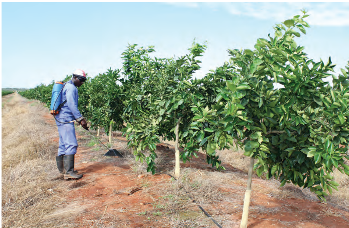
The Selebi Phikwe Citrus Project initiative is seen as one of the efforts to diversify the country's agro industry and generate value chain business opportunities.

The project is seen as one of the efforts to diversify the country's agro industry, with spin off effects that would generate value chain business opportunities such as fruit drying, trucking and fresh produce. The project is also expected to invigorate the citrus production landscape of the country and contribute to economic growth. The first harvest from the project that started in November 2021 in a 1 500-hectare farm, is expected in 2024. Over 600 000 tree seedlings of citrus fruits were planted at different intervals. They include grapefruits, lemons, Valencia oranges as well as few cultivars and mandarins.