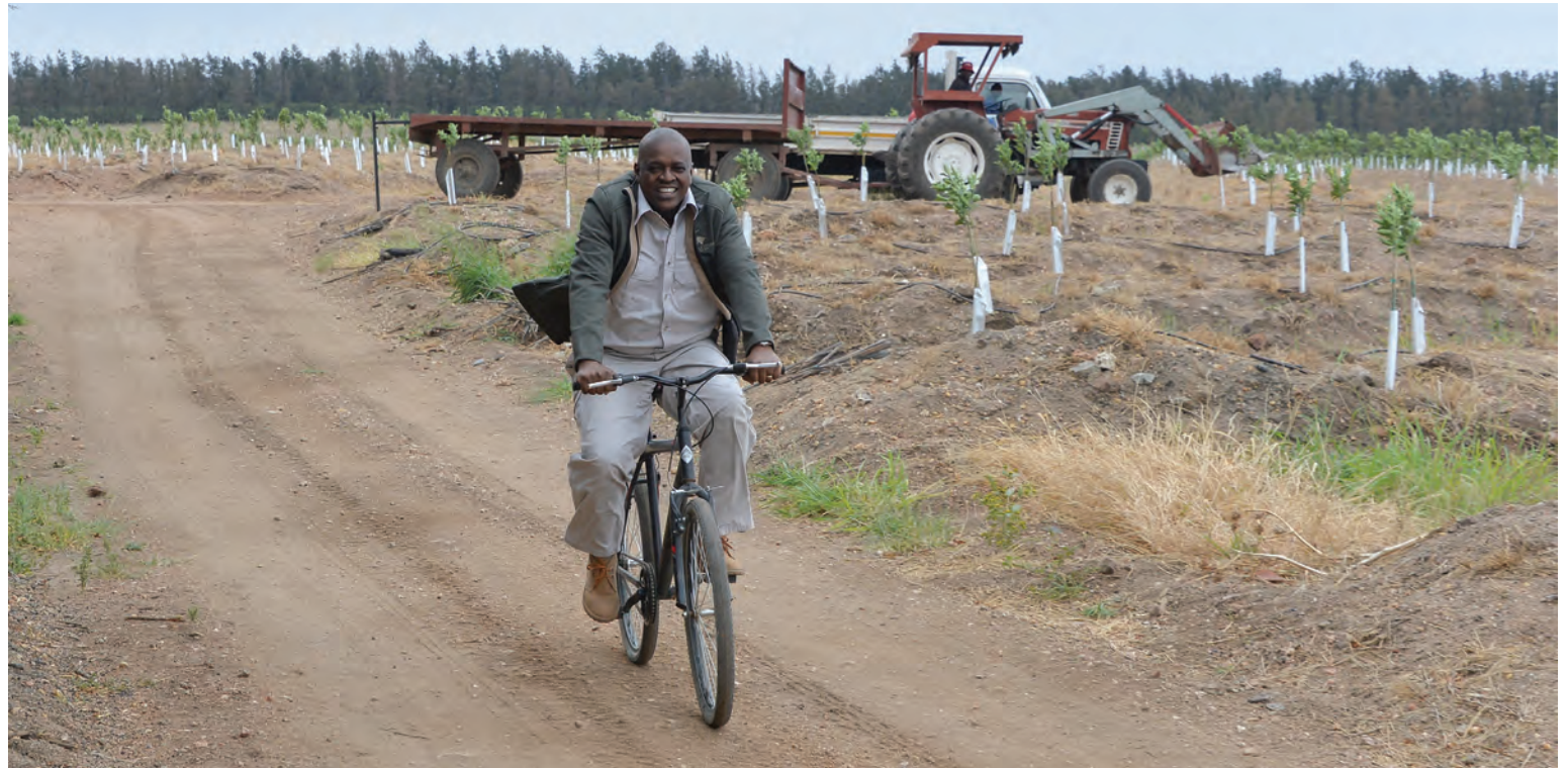
PASSION AND DETERMINATION... President Masisi riding a bicycle during his visit to BlydeVallei farms in South Africa.

The development has also seen government, through the Ministry of Agriculture's Integrated Support Programme for Arable Agriculture Development (ISPAAD) introduce the Horticulture Impact Accelerator Subsidy (IAS) fund to assist farmers increase production levels of horticultural products. The subsidy is also geared towards provision of production structures, inputs and promotion of protected cultivation as well as use of green technology in farms, in addition to employment creation.