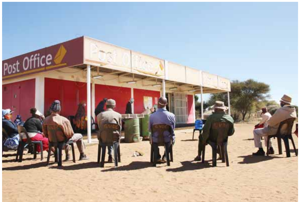
Mr Modukanele said it was critical to subsidise utilities for old age pensioners when delivering the old age pension programme, however, it would only be done when funds permitted.

Mr Motsamai had wanted to know if government would realise the need to benchmark with Namibia and extend the water and electricity subsidy to old age pensioners. BOPA