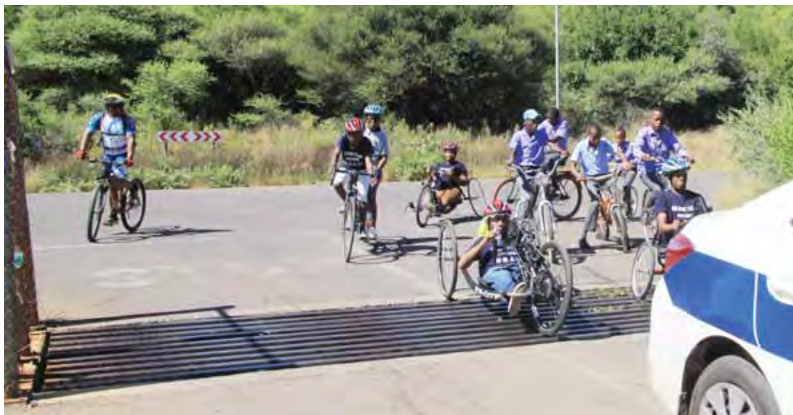
Inclusive Cycling International, together with Lobatse Cycling Club and Botswana Council of the Disabled, in an awareness campaign in Lobatse recently. Louis called on stakeholders to include disabled cyclists in activities.