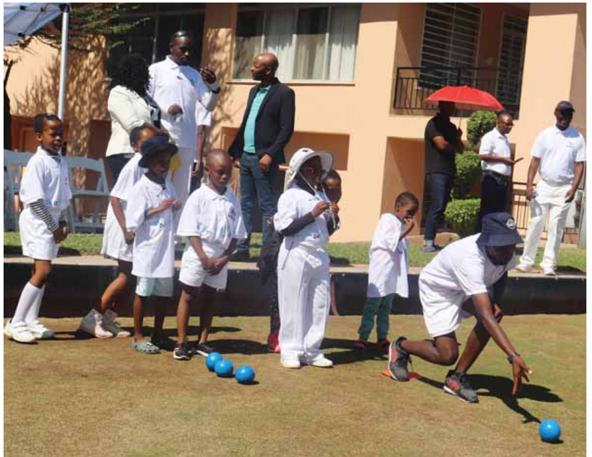
Pupils during a bowling demonstration exercise following launch of the Re Ba Bona Ha Bowling Centre in Jwaneng on Saturday.

"Starting from grassroots development guarantees continuity," she said. BOPA