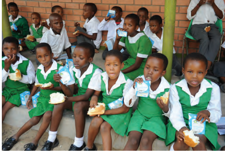
Government intends to review the primary school feeding programme to improve child nutrition. It would thus purchase local and indigenous food.

The implementation of this initiative is being done in two phases with phase 1 involving