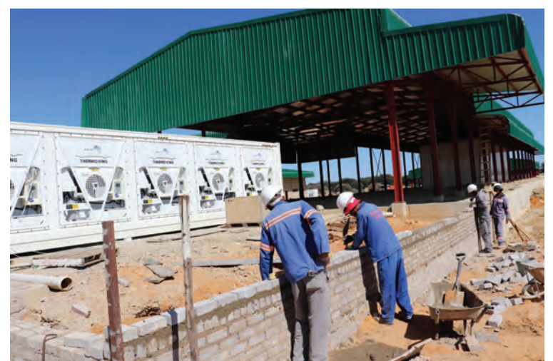
Construction of the Tsabong multispecies abattoir. The project is expected to be handed this month.