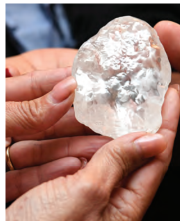
A 1 098.30 carat diamond found at Jwaneng diamond mine.

Another point the president has made is that he wants Botswana to have more shares in the De Beers deal, which has been the envy of many countries, with analysts saying the country has avoided the resource curse, as money accrued from diamonds has been used for