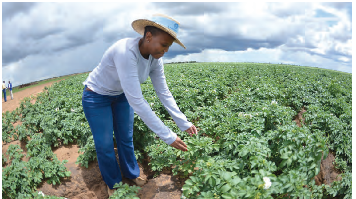
Potato farming in Ghanzi.

According to NDB's Relationship manager and team leader - ISF, about P20 million had