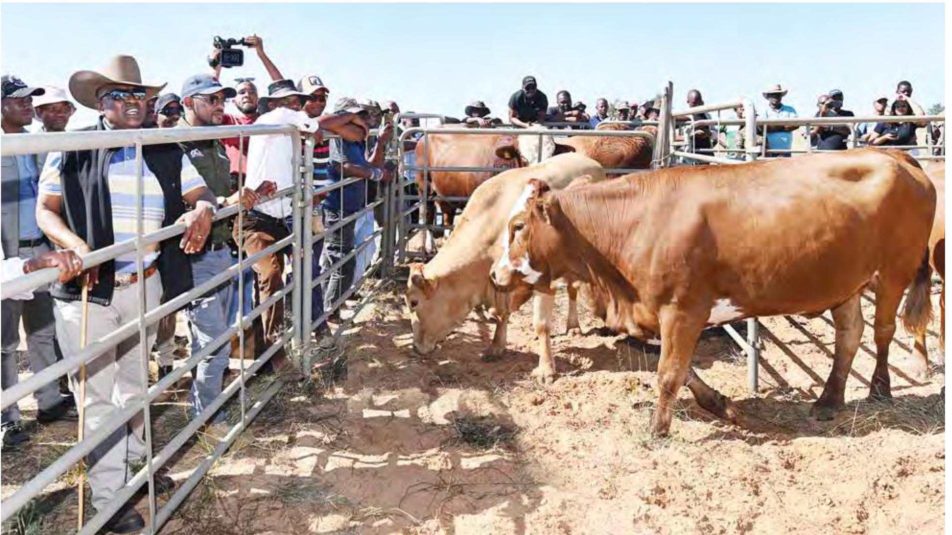
President Dr Mokgweetsi Masisi (left), Minister of Entrepreneurship, Mr Karabo Gare (second left) and farmers during Saturday's Southern District Beef Farmers Association field day at Naledi Farms near Jwaneng. President Masisi extolled the advantages of artificial insemination (AI) over mating and encouraged farmers to take advantage of AI facilities to improve the quality of their breed and consequently that of the national herd. The event was held under the theme: Increasing The National Herd, Unpacking The Beef Value Chain.