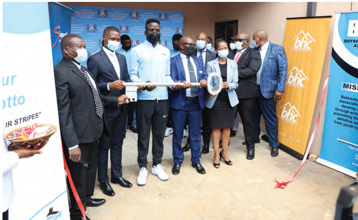
In 2021, members of the Botswana men's 4x400m Olympic relay team were awarded housing units as reward for the team's bronze medal at the Tokyo Olympics.

According to President Masisi, the decision to honour these icons was inspired by their contributions to the country's history and development.