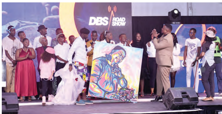
DBS National Roadshow was introduced as a vehicle to inject life back into the creative industry as well as give grassroots creatives an opportunity to shine.

Also, as a way of revitalising the creative sector post COVID-19, government has introduced a youth initiative dubbed Department of Broadcasting Services (DBS) National Roadshow to empower the creative, transport, hospitality and tourism sectors.