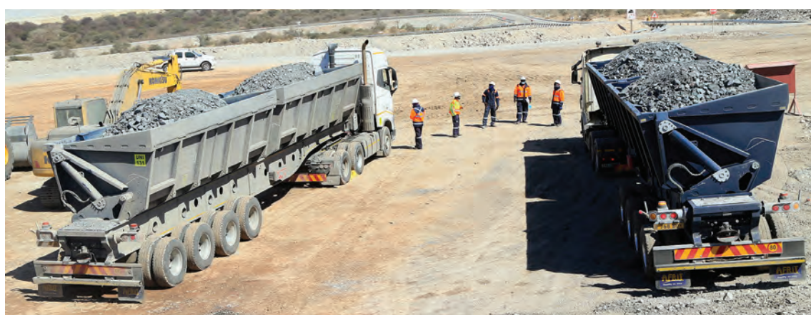
Khoemacau copper mine in Maun.

During the last five years, the country saw the opening of new mines, one being Khoemacau and Motheo Project Open Cast mine in Palapye at the Morupule Coal Mine. Another notable achievement under President Masisi is winning the bid to host the Kimberly Process permanent secretariat. BOPA