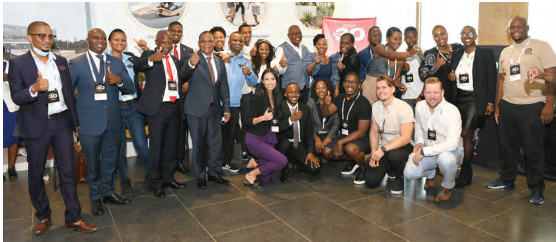
Hosting of Forbes Under 30 summit this month puts Botswana at the centre of entrepreneurship. The summit plays a pivotal role in incubating startups in the country.

Since its launch in October 2020, the initiative has resulted