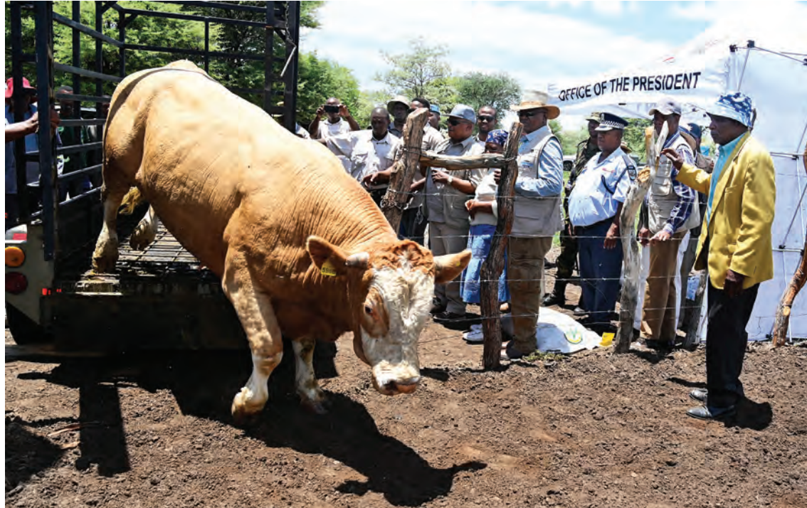
Bull donation in Sekhuthlane.

the 10 300-hectare farm and its facilities as well as restoring its mandate of upskilling Batswana on small stock farming.