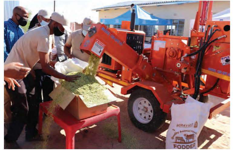
The BORAVAST Sexanana tree harvesting and fodder project in Bokspits would create employment and boost local economic activity.

The second phase will cover Tonota, Palapye, Serowe, Bobirwa, Tlokwen, Ghanzi, Charleshill, Kanye, Mabutsane, Moshupa and South East South sub districts