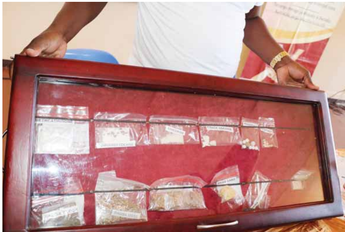
Mr Mmusi said statistics showed that the most prevalent illegal drugs in the country were cannabis and methcathione, commonly known as CAT.

Mr Letsholo also asked the minister to inform Parliament of boreholes around the village and if it would be prioritised for supply from those boreholes. BOPA