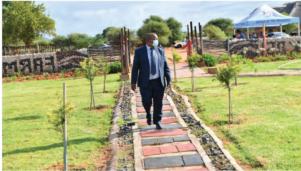
Minister of Transport and Public Works, Mr Eric Molale attending cabinet meeting at one of the farms. Government encourages Batswana to utilise their farms for agro tourism.

Other events that underscore Citizen Economic Empowerment are Makgadikgadi Epic, Khawa Dune Challenge and Cultural